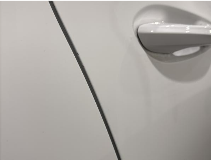
4: Door osr Chipped Edge Chip