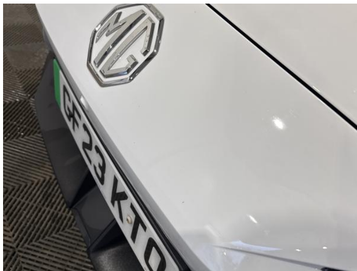
2: Bumper Front Chipped Multiple Chips