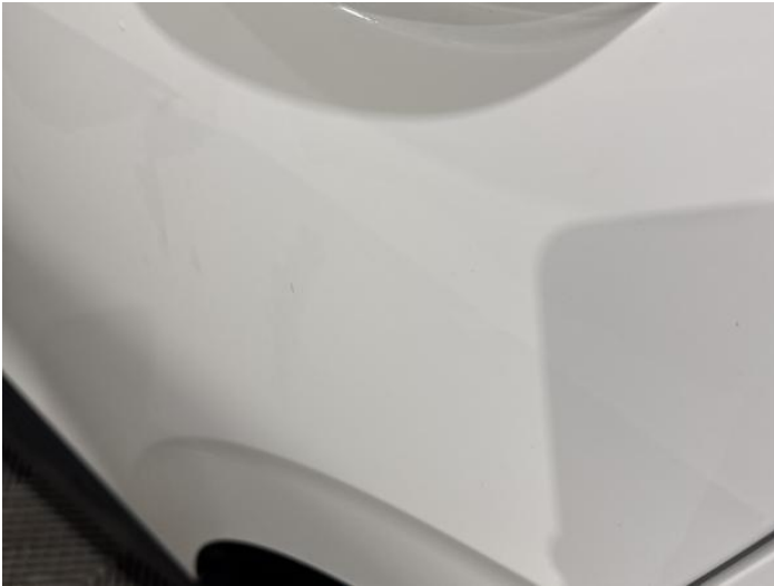
3: Door osr Scratched UpTo 25mm Thru Paint