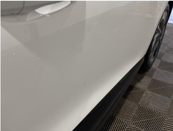
5: Door osf Dented Over 30mm