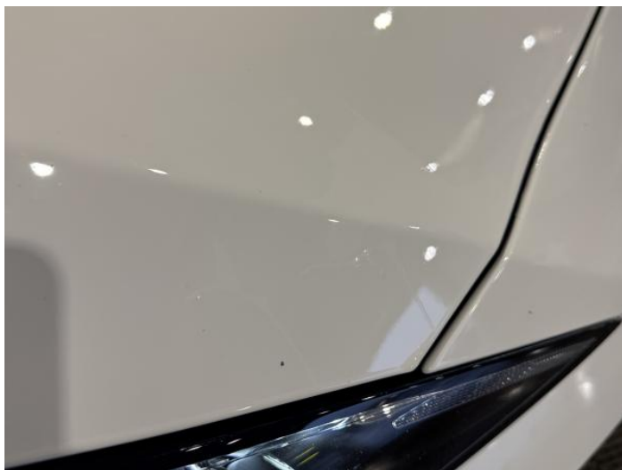
1: Bonnet Chipped 1 To 5