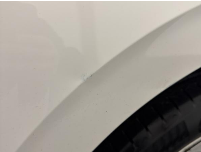
6: Wing osf Scratched UpTo 25mm Thru Paint

Carpet Condition Average Seat Condition Average