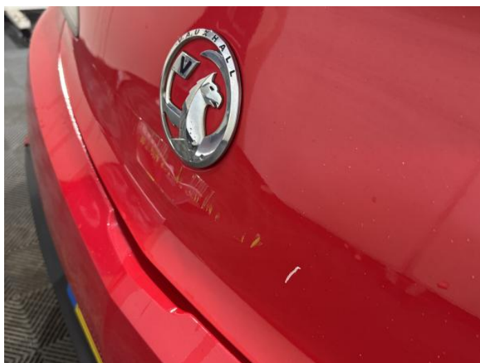
8: Tailgate Dented With Paint Damage