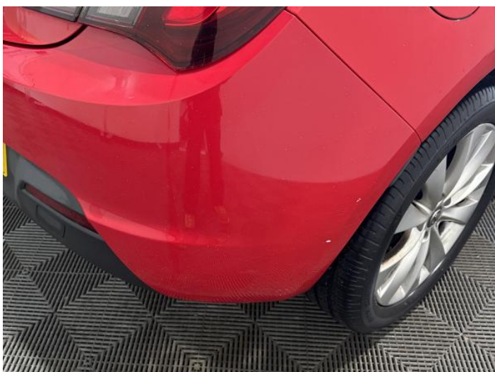
7: Bumper Rear Scratched Over 100mm Thru Paint