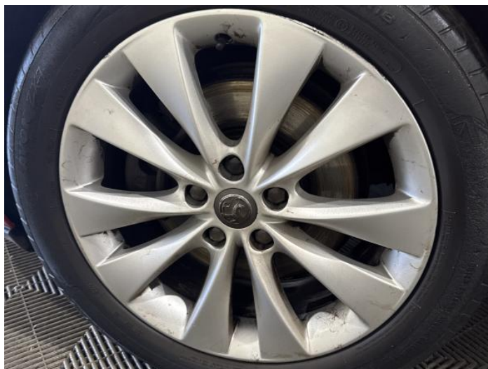
4: Wheel nsf Scratched Up To 50mm