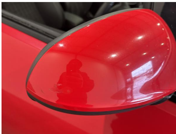
12: Door Mirror Assy nsf Scratched (Painted) UpTo 25mm Thru Paint