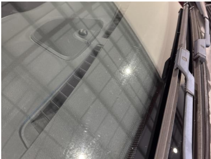
15: Screen Front Chipped UpTo 10mm