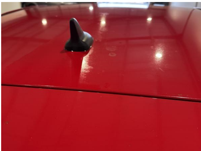
9: Roof Dented Between 10mm + 30mm