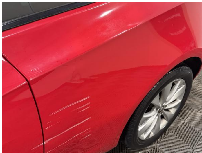
6: Qtr Panel nsr Dented With Paint Damage