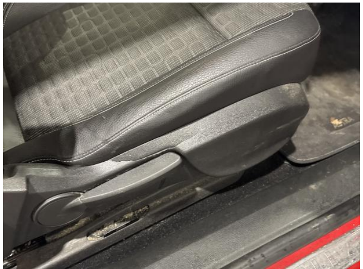
16: Fascia Trim Damaged Replace