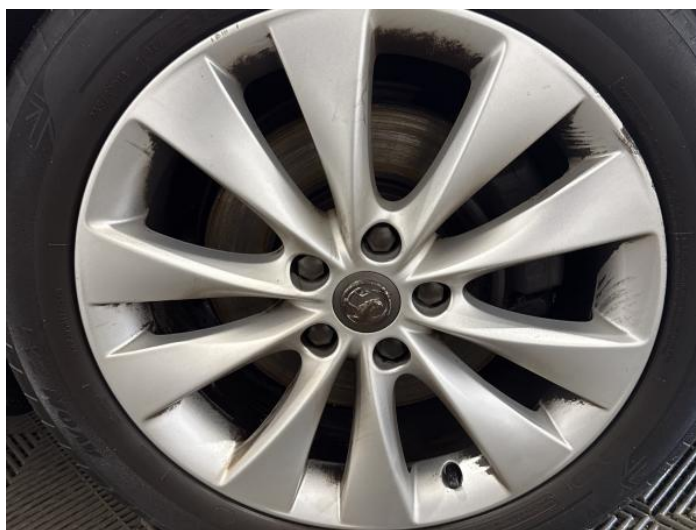
14: Wheel osf Scratched Up To 50mm