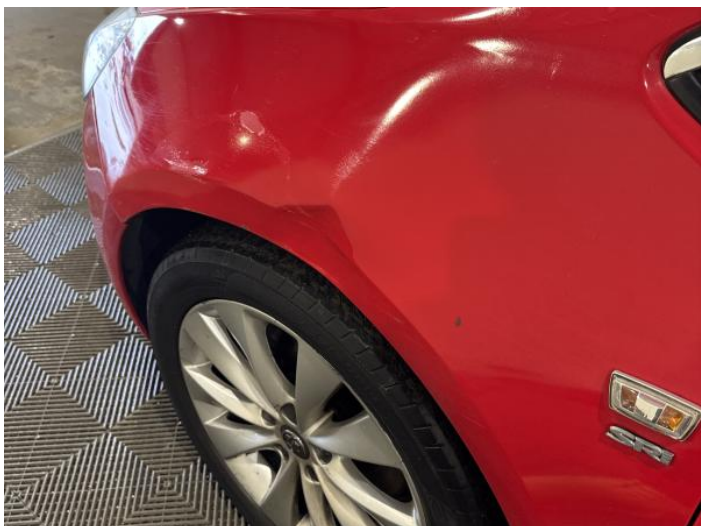
3: Wing nsf Dented With Paint Damage