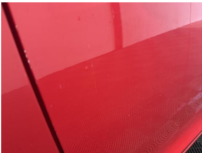
11: Door osf Scratched Over 25mm Thru Paint