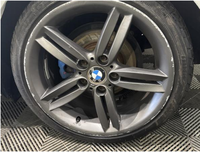
9: Wheel nsr Scratched Over 50mm