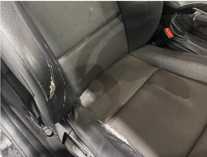
1: Seat Base Cover osf Torn Over 3mm