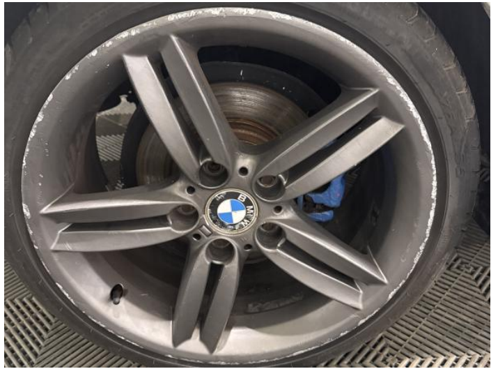
12: Wheel osr Scratched Over 50mm