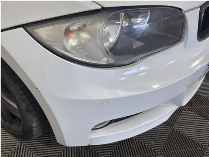
3: Bumper Front Poor Previous Repair Poor Paint