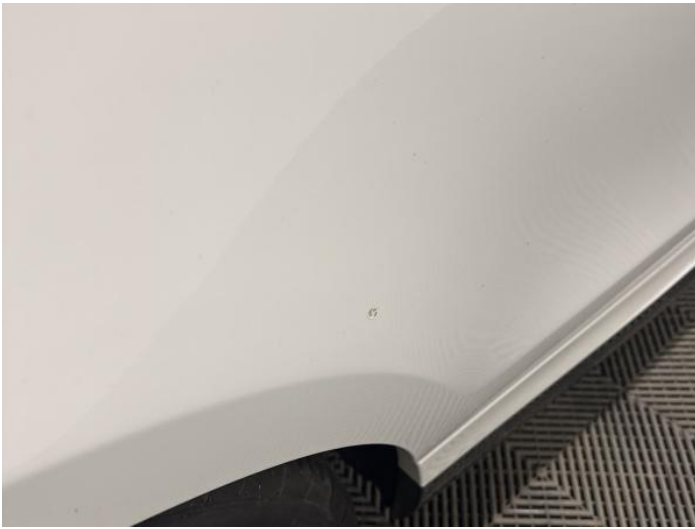
11: Qtr Panel osr Chipped Over 5mm