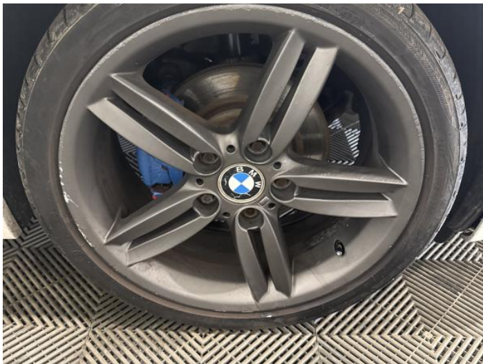
15: Wheel osf Scratched Over 50mm