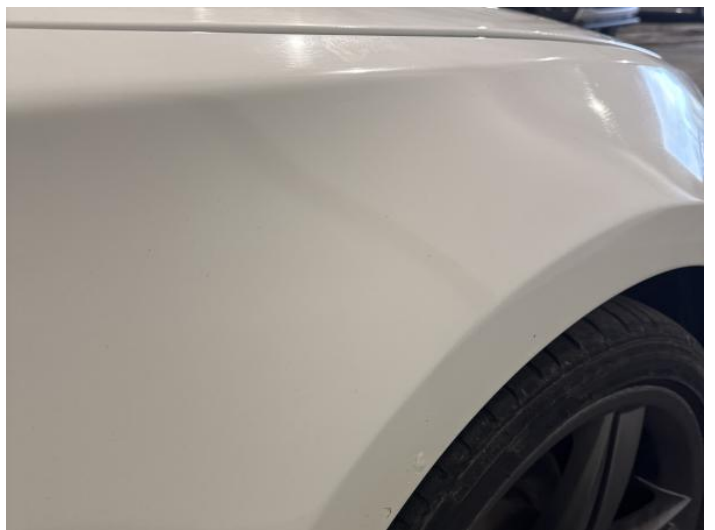
14: Wing osf Poor Previous Repair Rippled UpTo 30%