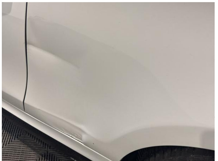
8: Qtr Panel nsr Dented With Paint Damage