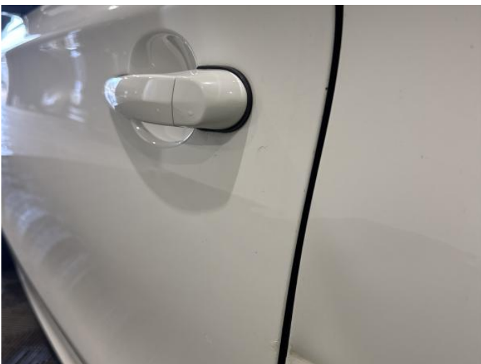
7: Door nsf Scratched Over 25mm Thru Paint