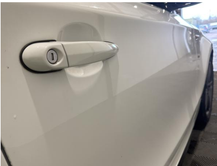
13: Door osf Poor Previous Repair Rippled UpTo 30%