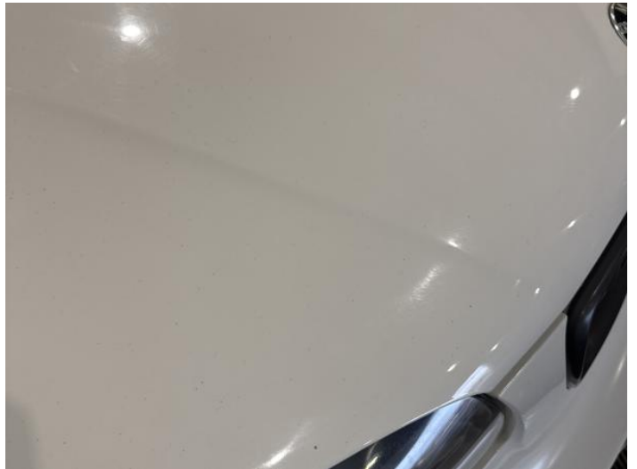
2: Bonnet Chipped Multiple Chips