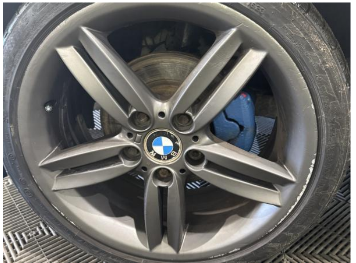
6: Wheel nsf Scratched Over 50mm