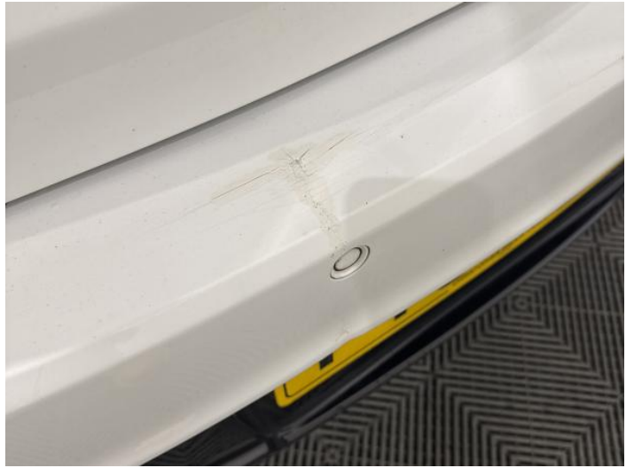
10: Bumper Rear Dented With Paint Damage