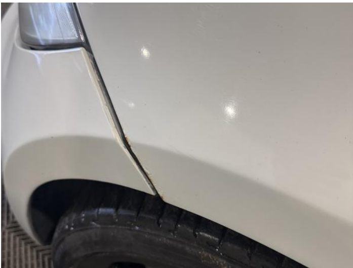
5: Wing nsf Poor Previous Repair Rippled UpTo 30%