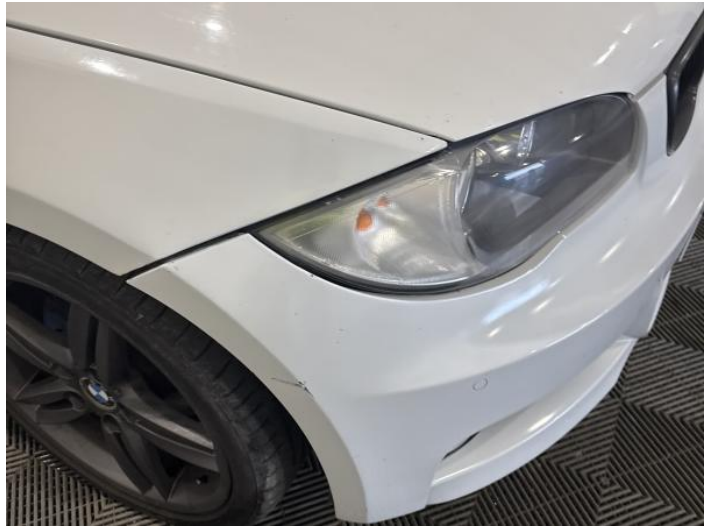
4: Bumper Front Insecure Action Required