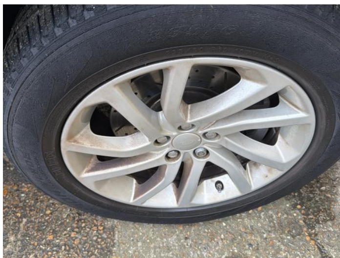
20: Wheel osf Scratched Up To 50mm