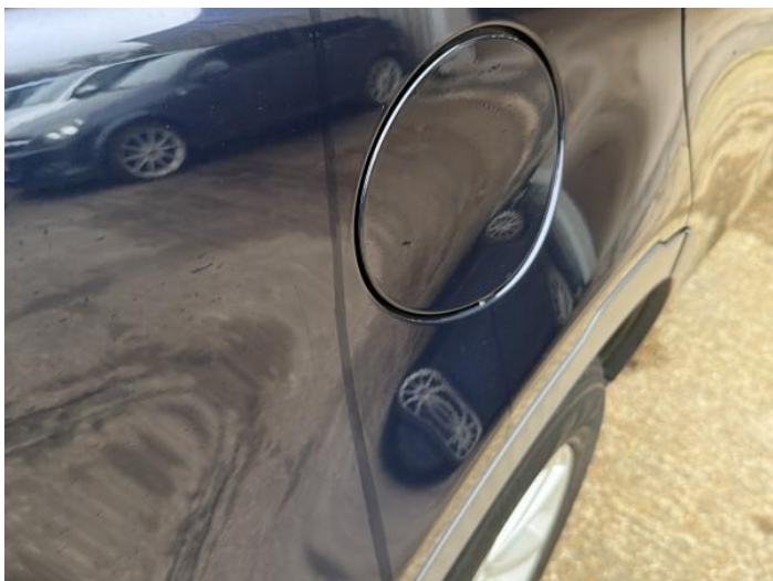
15: Qtr Panel osr Chipped 1 To 5