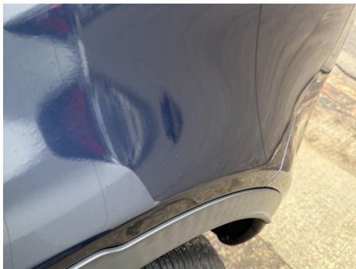
10: Qtr Panel nsr Chipped 1 To 5