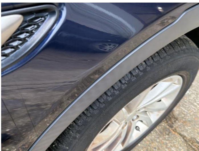
19: Wing osf Chipped 1 To 5