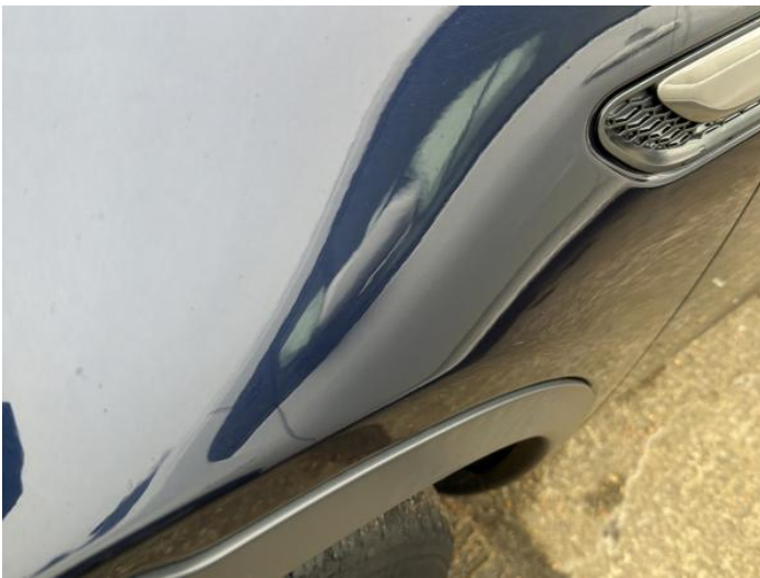
5: Wing nsf Chipped 1 To 5