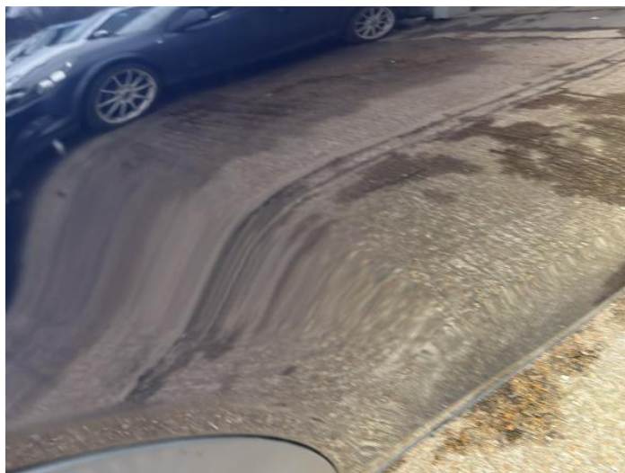
16: Door osr Dented Over 2 UpTo 10mm