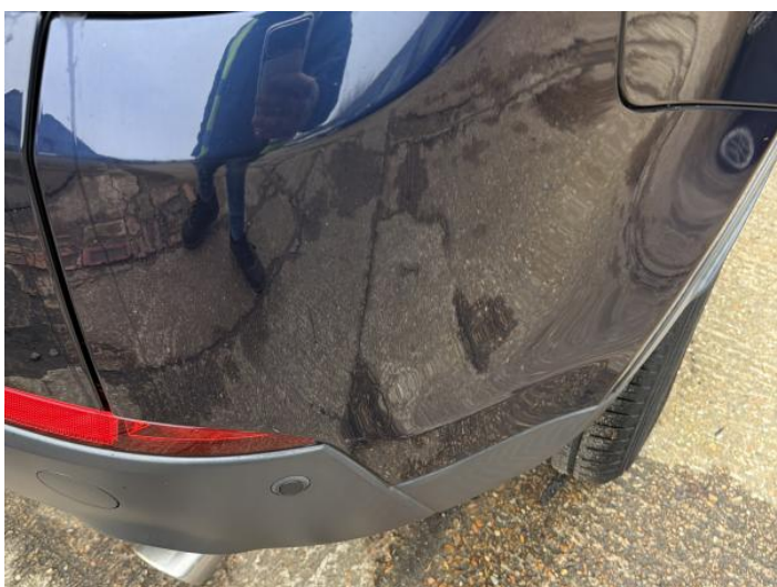
11: Bumper Rear Chipped Multiple Chips