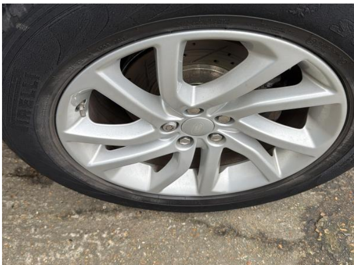
9: Wheel nsr Scratched Up To 50mm