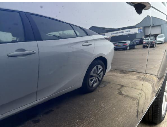
7: Door nsf Dented With Paint Damage