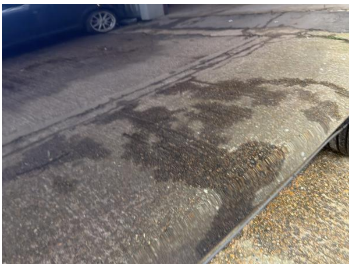
17: Door osf Chipped 1 To 5