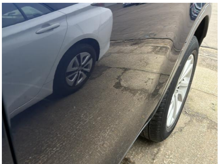
8: Door nsr Scratched Over 25mm Thru Paint