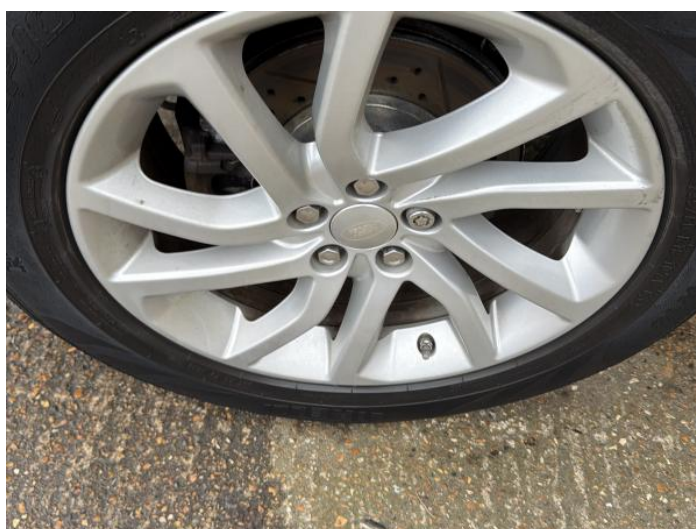
14: Wheel osr Scratched Up To 50mm