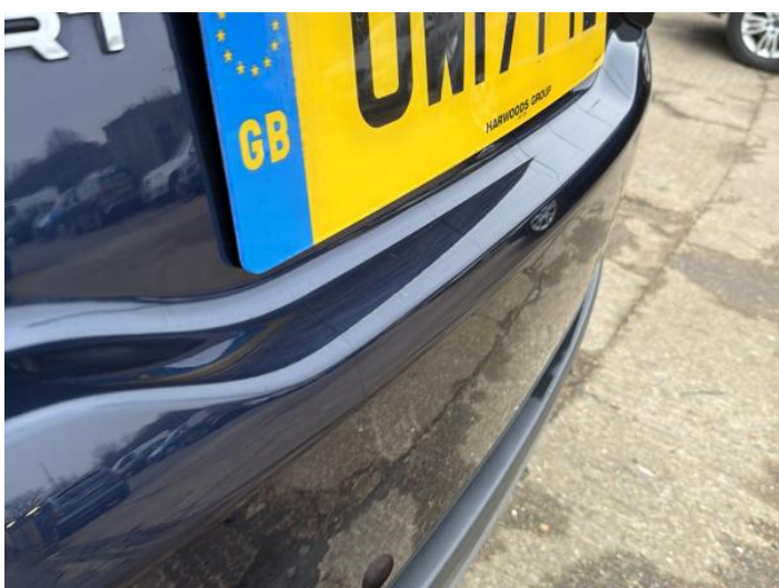
13: Boot Lid Dented Over 2 Up To 10mm