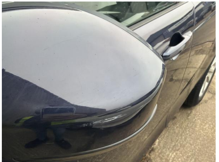
6: Door Mirror Assy nsf Scratched (Painted) UpTo 25mm Thru Paint