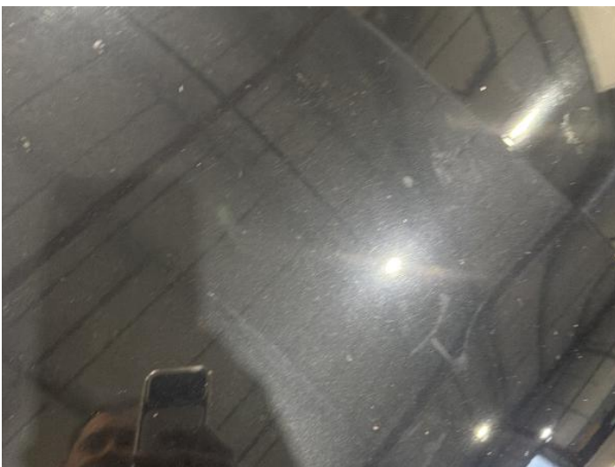
19: Bonnet Chipped Multiple Chips