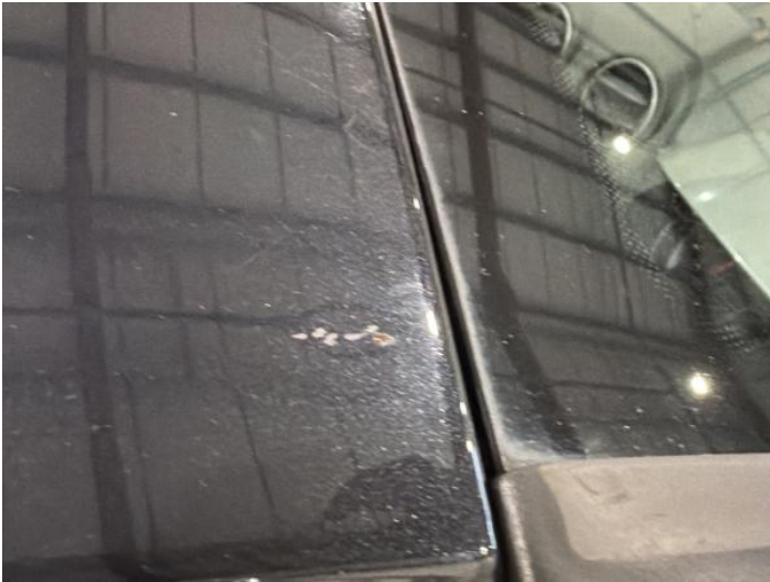
15: Roof Dented With Paint Damage