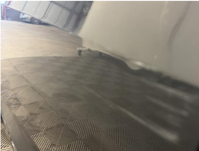
5: Door nsf Dented With Paint Damage