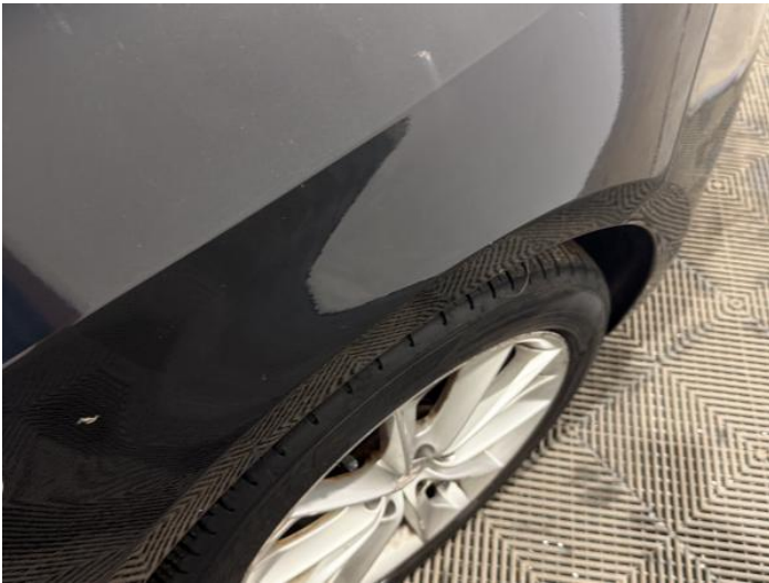
17: Wing osf Chipped Multiple Chips