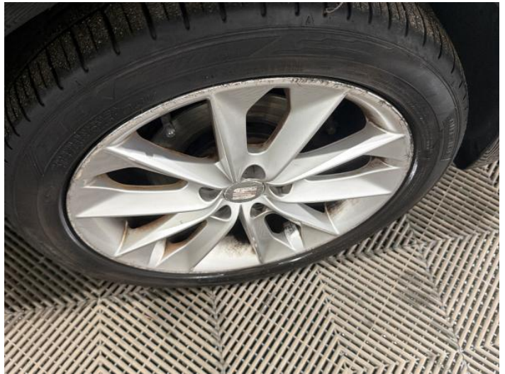
18: Wheel osf Scratched Over 50mm