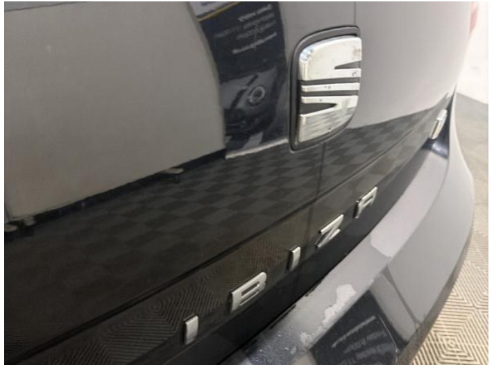
10: Boot Lid Chipped 1 To 5