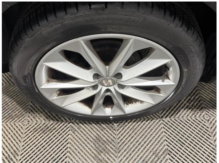
12: Wheel osr Scratched Up To 50mm