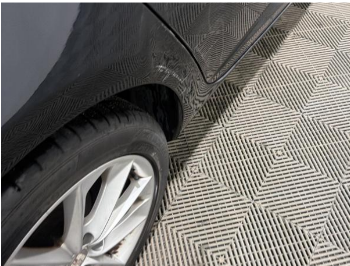
11: Qtr Panel osr Dented With Paint Damage