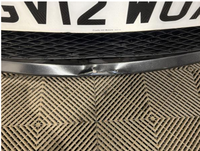
1: Bumper Front Dented With Paint Damage