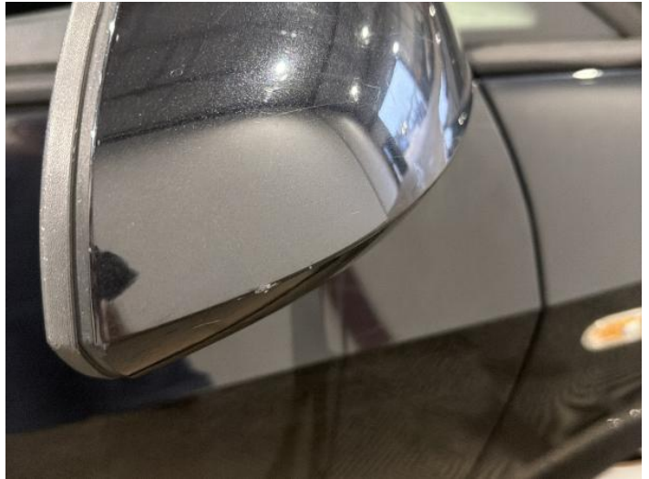
16: Door Mirror Assy osf Scratched (Painted) UpTo 25mm Thru Paint