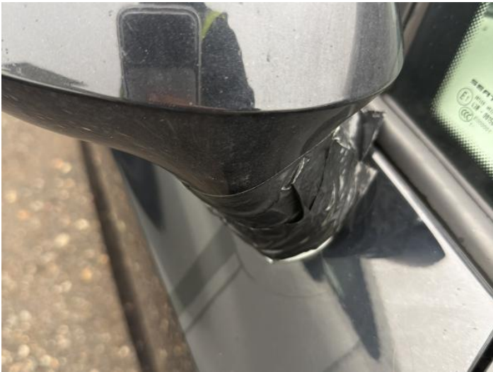
23: Door Mirror Assy osf Broken Replace