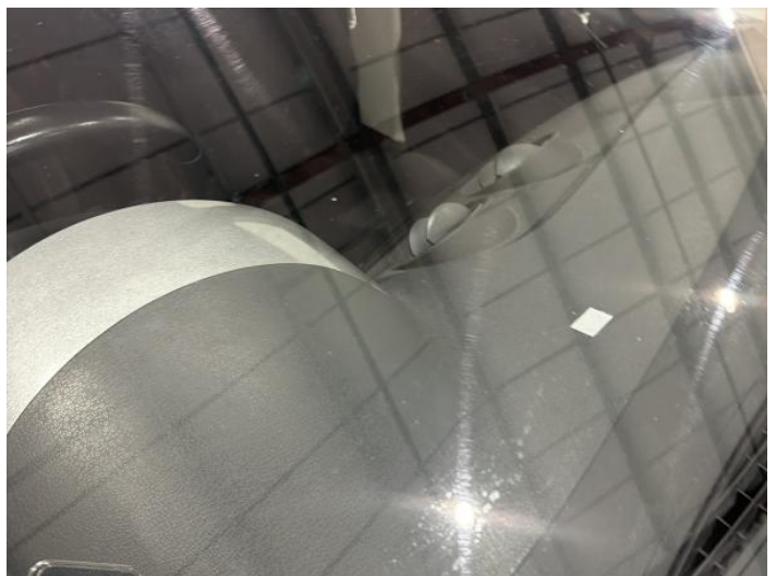
20: Screen Front Chipped UpTo 10mm