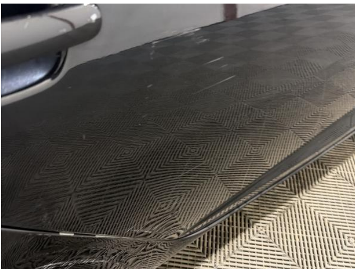
13: Door osr Dented With Paint Damage