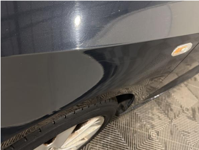
3: Wing nsf Dented With Paint Damage