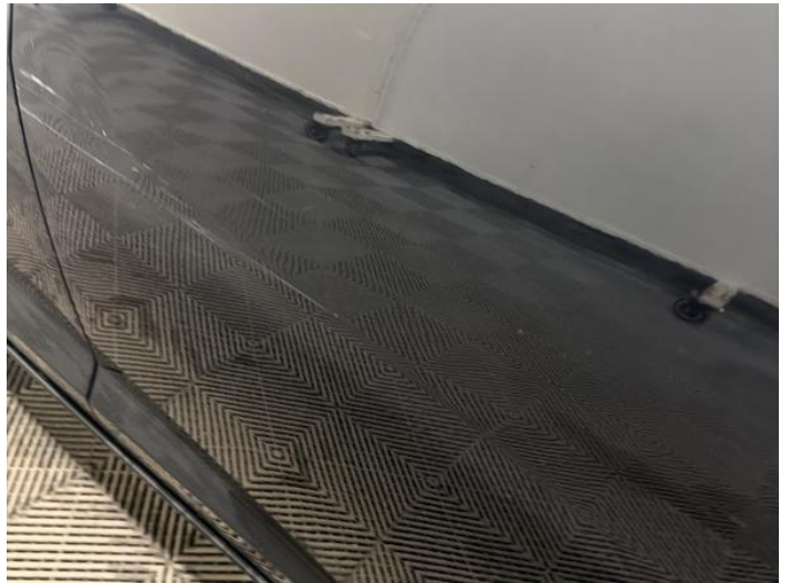
6: Door nsr Dented With Paint Damage