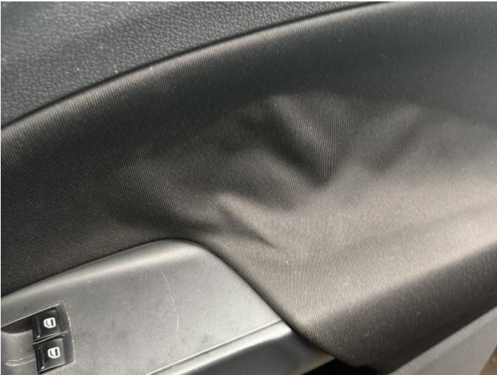
22: Door Pad osf Scuffed UpTo 25mm