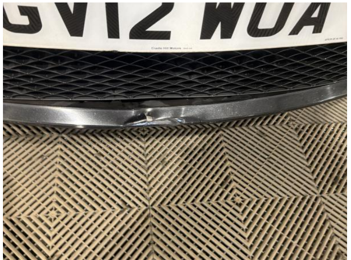
2: Bumper Front Moulding Broken Replace