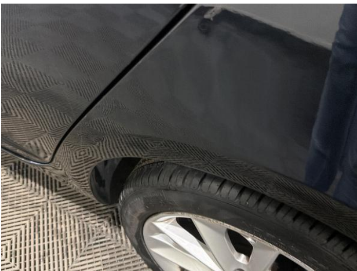
7: Qtr Panel nsr Dented With Paint Damage