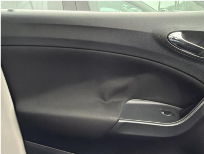
21: Door Pad nsf Scuffed Over 25mm