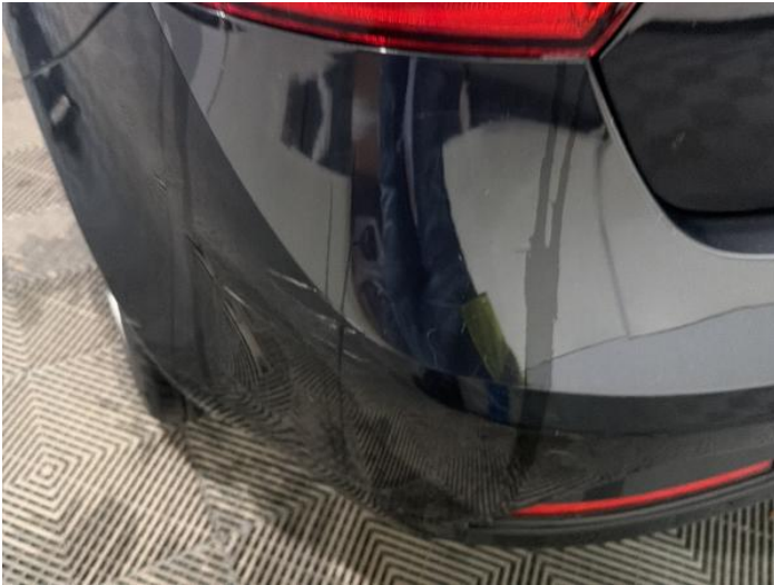
9: Bumper Rear Scratched Over 100mm Thru Paint