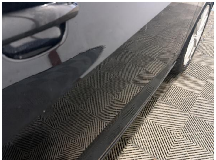
14: Door osf Dented With Paint Damage