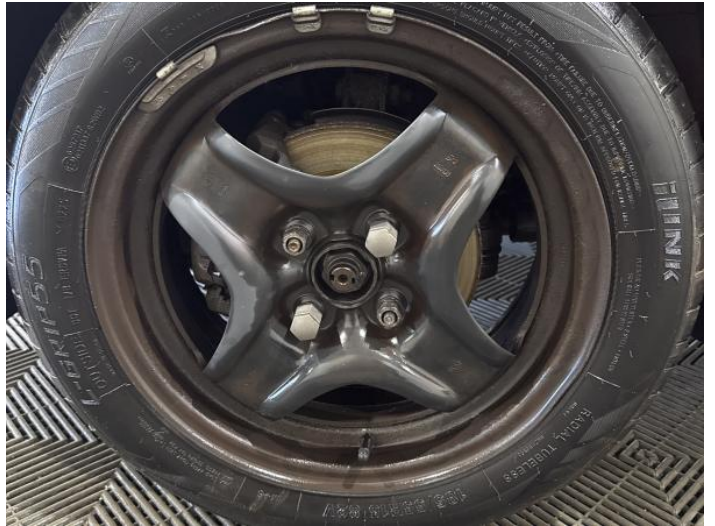
4: Wheel nsf Dented UpTo 30mm (Alloy)