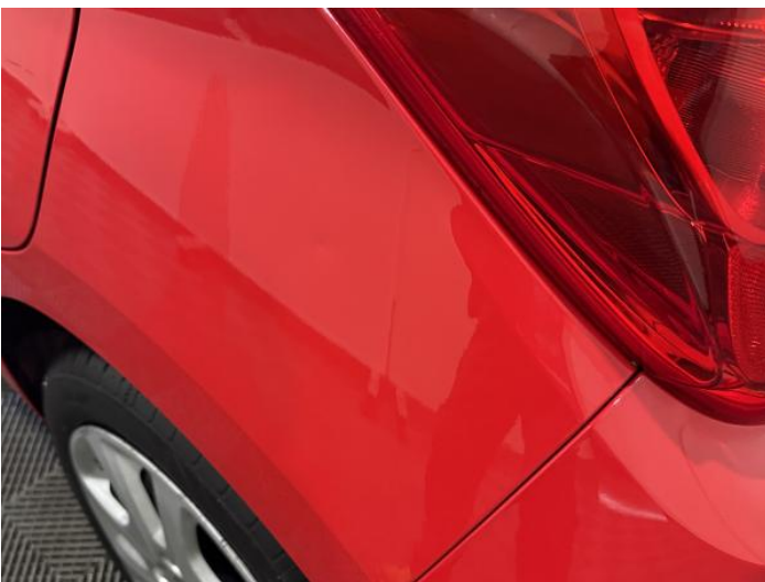
7: Qtr Panel nsr Dented Between 10mm + 30mm