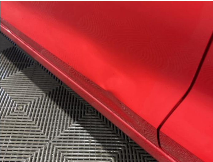
5: Door nsf Dented Over 30mm