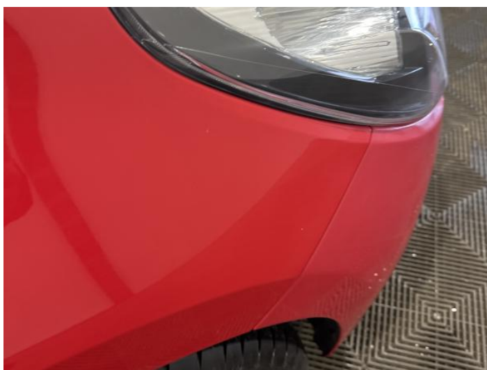
11: Wing osf Chipped 1 To 5