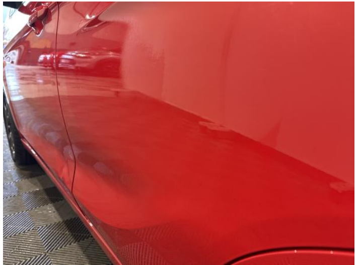
6: Door nsr Dented Over 30mm