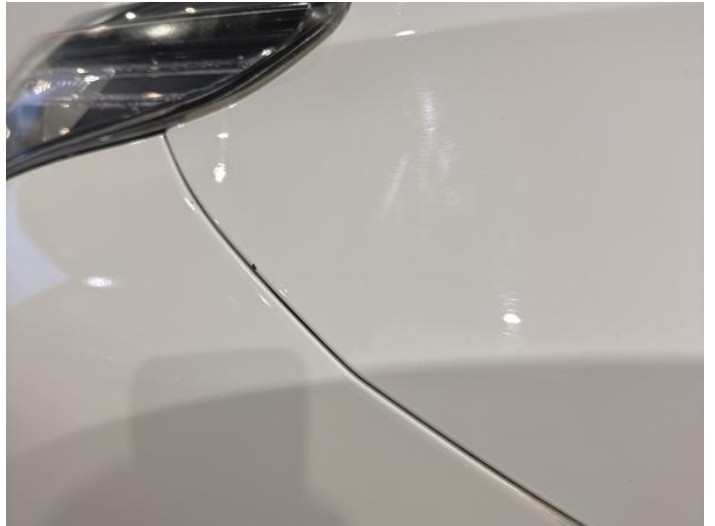
4: Wing nsf Chipped 1 To 5