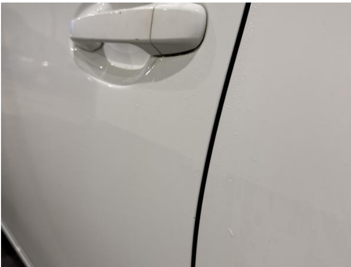
5: Door nsf Chipped Edge Chip