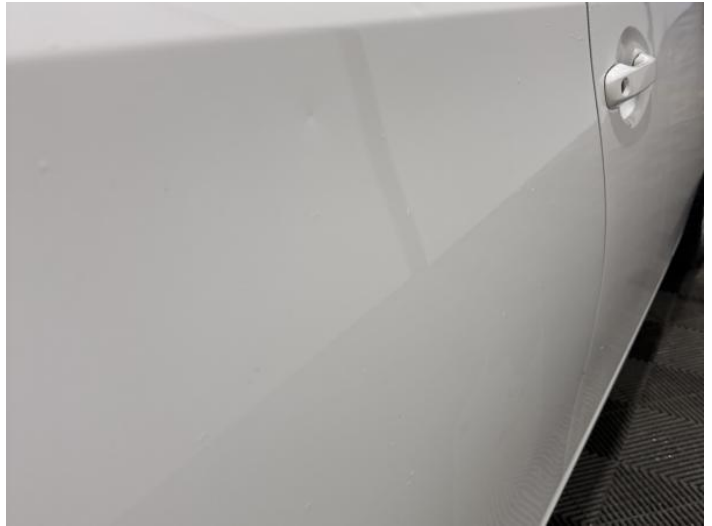
10: Door osr Dented Between 10mm + 30mm