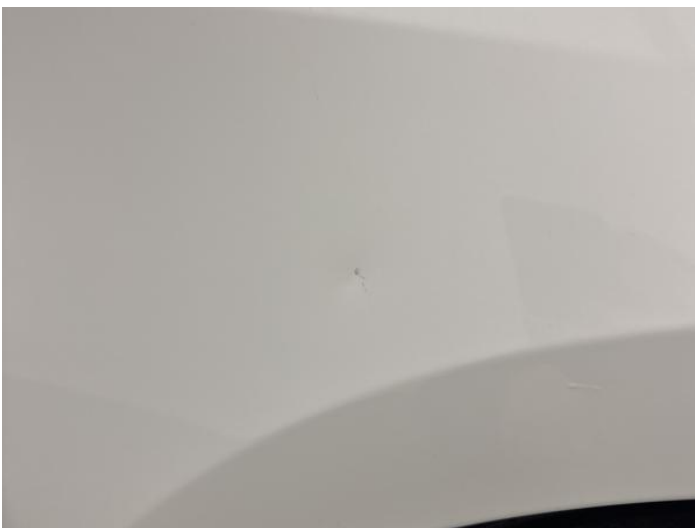
13: Wing osf Scratched UpTo 25mm Thru Paint