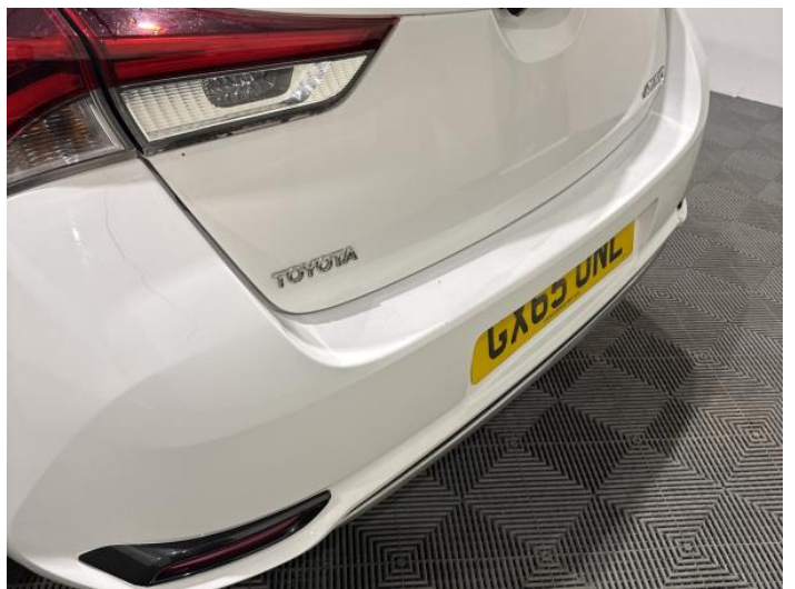
8: Bumper Rear Scratched 25 to 100mm Thru Paint