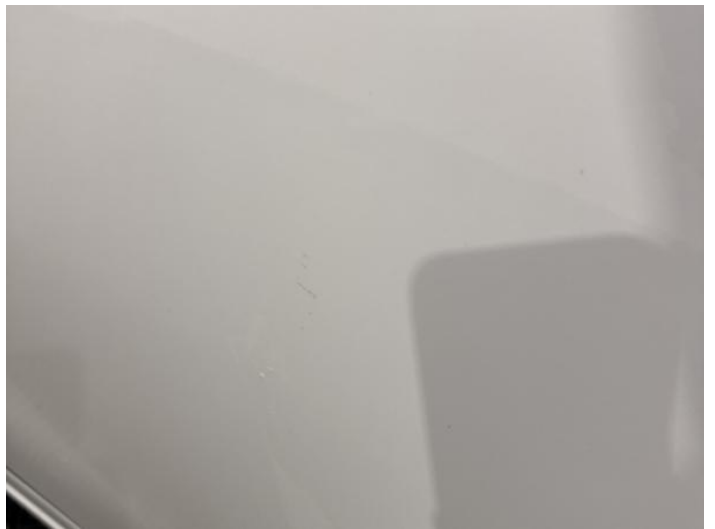
6: Door nsr Scratched Up To 25mm Thru Paint