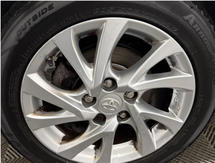
9: Wheel osr Scratched Over 50mm