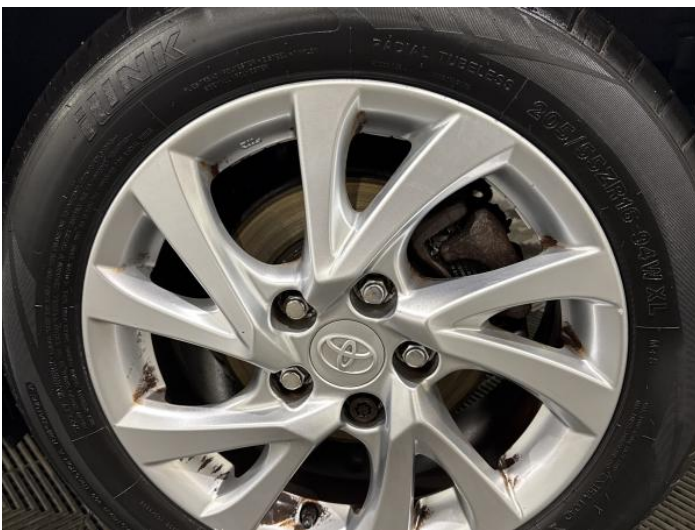
7: Wheel nsr Scratched Up To 50mm