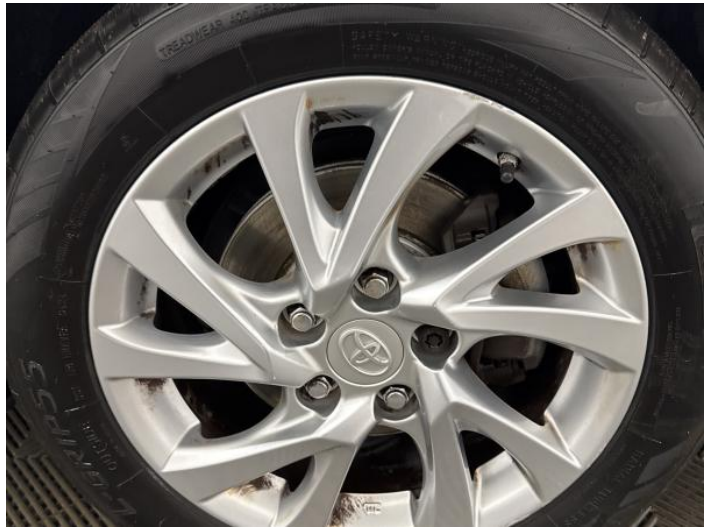
12: Wheel osf Scratched Over 50mm