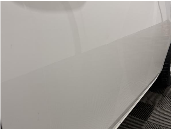
11: Door osf Dented Between 10mm + 30mm