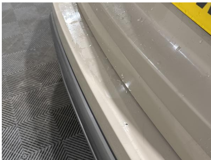
6: Bumper Rear Scratched 25 to 100mm Thru Paint