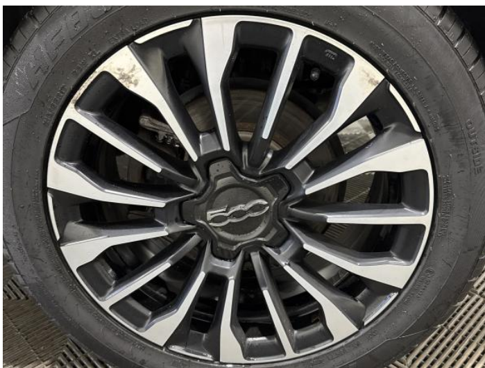
5: Wheel nsr Scratched Over 50mm