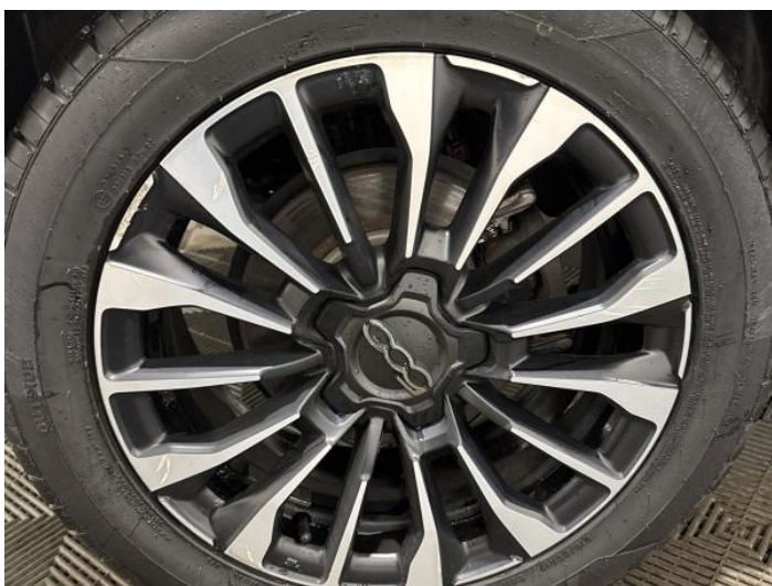
7: Wheel osr Scratched Over 50mm