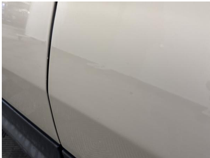
4: Door nsr Dented Between 10mm + 30mm