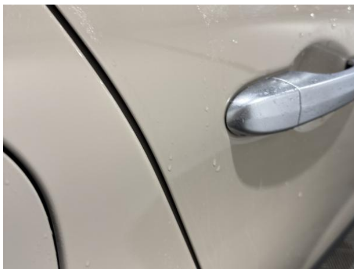
8: Door osr Chipped Edge Chip