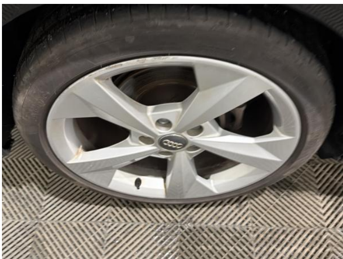
17: Wheel osr Scratched Over 50mm