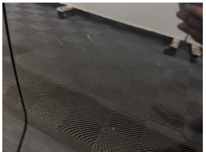
8: Door nsr Chipped 1 To 5