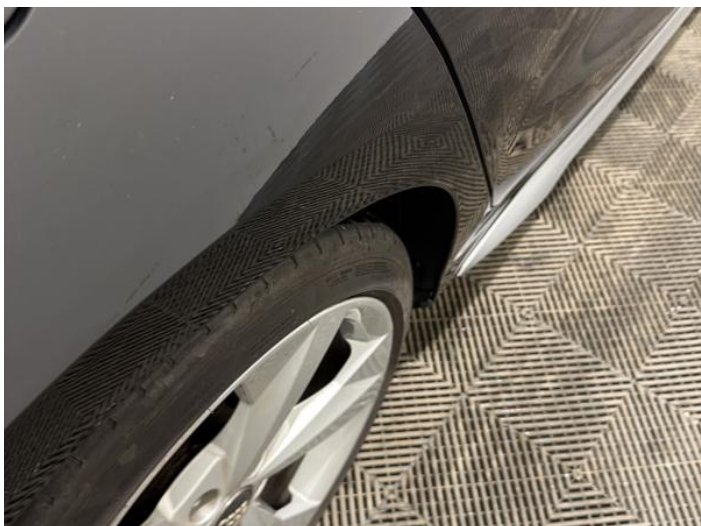
15: Qtr Panel osr Dented 2 Or Less UpTo 10mm