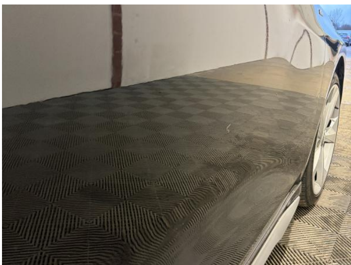
19: Door osf Poor Previous Repair Poor Paint