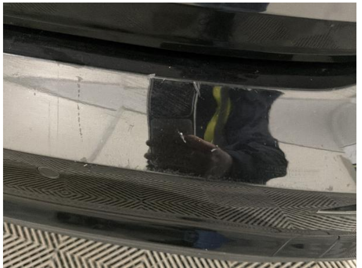
11: Qtr Panel nsr Scratched Over 25mm Not Thru Paint