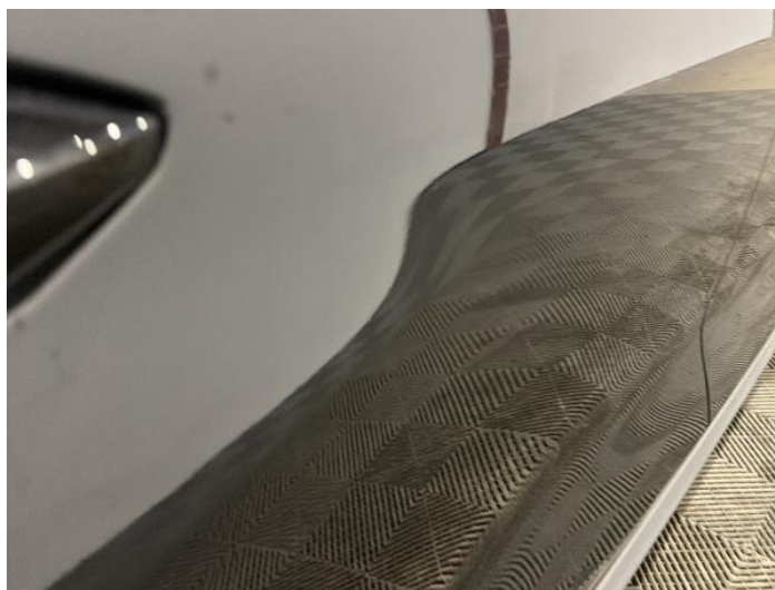
18: Door osr Poor Previous Repair Poor Paint