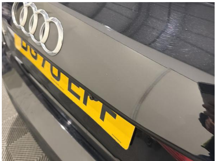
13: Bumper Rear Scratched Over 25mm Not Thru Paint