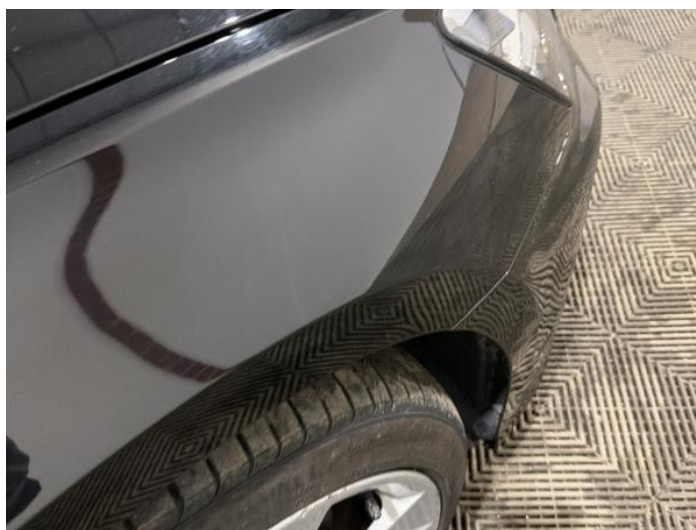
20: Wing osf Chipped 1 To 5