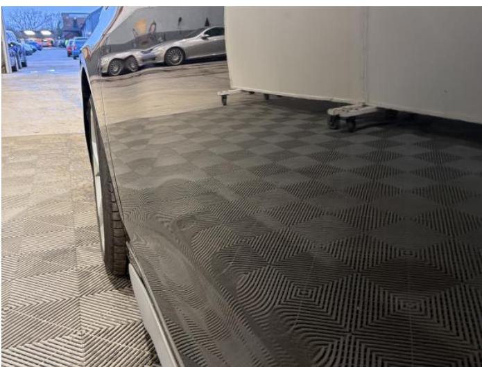
7: Door nsf Dented 2 Or Less UpTo 10mm