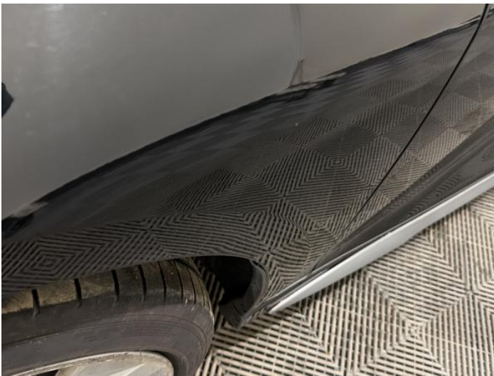
5: Wing nsf Dented Over 2 UpTo 10mm