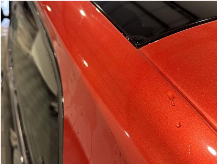
9: B Post ns Dented Between 10mm + 30mm