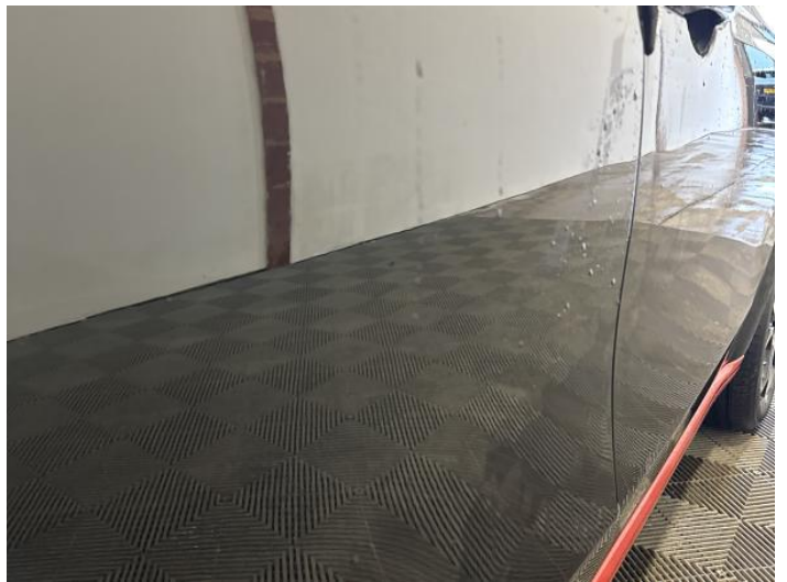
12: Door osr Scratched Over 25mm Thru Paint