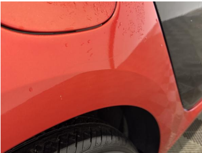
11: Qtr Panel osr Chipped 1 To 5