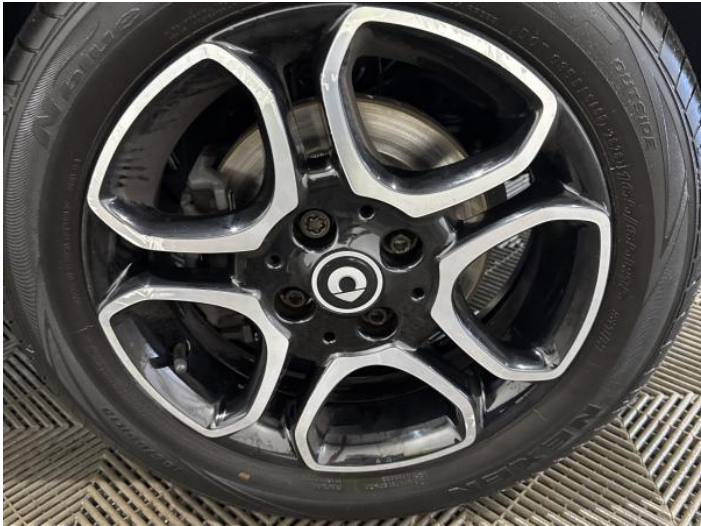
16: Wheel osf Scratched Over 50mm