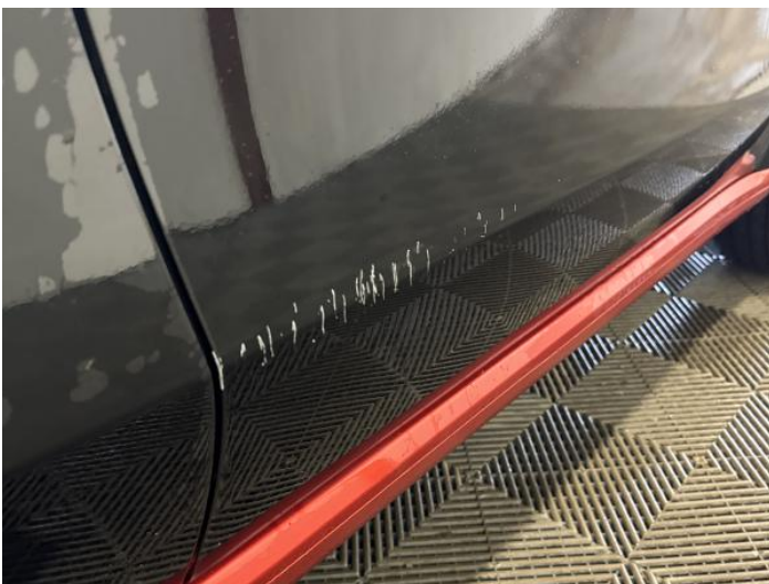
13: Door osf Scratched Over 25mm Thru Paint