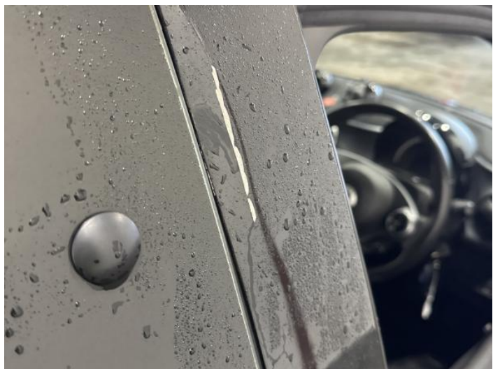
14: Door osf Dented Over 30mm