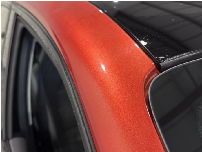
15: A Post os Dented Over 30mm