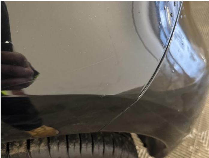
17: Wing osf Scratched Over 25mm Thru Paint

Carpet Condition Average Seat Condition Average