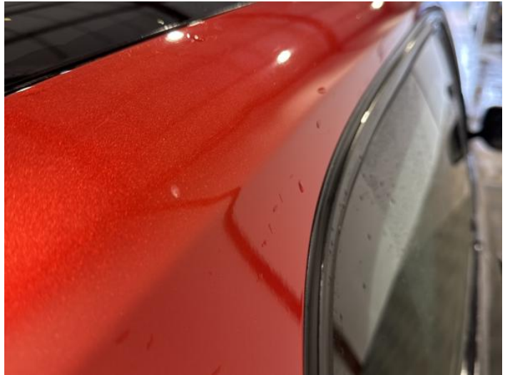
10: B Post os Dented Over 30mm