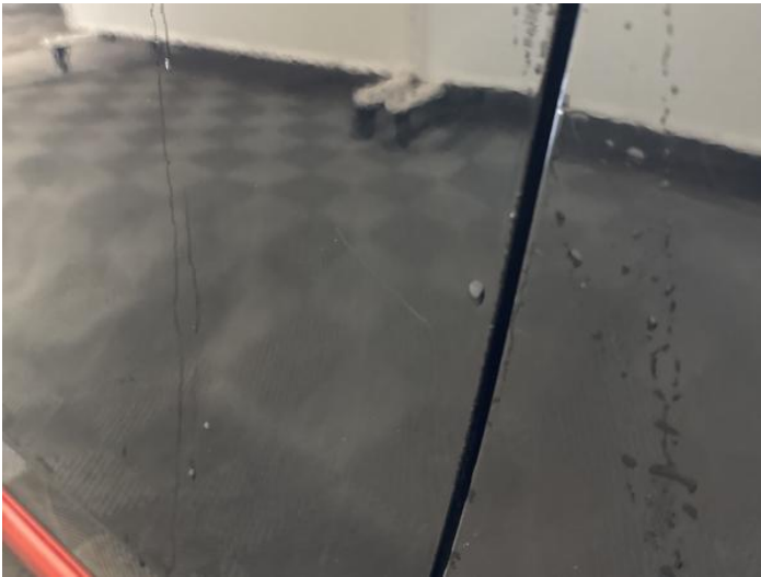
5: Door nsf Scratched UpTo 25mm Thru Paint