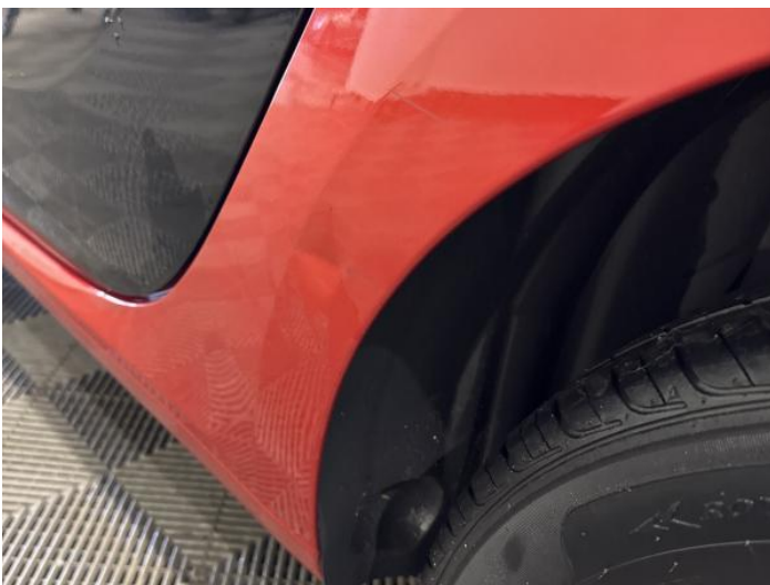
7: Qtr Panel nsr Dented Over 30mm