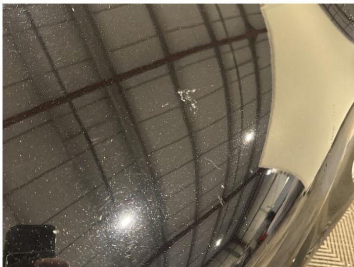
1: Bonnet Scratched UpTo 25mm Thru Paint