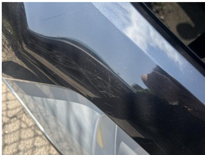
2: Bumper Rear Scratched Over 25mm Not Thru Paint