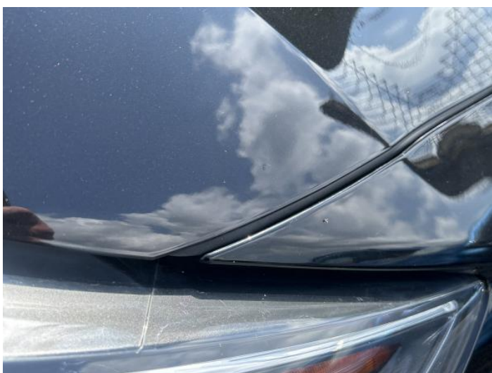
5: Bonnet Chipped 1 To 5