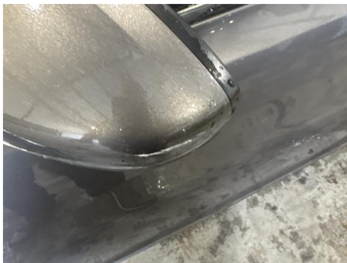
6: Door Mirror Assy nsf Scratched (Painted) Over 25mm Thru Paint