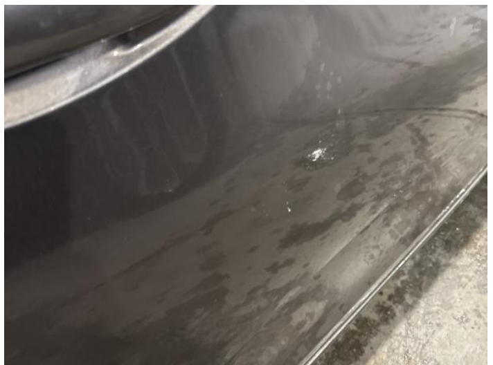
14: Door osf Chipped 1 To 5