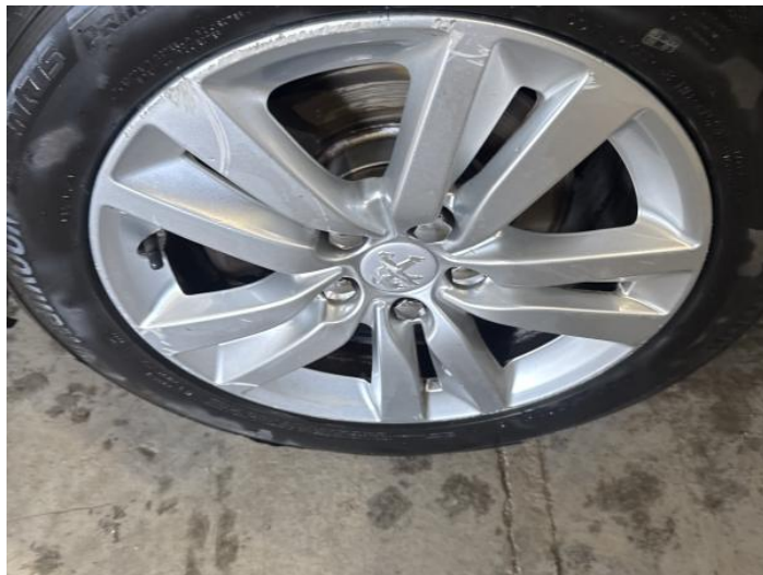
4: Wheel nsf Scratched Over 50mm