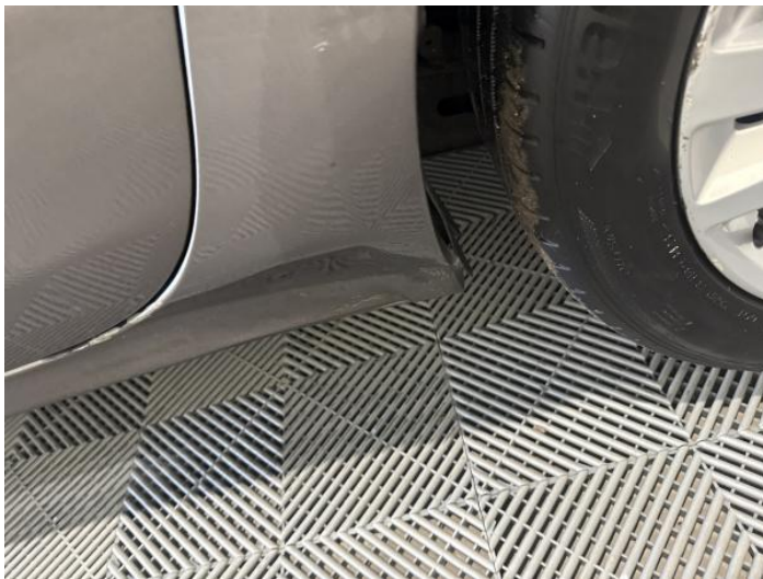
17: Sill ns Dented Over 30mm