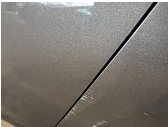
7: Door nsr Scratched Over 25mm Thru Paint