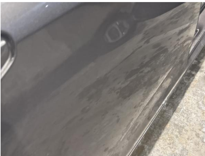
13: Door osr Chipped 1 To 5