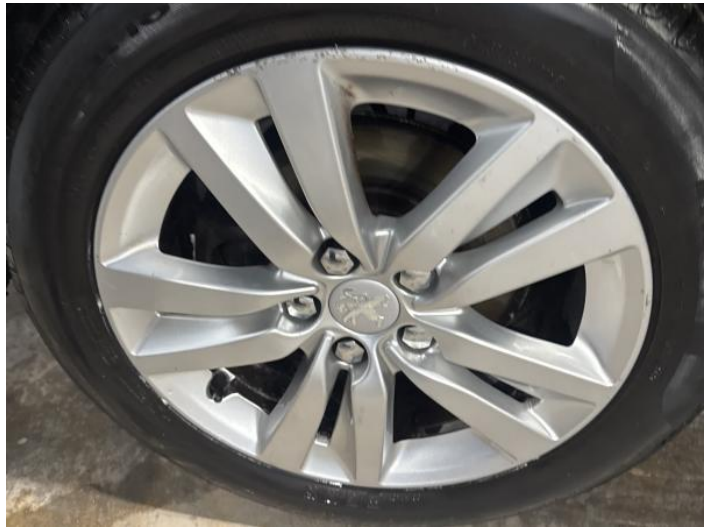
12: Wheel osr Scratched Up To 50mm