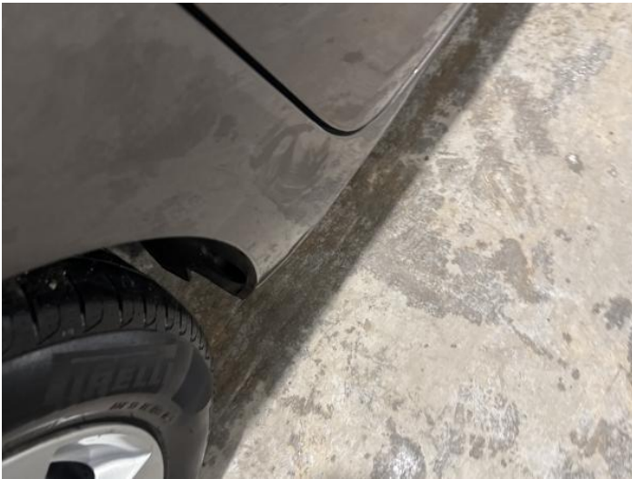
11: Qtr Panel osr Dented Over 30mm