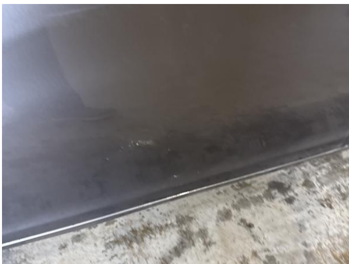
5: Door nsf Scratched UpTo 25mm Not Thru Paint