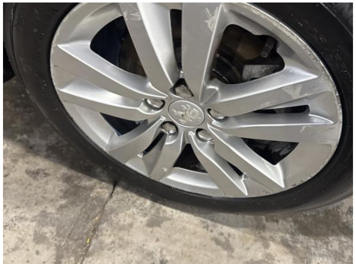
16: Wheel osf Scratched Over 50mm