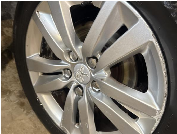
9: Wheel nsr Scratched Over 50mm