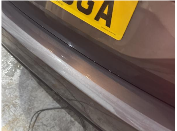
10: Bumper Rear Scratched 25 to 100mm Thru Paint