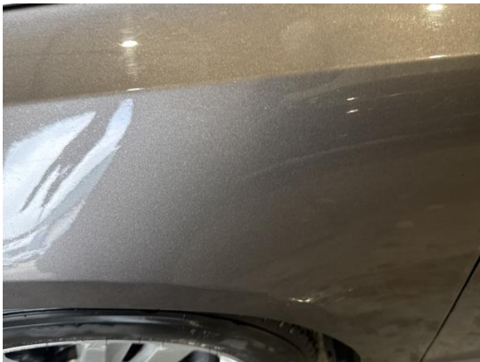
3: Wing nsf Scratched Over 25mm Not Thru Paint