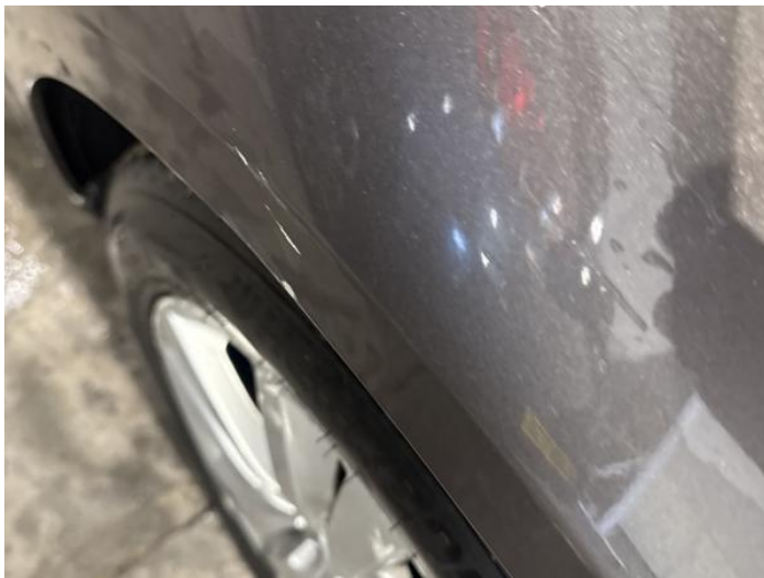
15: Wing osf Dented With Paint Damage