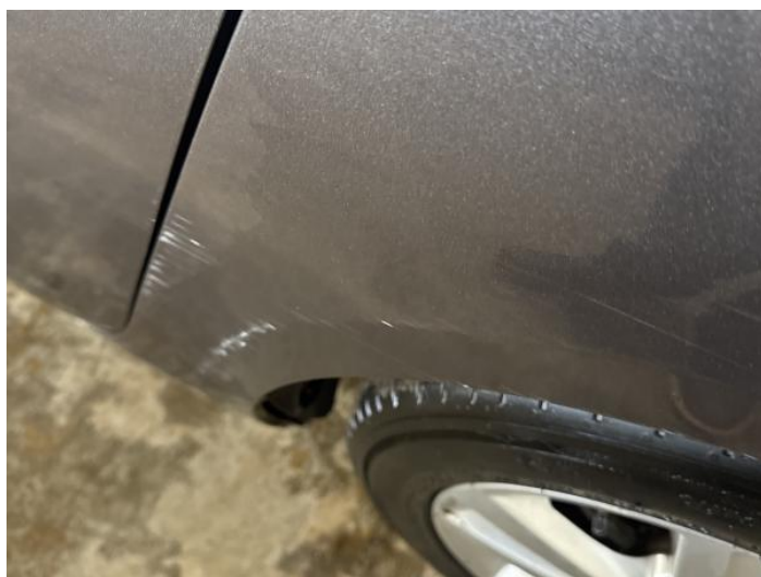
8: Qtr Panel nsr Dented With Paint Damage