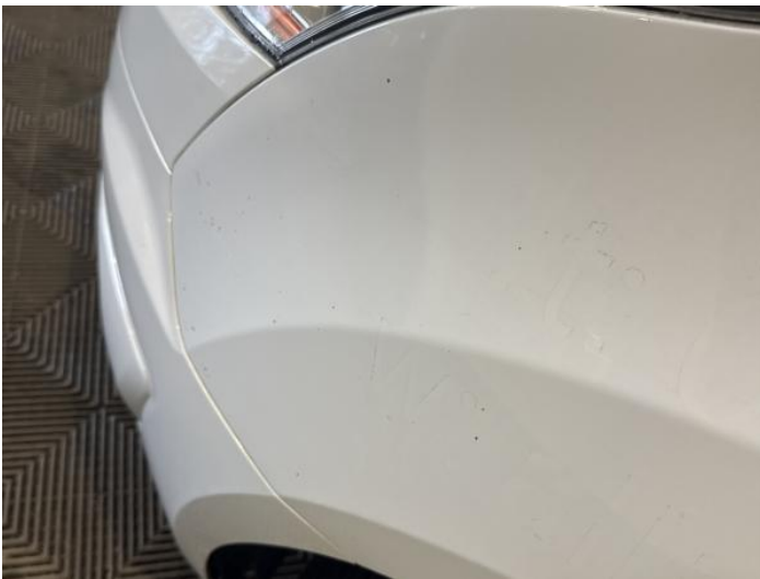
5: Wing nsf Chipped Multiple Chips