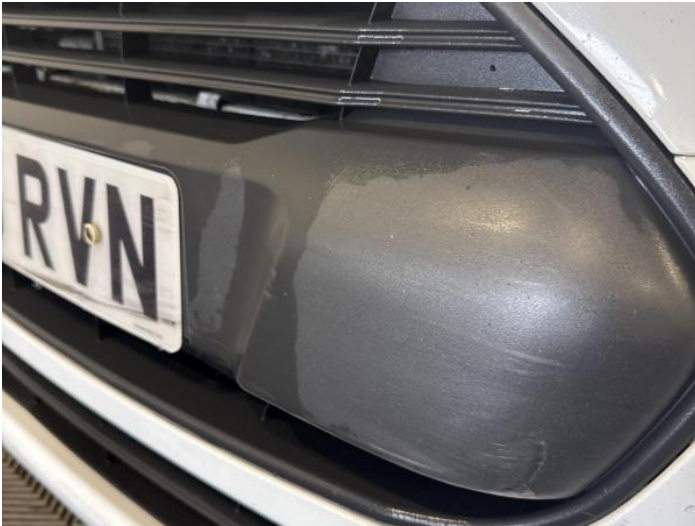
3: Bumper Front Moulding Scuffed (Unpainted) Over 100mm