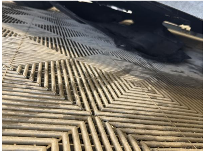
4: Other N/A N/A