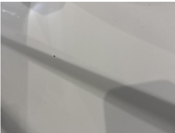
7: Door nsf Scratched UpTo 25mm Thru Paint