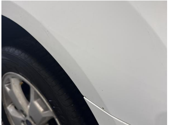
10: Qtr Panel nsr Scratched Rusted