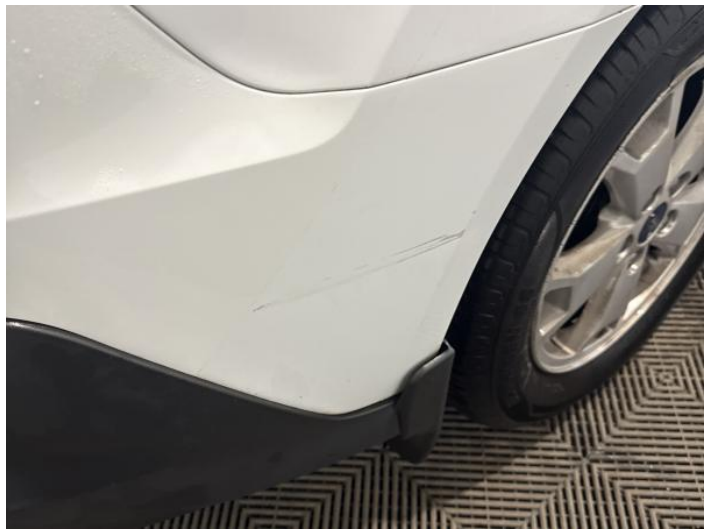
12: Bumper Rear Scratched 25 to 100mm Thru Paint