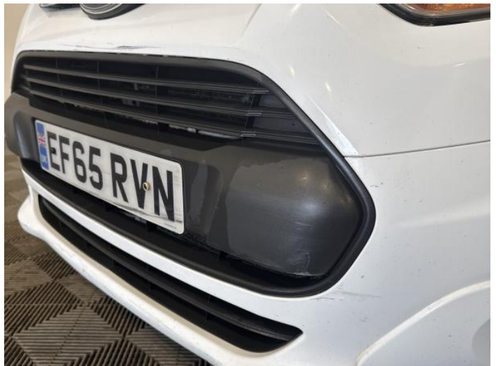
2: Bumper Front Scratched Over 100mm Thru Paint