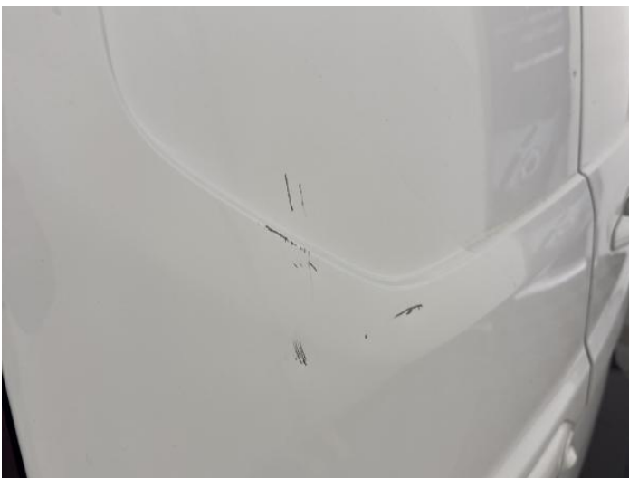
13: Tailgate Dented With Paint Damage