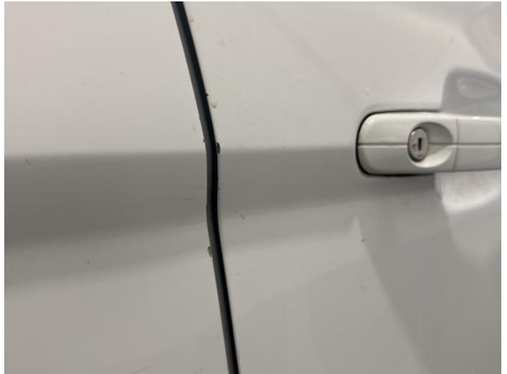
16: Door osf Chipped Edge Chip