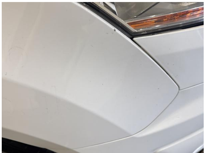
20: Wing osf Chipped Multiple Chips