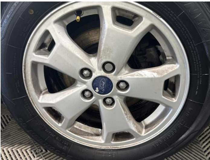
11: Wheel nsr Scratched Over 50mm