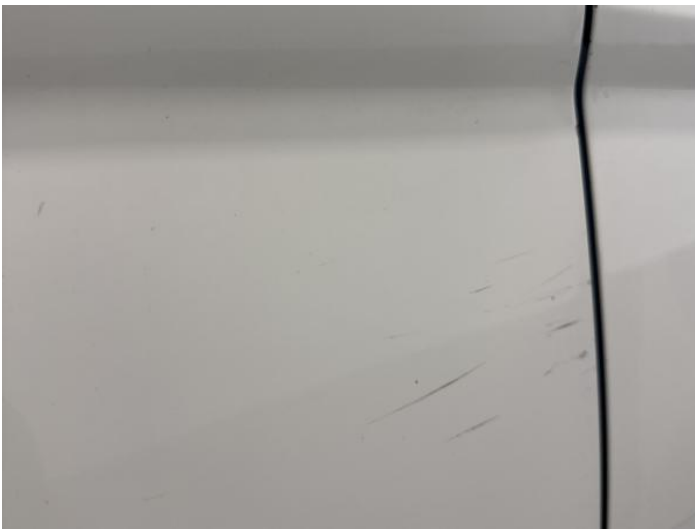
17: Panel Front Scratched Over 25mm Thru Paint