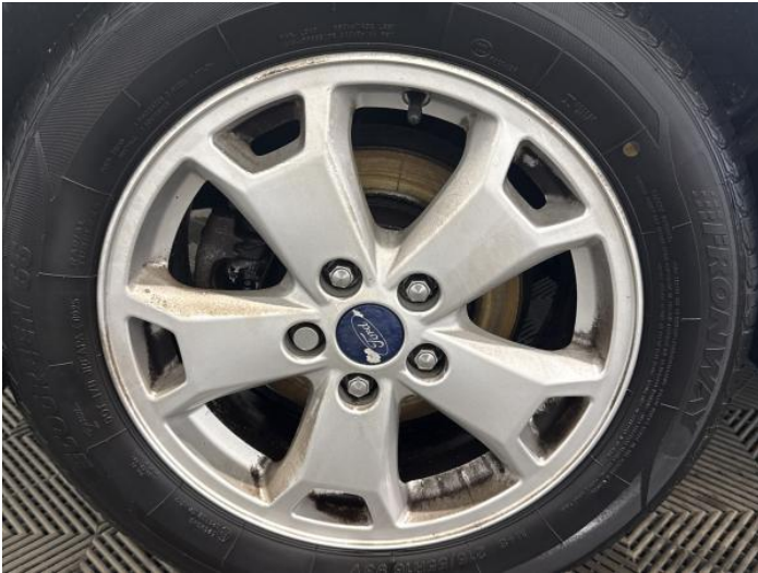
15: Wheel osr Scratched Up To 50mm