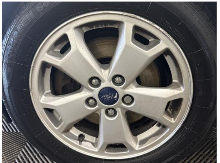
6: Wheel nsf Scratched Over 50mm