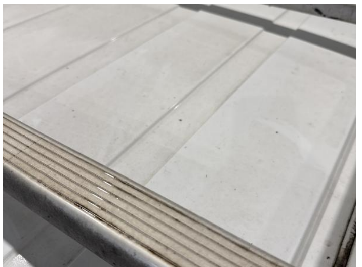
8: Roof Dented Over 30mm