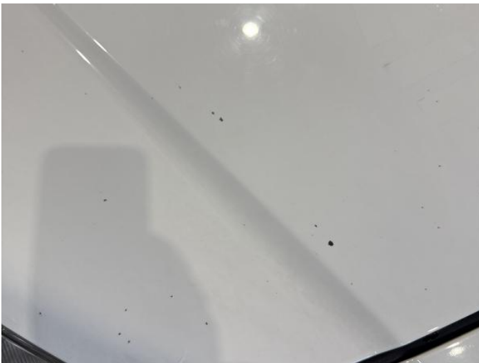
1: Bonnet Chipped Multiple Chips