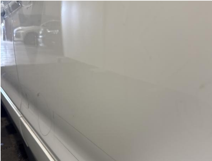
9: Door nsr Dented Between 10mm + 30mm