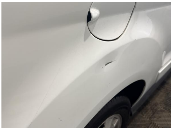
14: Qtr Panel osr Dented With Paint Damage