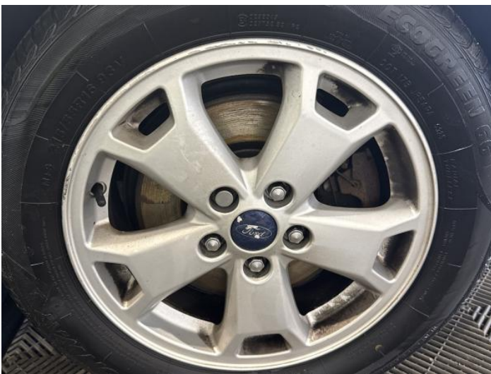
19: Wheel osf Scratched Over 50mm