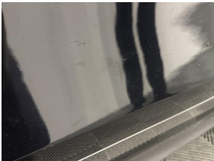
7: Door osf Chipped 1 To 5