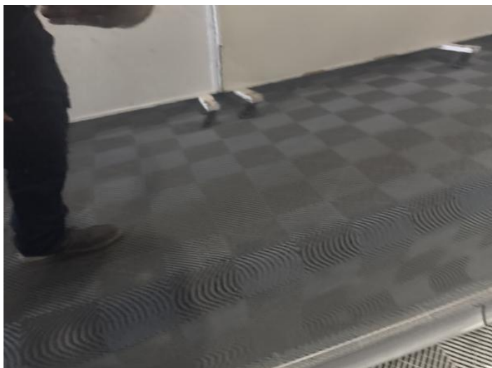
3: Door nsf Chipped 1 To 5