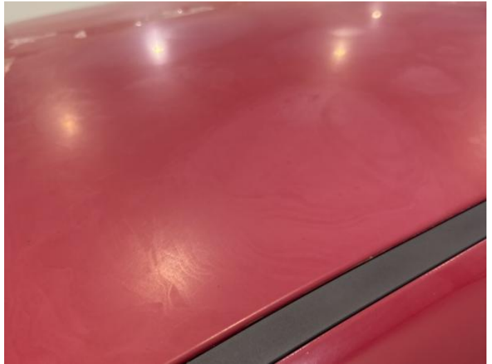
10: Roof Poor Previous Repair Paint Flake