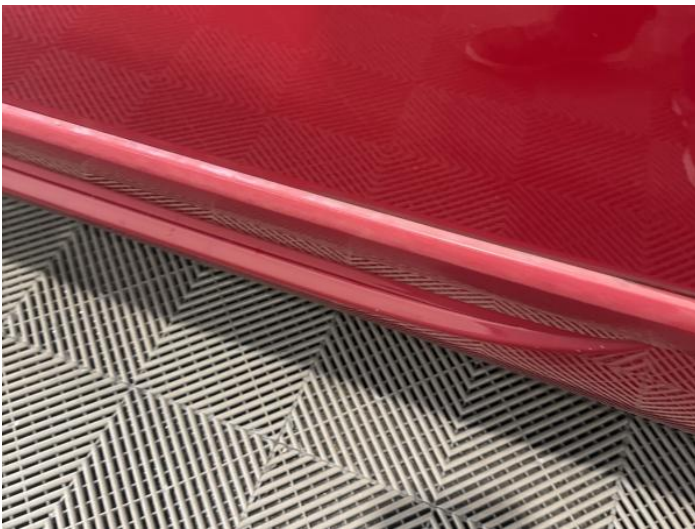
5: Door Moulding nsf Scratched (Painted) Over 25mm Thru Paint