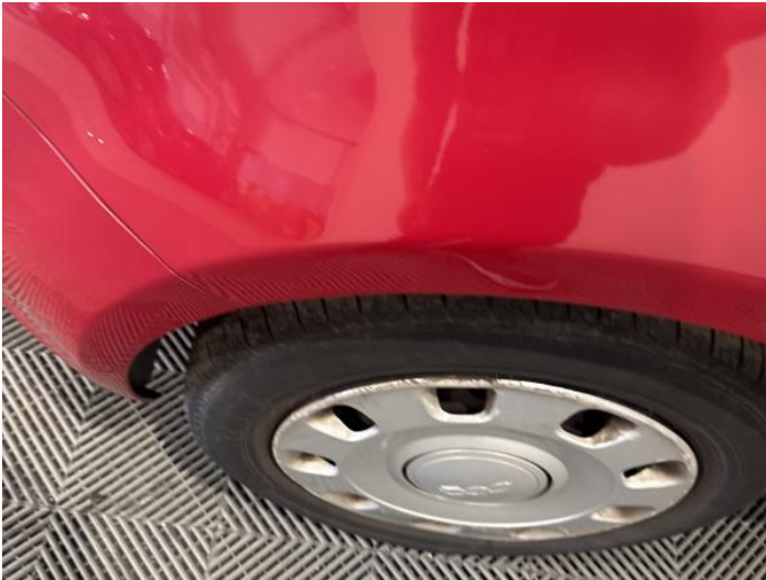
3: Wing nsf Chipped 1 To 5