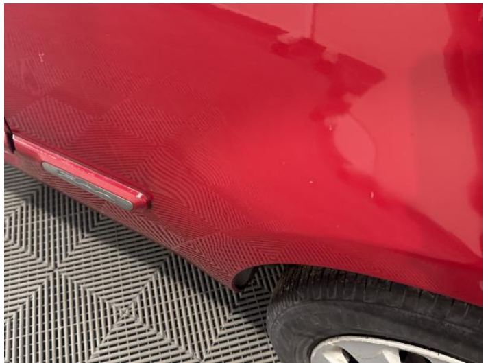
6: Qtr Panel nsr Chipped 1 To 5