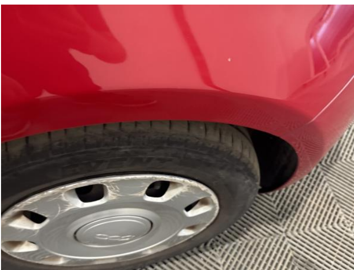
13: Wing osf Chipped 1 To 5