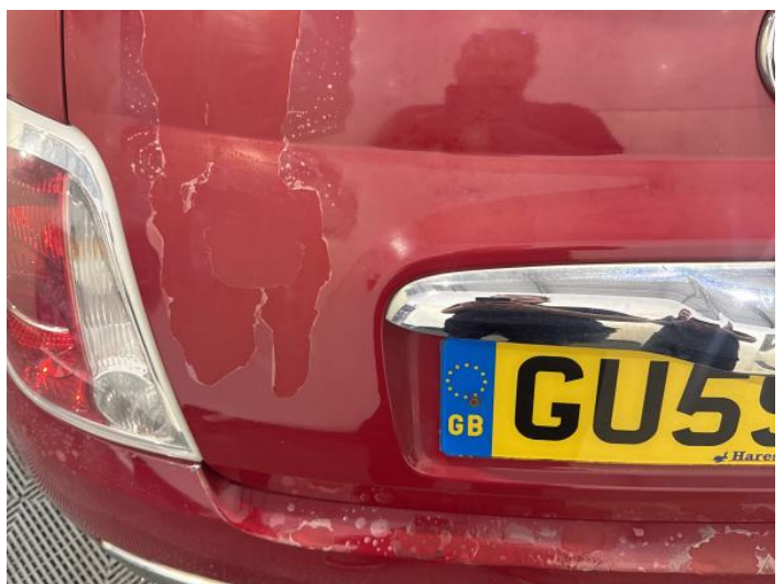
8: Boot Lid Poor Previous Repair Paint Flake