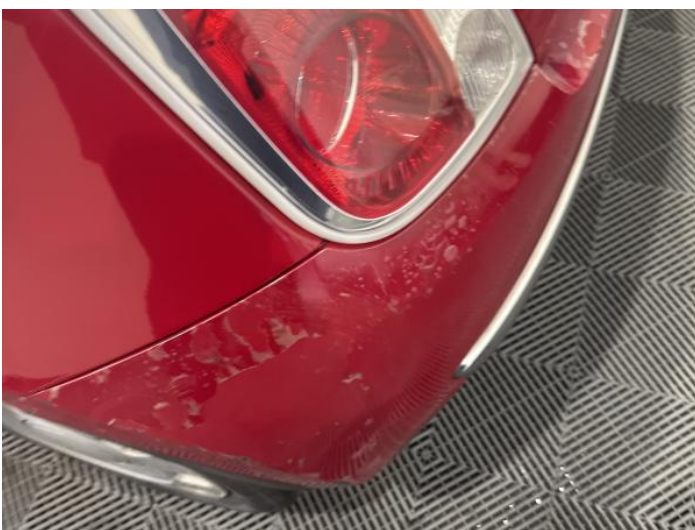
7: Bumper Rear Poor Previous Repair Paint Flake