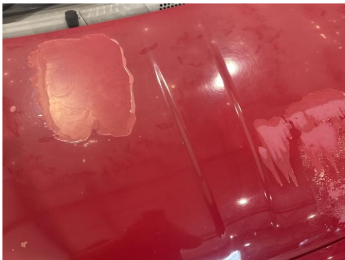
1: Bonnet Poor Previous Repair Paint Flake