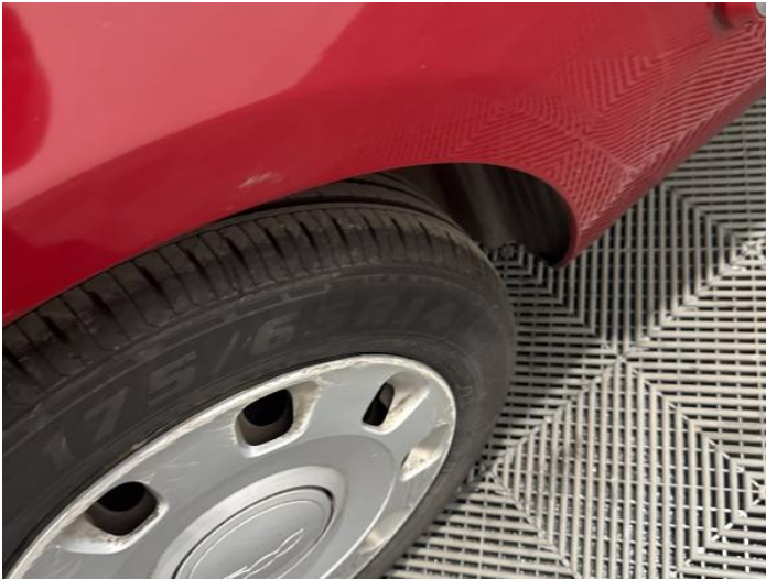
9: Qtr Panel osr Chipped 1 To 5