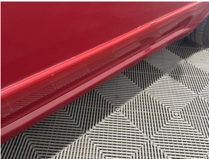
11: Door Moulding osf Scratched (Painted) UpTo 25mm Thru Paint