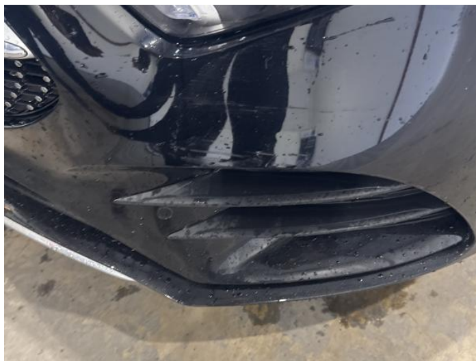
2: Bumper Front Scratched Over 100mm Thru Paint