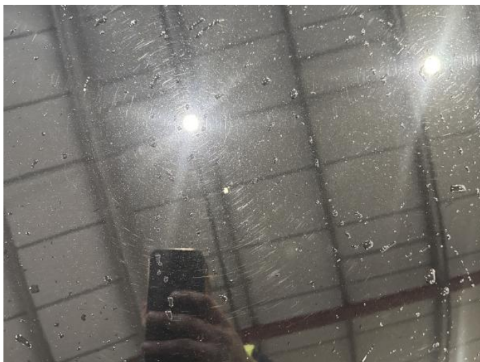
1: Bonnet Chipped 1 To 5