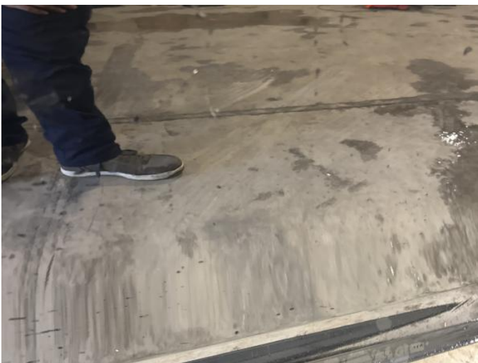
13: Door osf Chipped 1 To 5