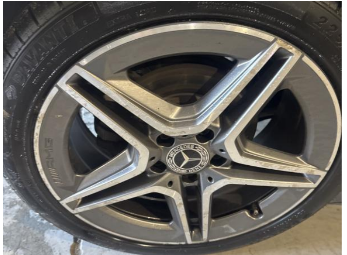
10: Wheel osr Scratched Over 50mm