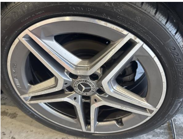
7: Wheel nsr Scratched Over 50mm