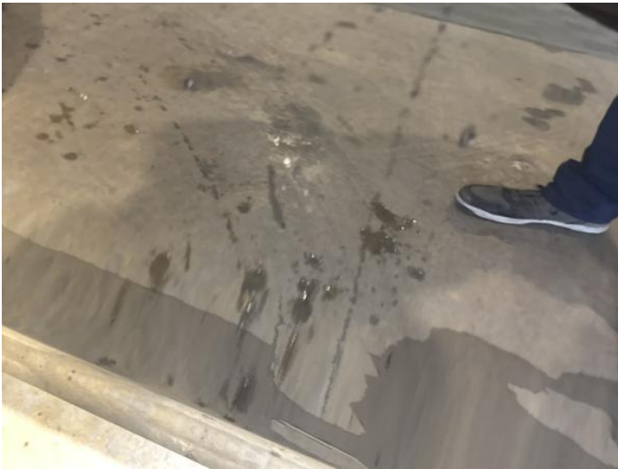
5: Door nsf Chipped 1 To 5