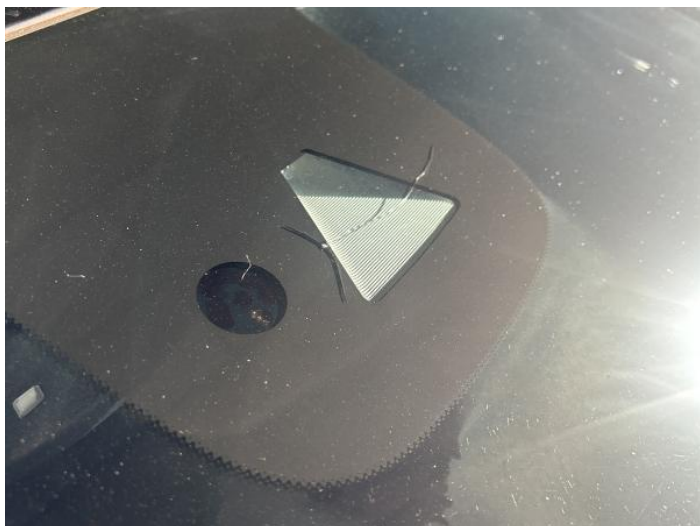
15: Screen Front Cracked Replace