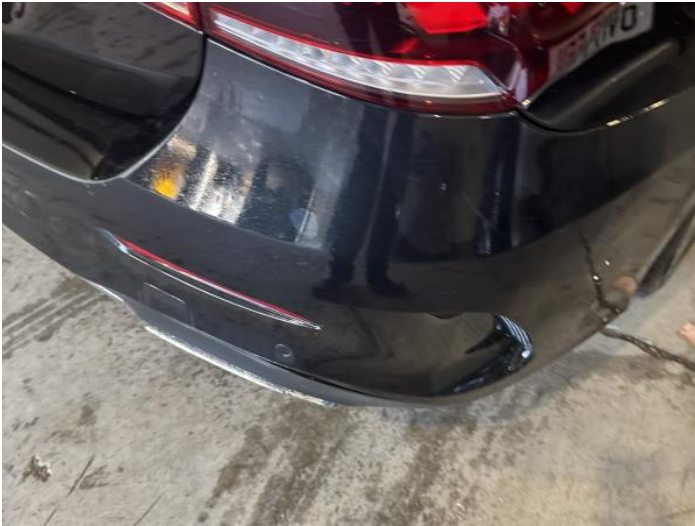
9: Bumper Rear Chipped Multiple Chips