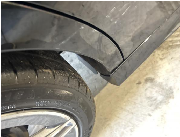
11: Qtr Panel osr Dented With Paint Damage