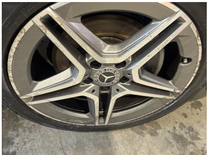
14: Wheel osf Scratched Over 50mm