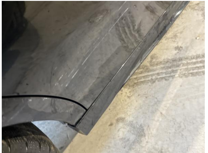
12: Door osr Dented With Paint Damage