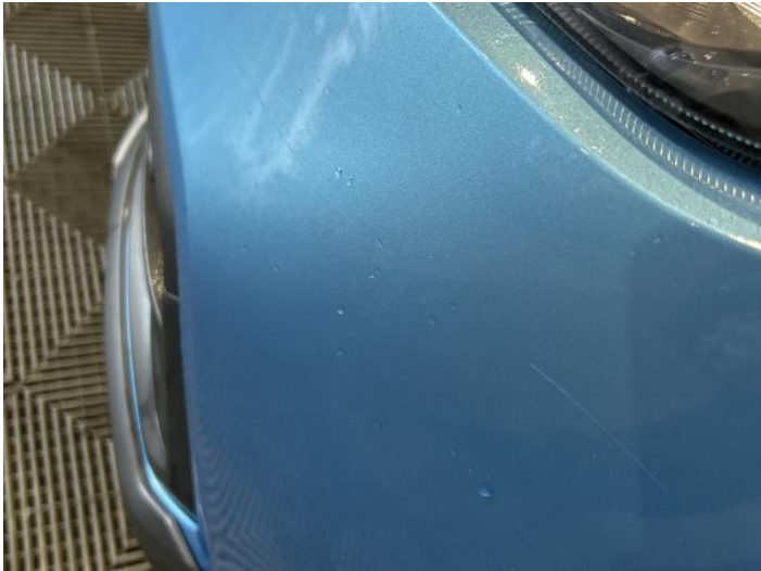
4: Bumper Front Scratched Over 25mm Not Thru Paint