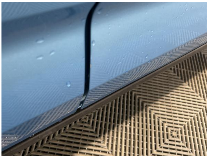
1: Door osf Chipped Edge Chip