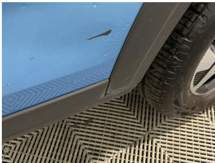
2: Bumper Rear Scratched Up To 25mm Thru Paint