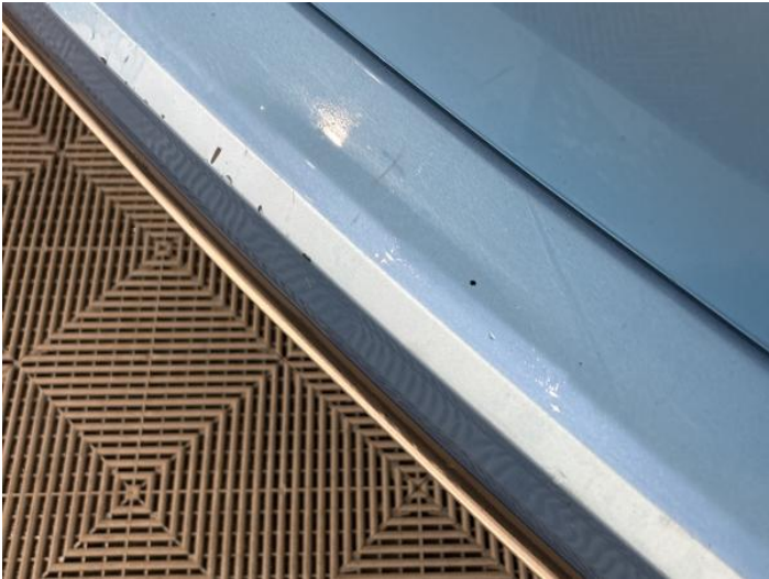
3: Bumper Rear Chipped Multiple Chips