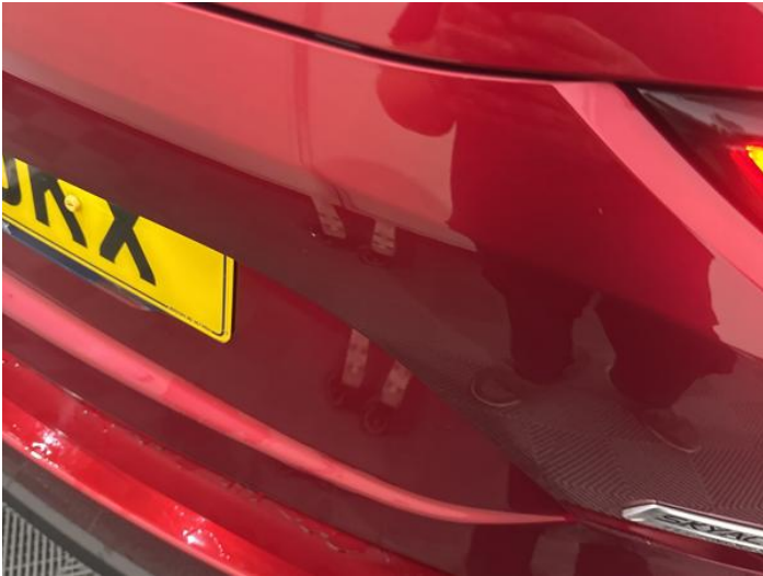
9: Boot Lid Chipped 1 To 5