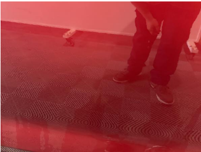
5: Door nsf Chipped 1 To 5