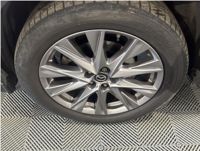
3: Wheel nsf Scratched Up To 50mm