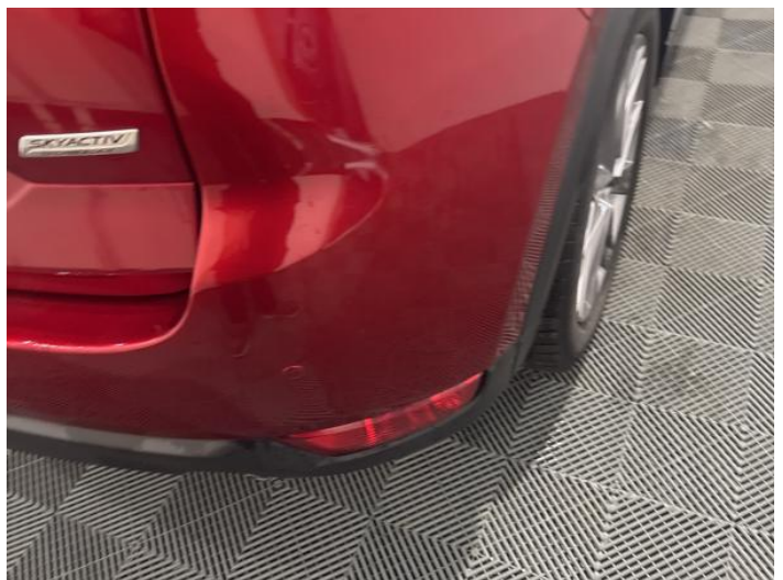
8: Bumper Rear Chipped Multiple Chips