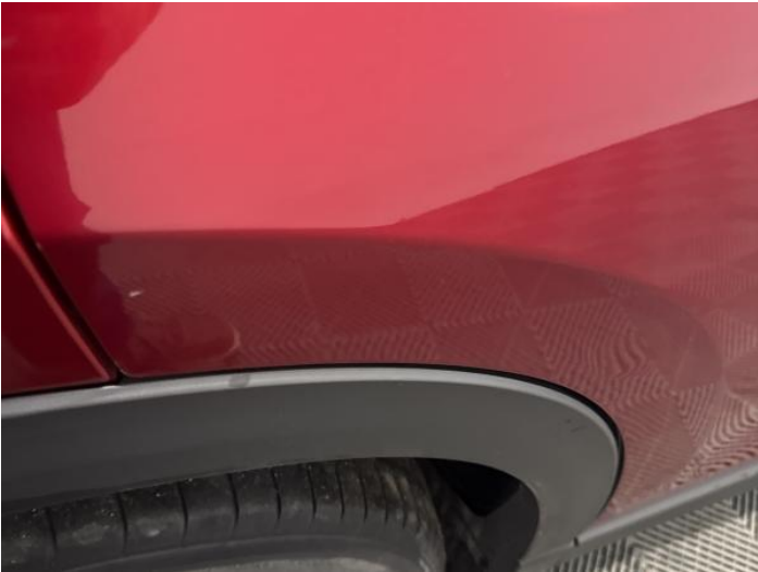
10: Door osr Chipped 1 To 5