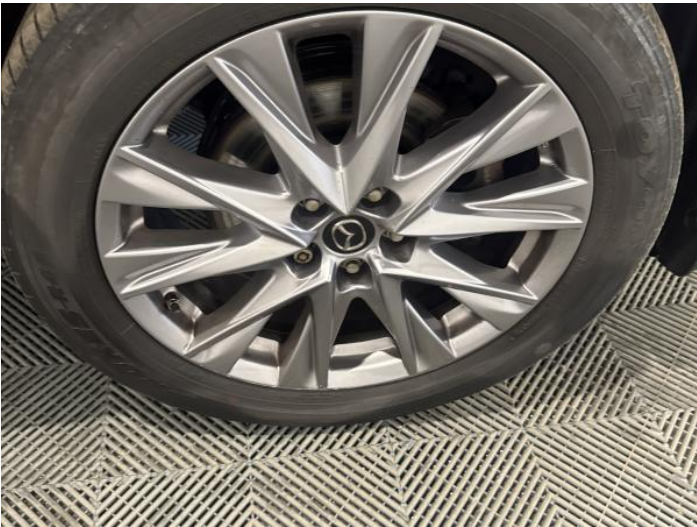
12: Wheel osf Scratched Over 50mm