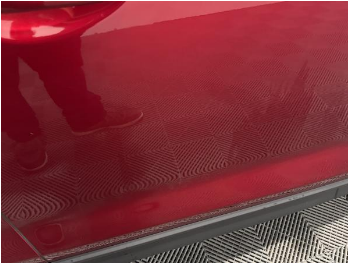
11: Door osf Chipped 1 To 5