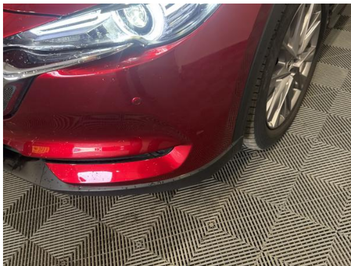
2: Bumper Front Scratched 25 to 100mm Thru Paint