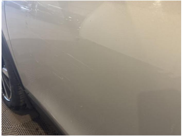
4: Door nsf Scratched Over 25mm Thru Paint