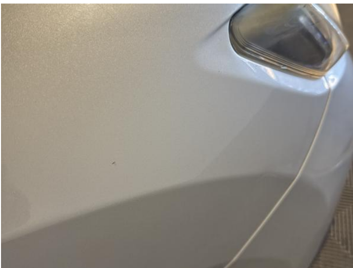
13: Wing osf Chipped 1 To 5