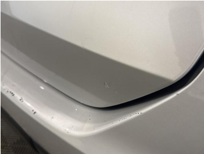
9: Tailgate Dented With Paint Damage