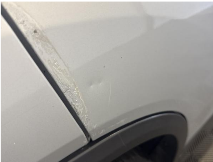
11: Door osf Dented With Paint Damage