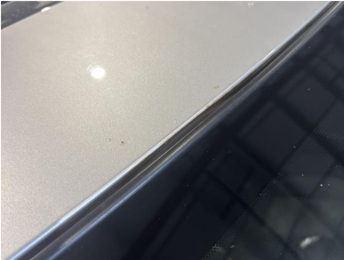
15: Roof Rusted Over 5mm