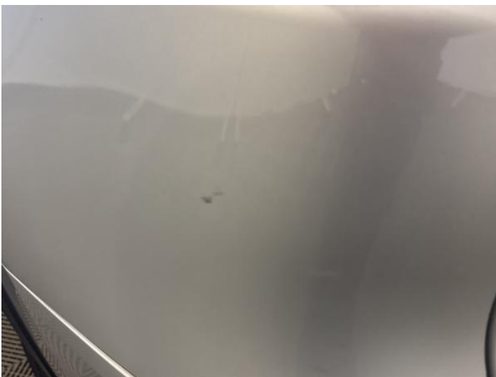
7: Bumper Rear Scratched Up To 25mm Thru Paint