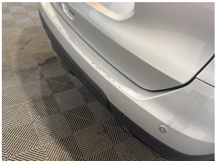
8: Bumper Rear Scratched Over 100mm Thru Paint