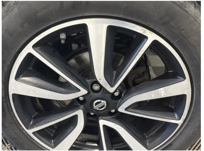
6: Wheel nsr Scratched Over 50mm