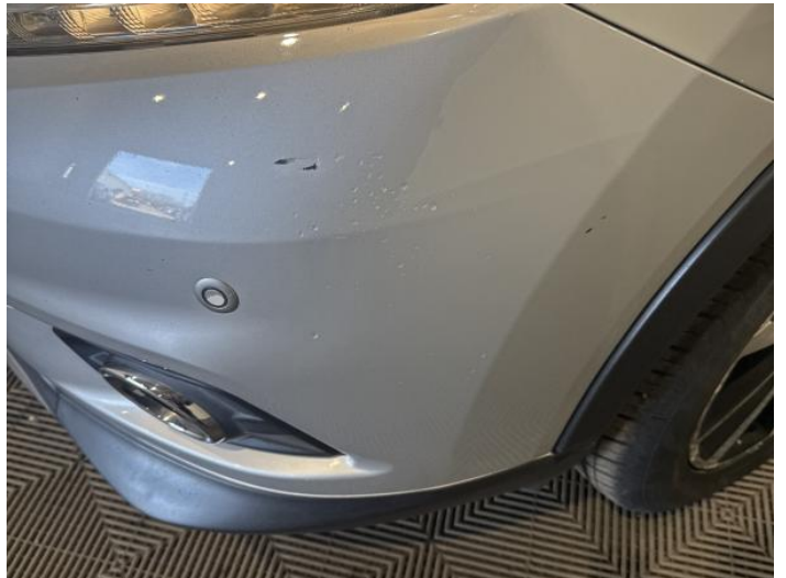
2: Bumper Front Poor Previous Repair Poor Colour