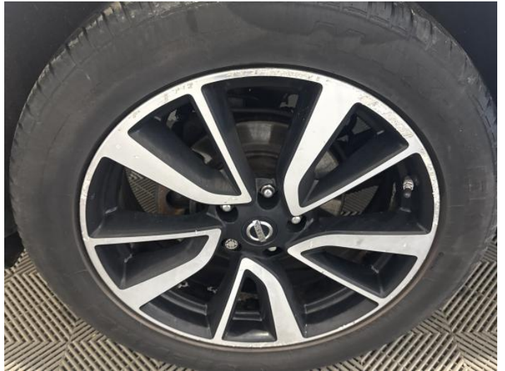
10: Wheel osf Scratched Over 50mm