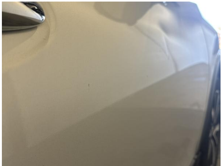
12: Door osf Dented Over 30mm