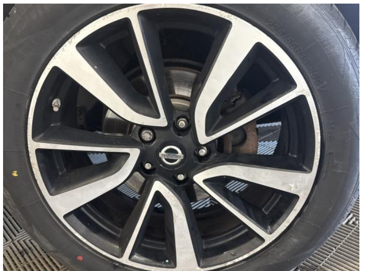
14: Wheel osf Scratched Over 50mm