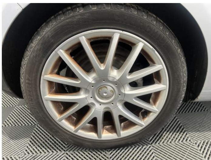
6: Wheel osr Scratched Up To 50mm