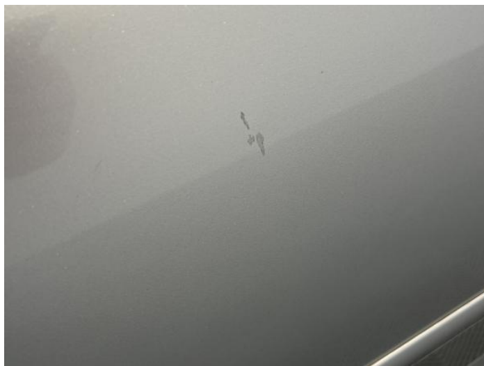
4: Door osr Chipped 1 To 5