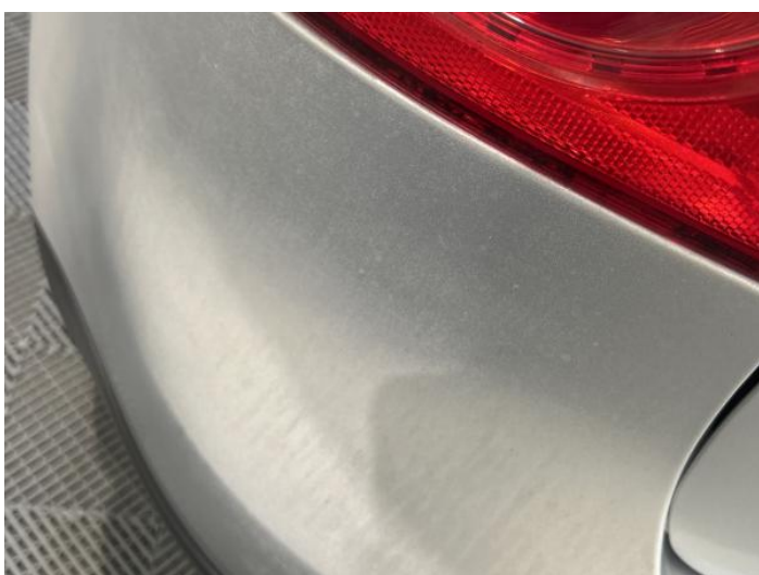
7: Bumper Rear Poor Previous Repair Poor Paint