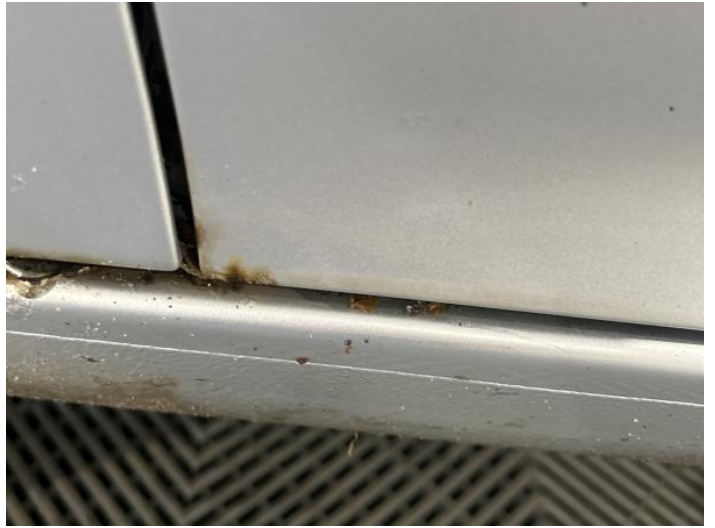
10: Door nsf Rusted UpTo 5mm