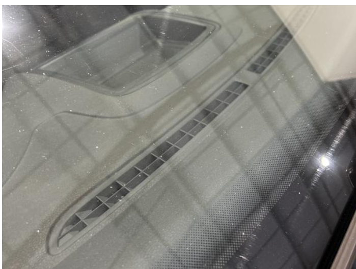
17: Screen Front Chipped UpTo 10mm