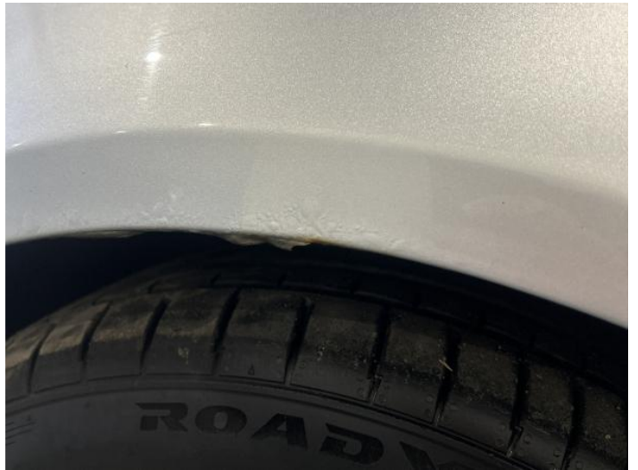
12: Wing nsf Rusted Over 5mm