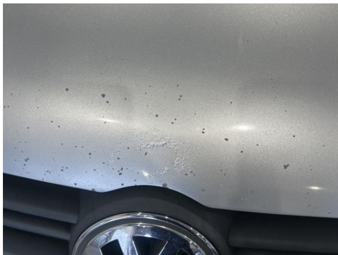
16: Bonnet Poor Previous Repair Poor Paint