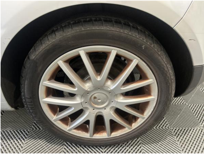
9: Wheel nsr Scratched Over 50mm