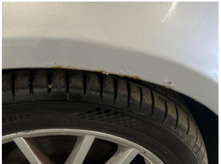
2: Wing osf Rusted Over 5mm