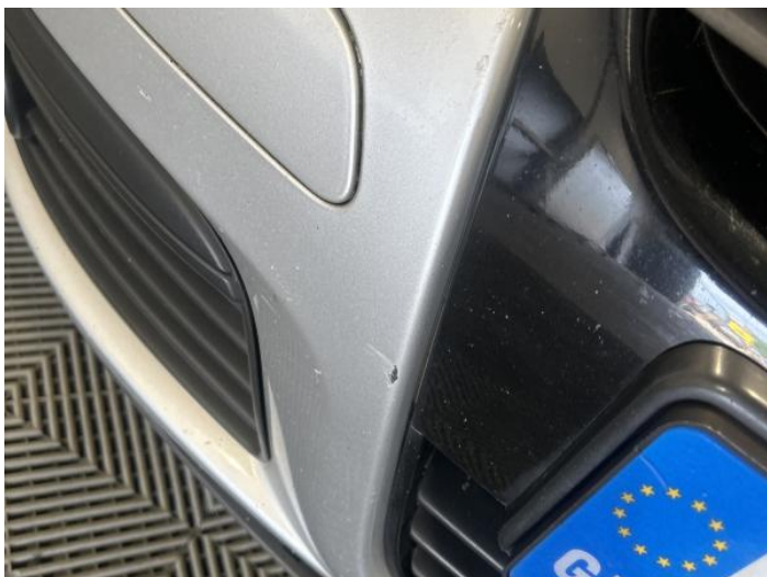
15: Bumper Front Chipped Multiple Chips