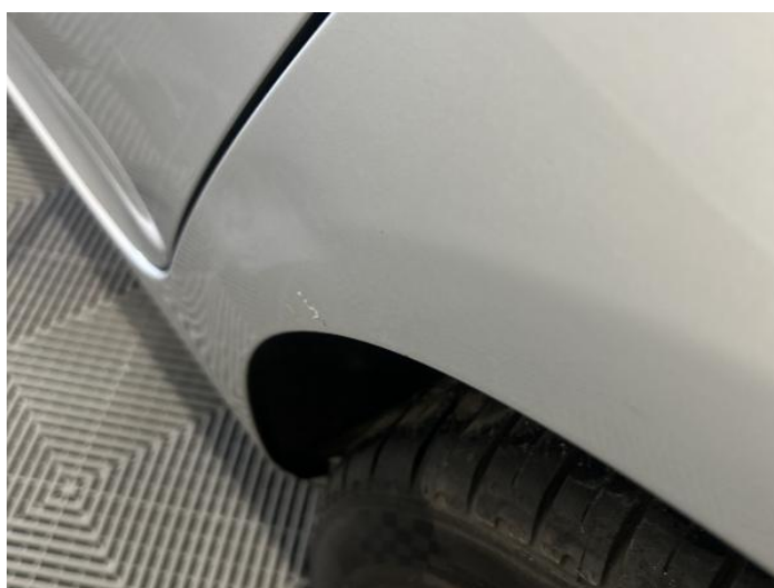
8: Qtr Panel nsr Dented Over 30mm