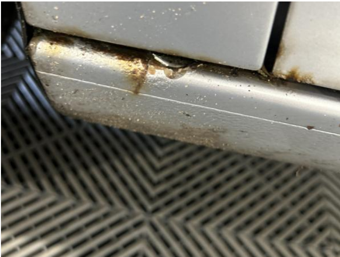
11: Sill ns Rusted UpTo 5mm