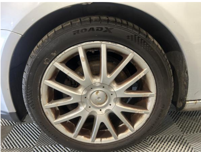
13: Wheel nsf Scratched Over 50mm