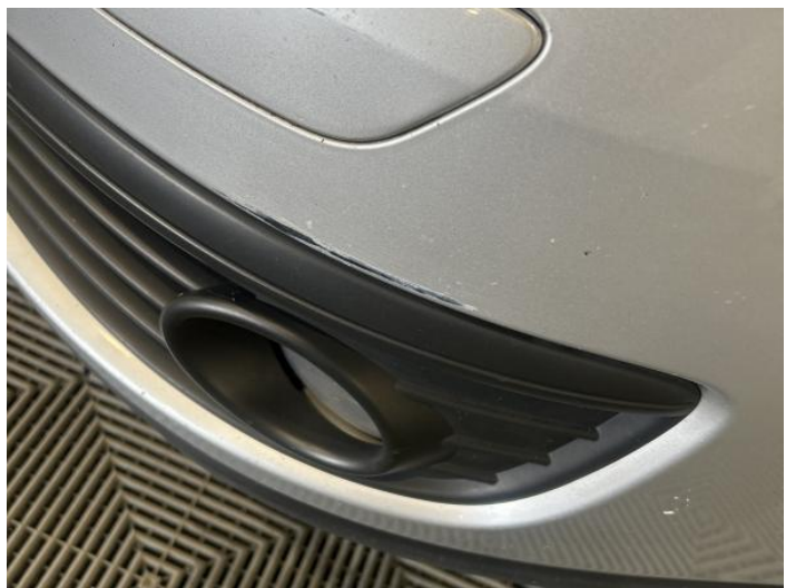
14: Bumper Front Scratched 25 to 100mm Thru Paint