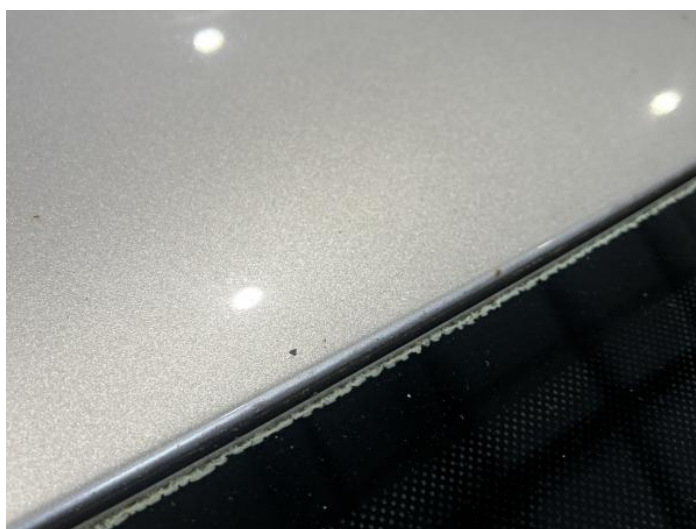
18: Roof Chipped 1 To 5