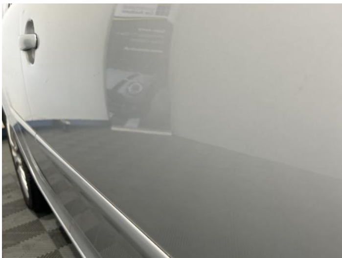
3: Door osf Dented 2 Or Less UpTo 10mm