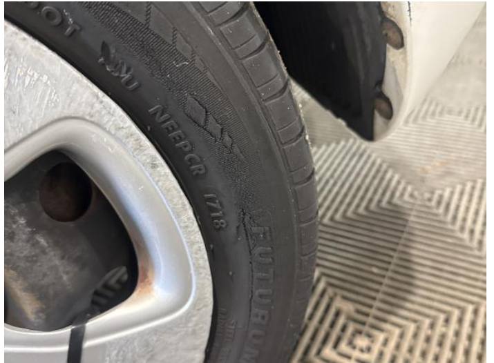
4: Tyre nsr Damaged Replace