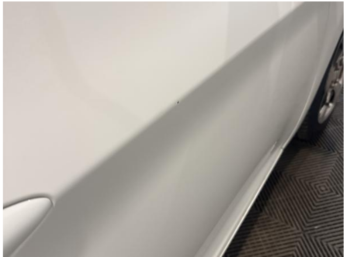
18: Door osf Dented Between 10mm + 30mm