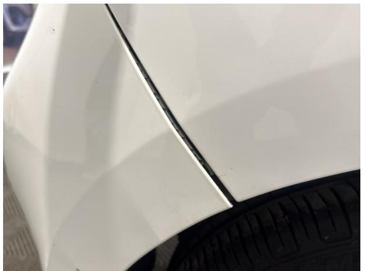
14: Bumper Rear Insecure Action Required