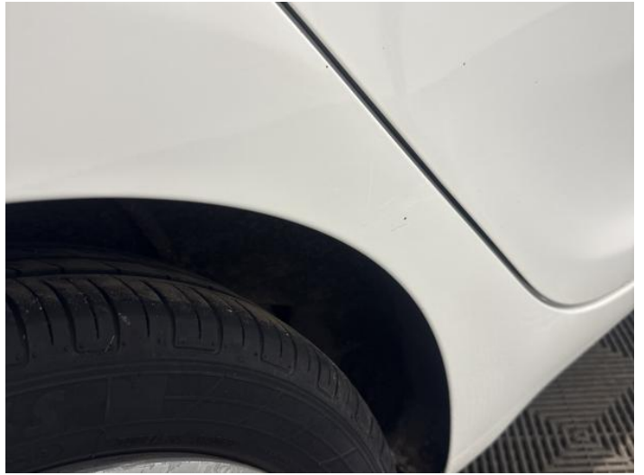
16: Qtr Panel osr Scratched Over 25mm Thru Paint