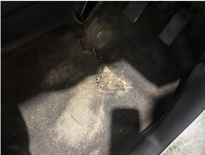
1: Carpets Front Holed Over 3mm