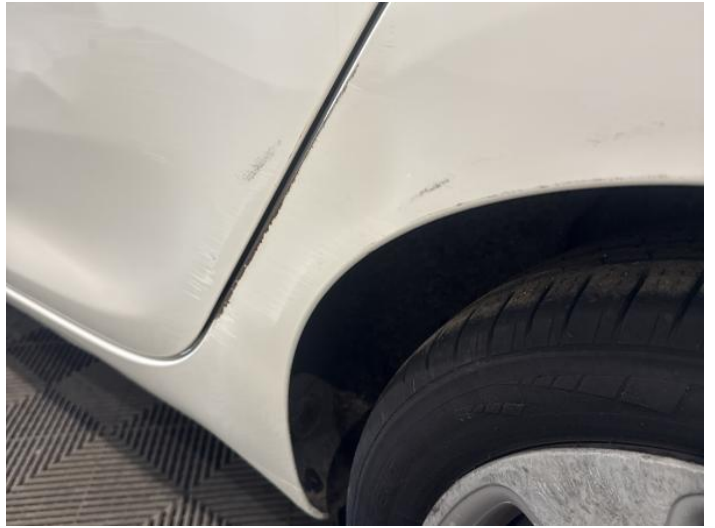
10: Qtr Panel nsr Dented With Paint Damage