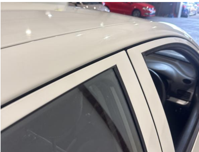
13: B Post os Dented Between 10mm + 30mm