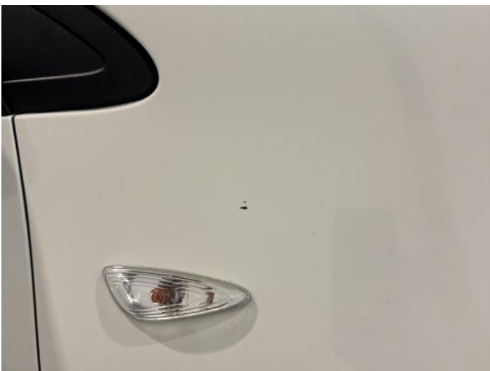
19: Wing osf Chipped 1 To 5