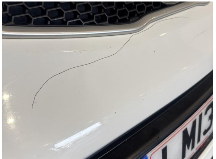
6: Bumper Front Dented With Paint Damage