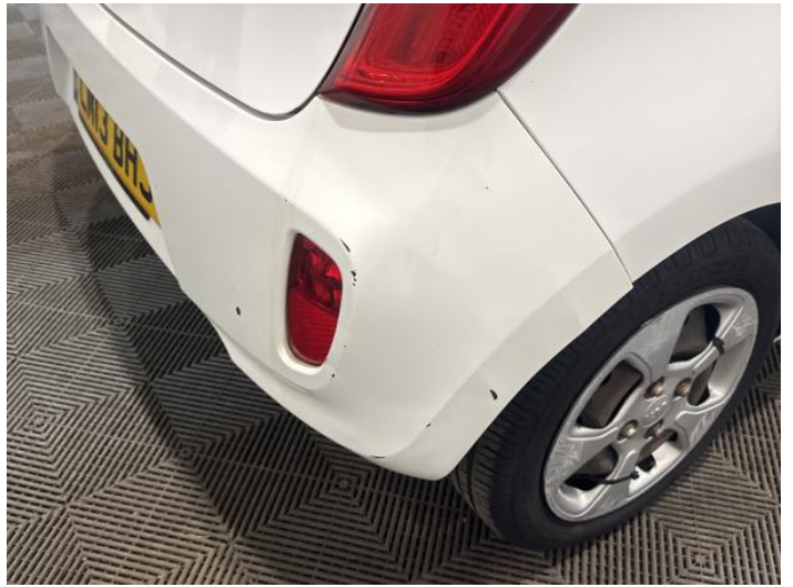
12: Bumper Rear Scratched Over 100mm Thru Paint