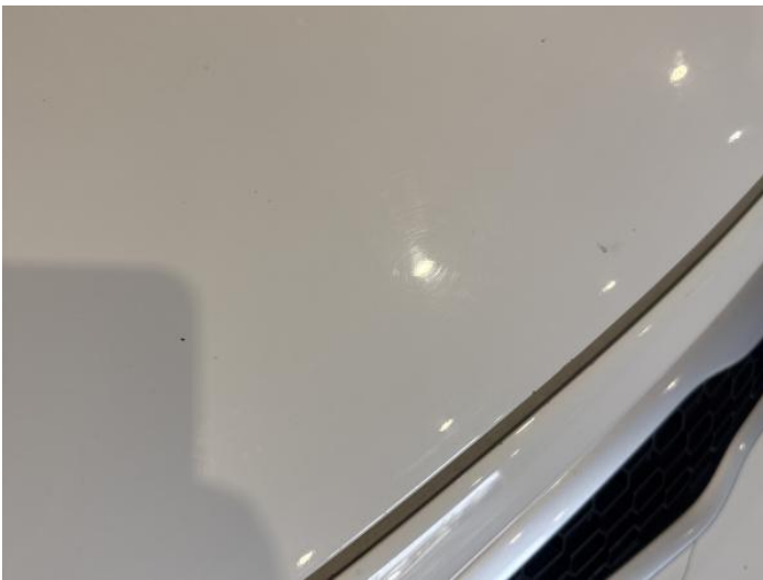
5: Bonnet Chipped 1 To 5