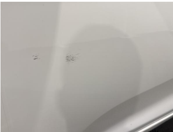
7: Door nsf Scratched Over 25mm Thru Paint