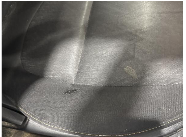
2: Seat Base Cover osf Scuffed Over 25mm