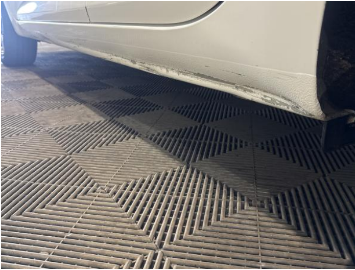
9: Sill ns Dented With Paint Damage