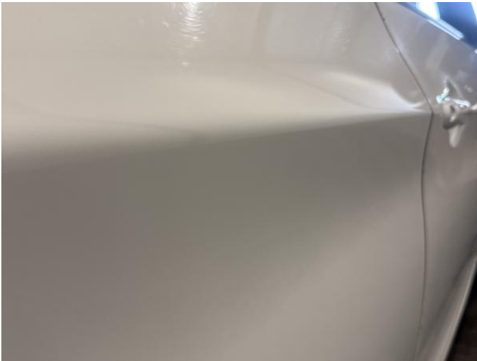
17: Door osr Dented Between 10mm + 30mm