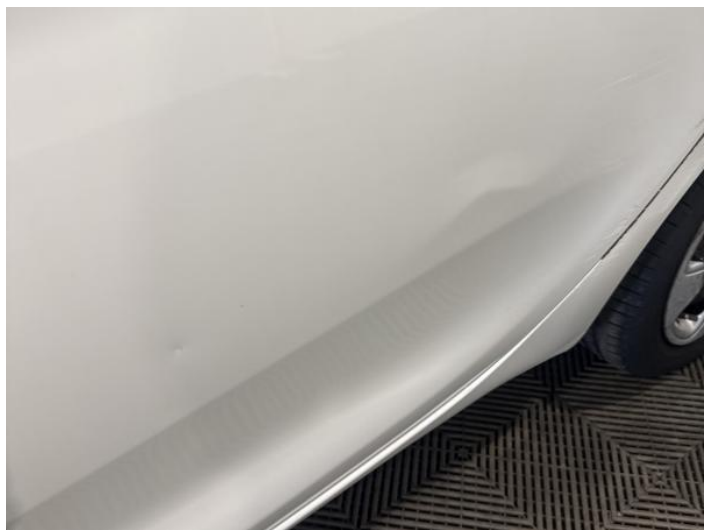
8: Door nsr Dented With Paint Damage