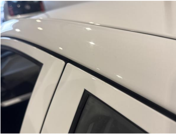
11: B Post ns Dented Between 10mm + 30mm