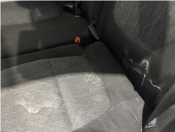
3: Seat Base Cover nsr Soiled Light