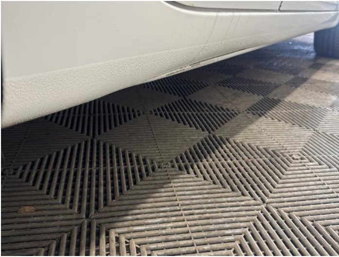
15: Sill os Dented With Paint Damage