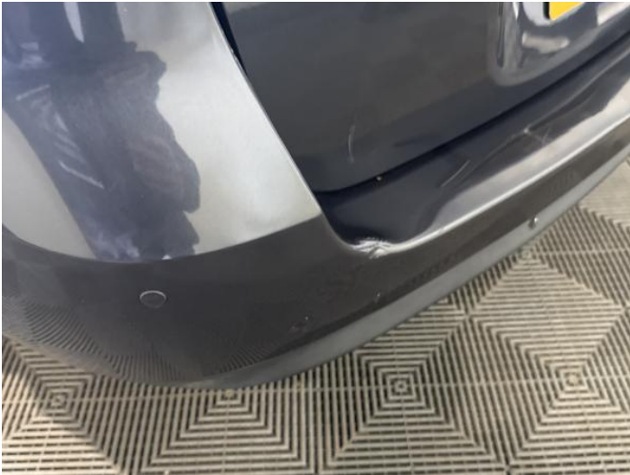
15: Bumper Rear Dented With Paint Damage