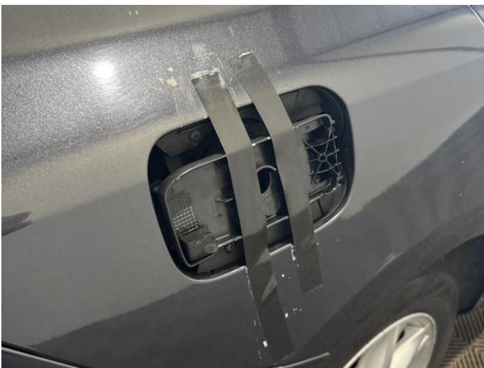
19: Fuel Flap Missing Replace