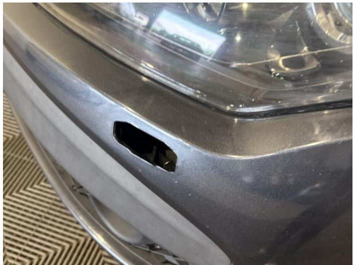
6: Bumper Front Moulding Missing Replace