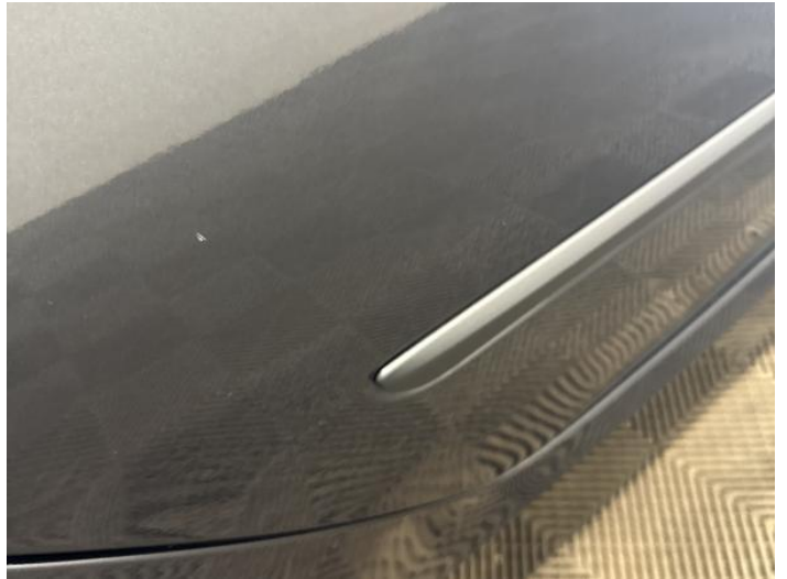
22: Door osf Chipped 1 To 5