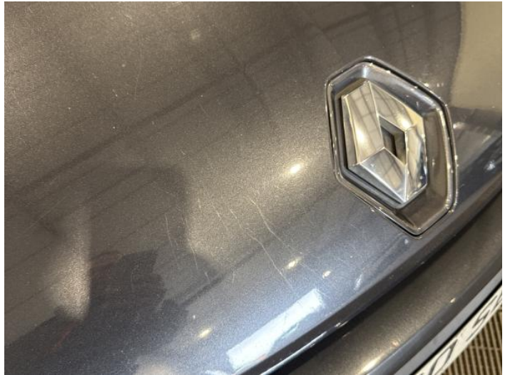
4: Bonnet Scratched Over 25mm Thru Paint