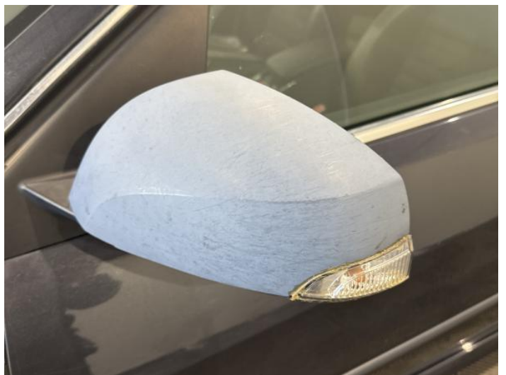
8: Door Mirror Assy nsf Scratched (Painted) Over 25mm Thru Paint