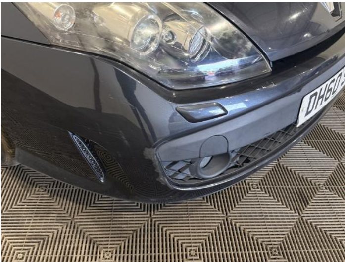
5: Bumper Front Scratched Over 100mm Thru Paint