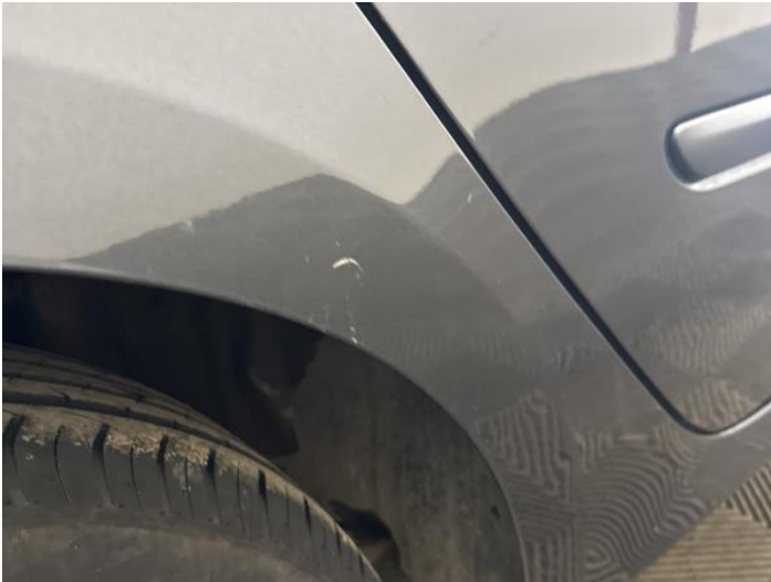
21: Qtr Panel osf Scratched Over 25mm Thru Paint