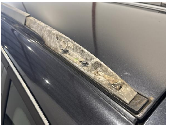
14: Other N/A N/A