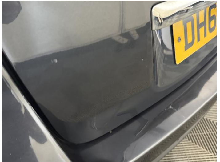
16: Tailgate Scratched Over 25mm Thru Paint