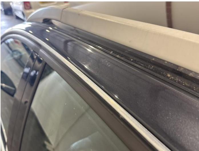
17: B Post ns Dented Between 10mm + 30mm