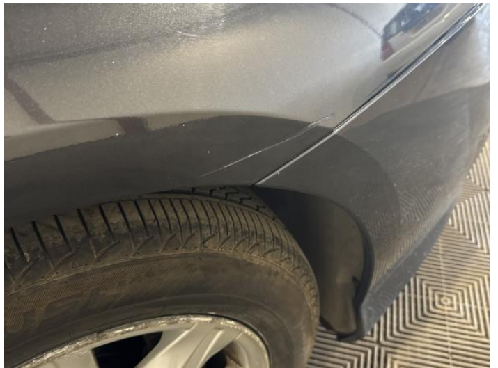
24: Wing osf Scratched Over 25mm Thru Paint