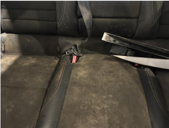
1: Seat Base Cover osr Soiled Light