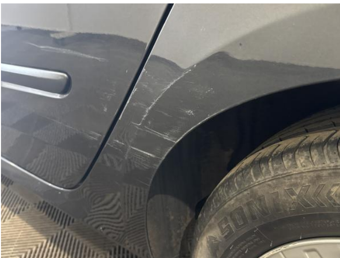
13: Qtr Panel nsr Dented With Paint Damage