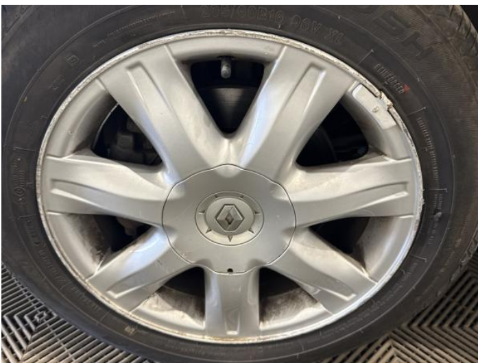
7: Wheel nsf Scratched Over 50mm