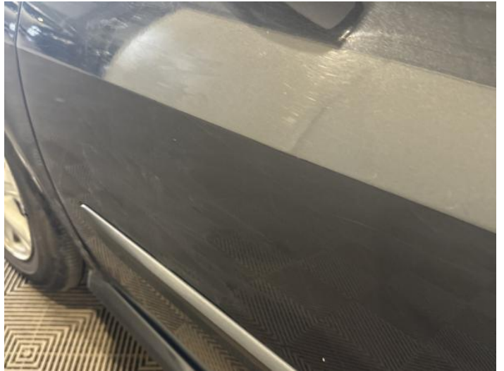
10: Door nsf Scratched Over 25mm Thru Paint