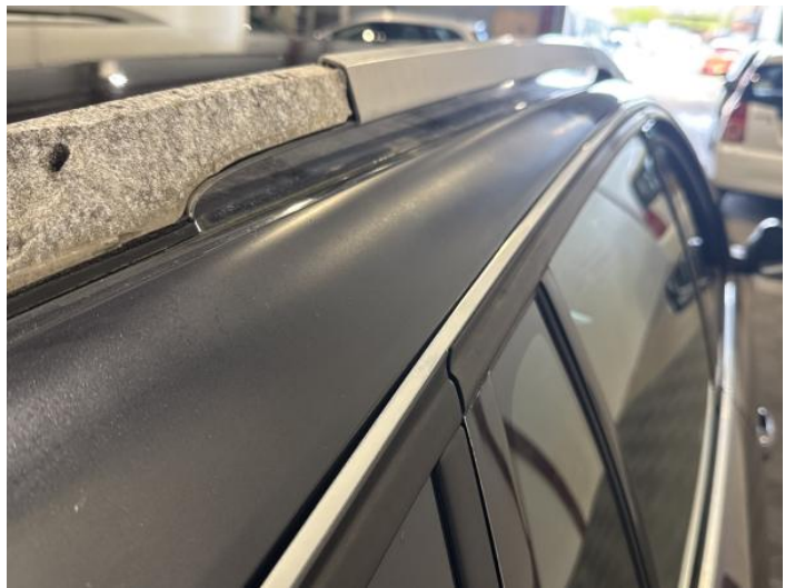
18: B Post os Dented With Paint Damage