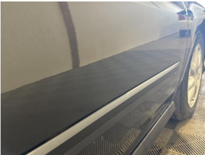
23: Door osf Dented Between 10mm + 30mm