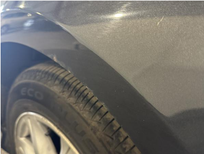
9: Wing nsf Rusted Over 5mm