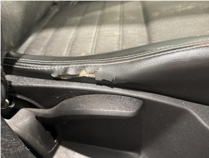
3: Seat Base Cover osf Scuffed Over 25mm