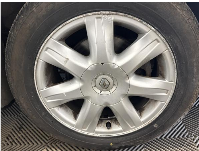
25: Wheel osf Scratched Over 50mm