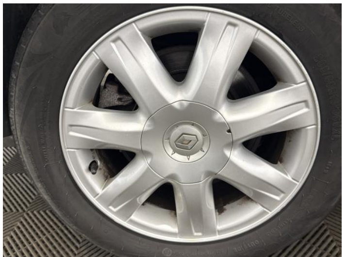
20: Wheel osr Scratched Over 50mm