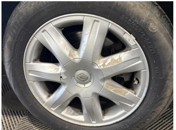
12: Wheel nsr Scratched Over 50mm