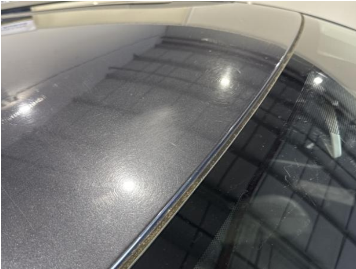
27: Roof Scratched Over 25mm Thru Paint