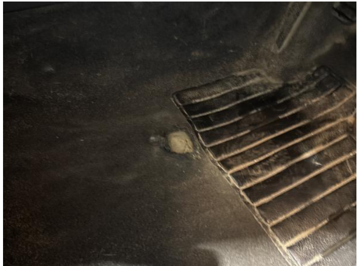
2: Carpets Front Holed Over 3mm