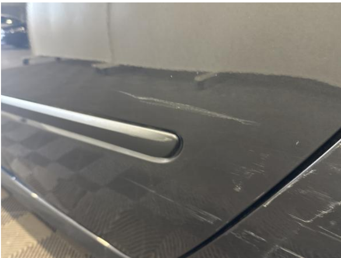
11: Door nsr Scratched Over 25mm Thru Paint