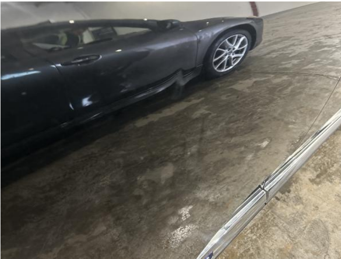
5: Door osr Dented Between 10mm + 30mm