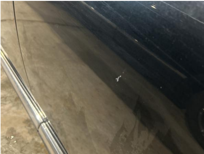
11: Door nsr Chipped 1 To 5