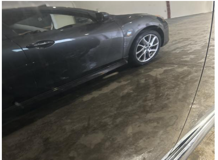
6: Door osr Scratched Over 25mm Not Thru Paint