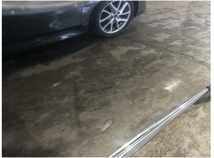
4: Door osf Scratched Over 25mm Not Thru Paint