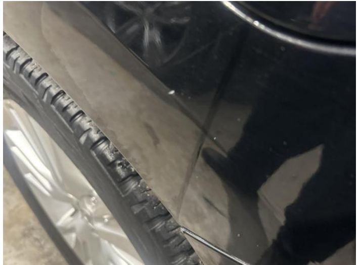
10: Qtr Panel nsr Chipped 1 To 5