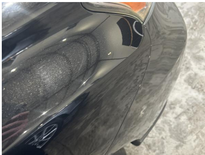
2: Wing osf Chipped 1 To 5