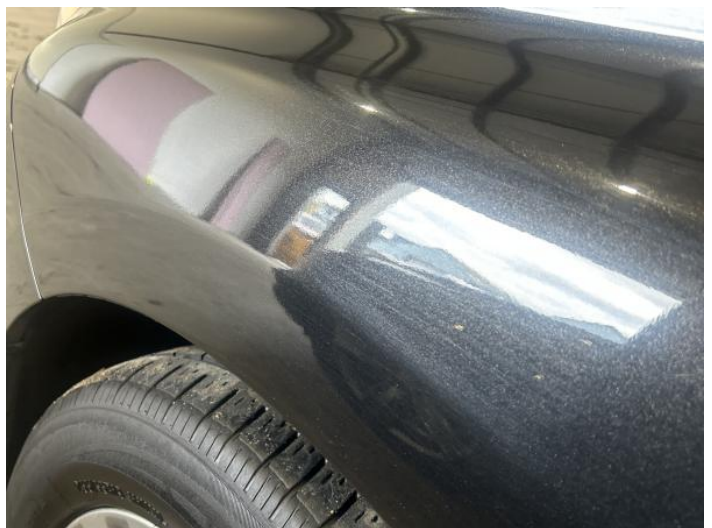
14: Wing nsf Poor Previous Repair Poor Paint