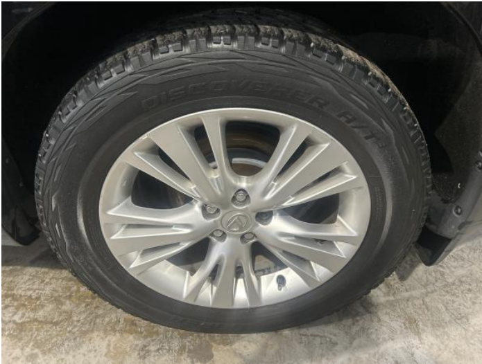
9: Wheel nsr Scratched Up To 50mm