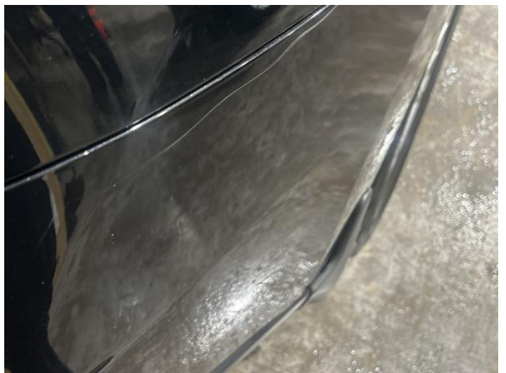
8: Bumper Rear Scratched Over 25mm Not Thru Paint