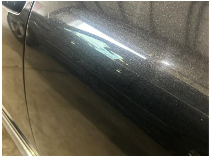
12: Door nsr Scratched Over 25mm Not Thru Paint