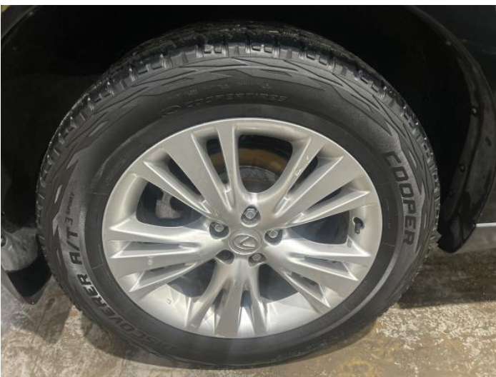
7: Wheel osr Scratched Over 50mm