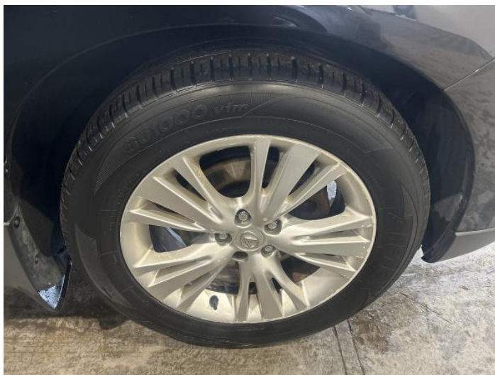
1: Wheel osf Scratched Over 50mm