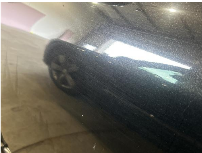
13: Door nsf Poor Previous Repair Poor Paint