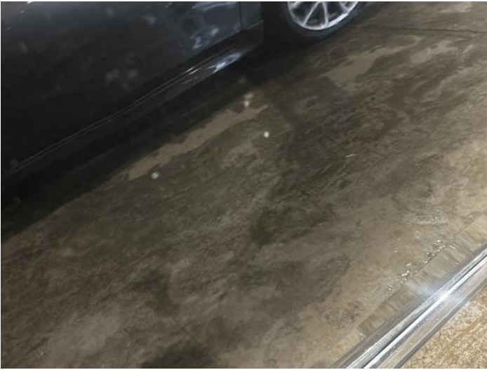
3: Door osf Chipped 1 To 5