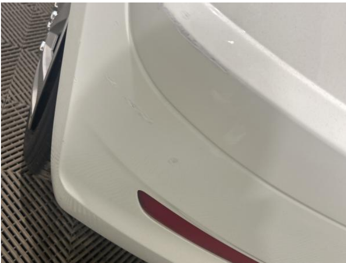
5: Bumper Rear Scratched Over 100mm Thru Paint