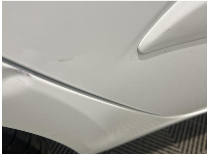
16: Door osr Scratched UpTo 25mm Thru Paint