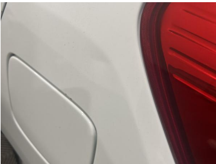
7: Qtr Panel nsr Dented 2 Or Less UpTo 10mm