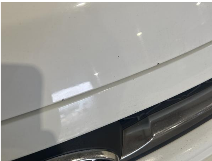
13: Bonnet Chipped 1 To 5