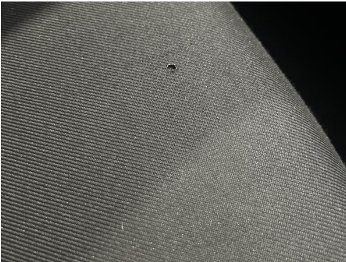
1: Seat Base Cover nsf Holed UpTo 3mm