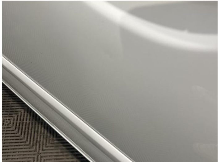
10: Door nsf Dented 2 Or Less UpTo 10mm