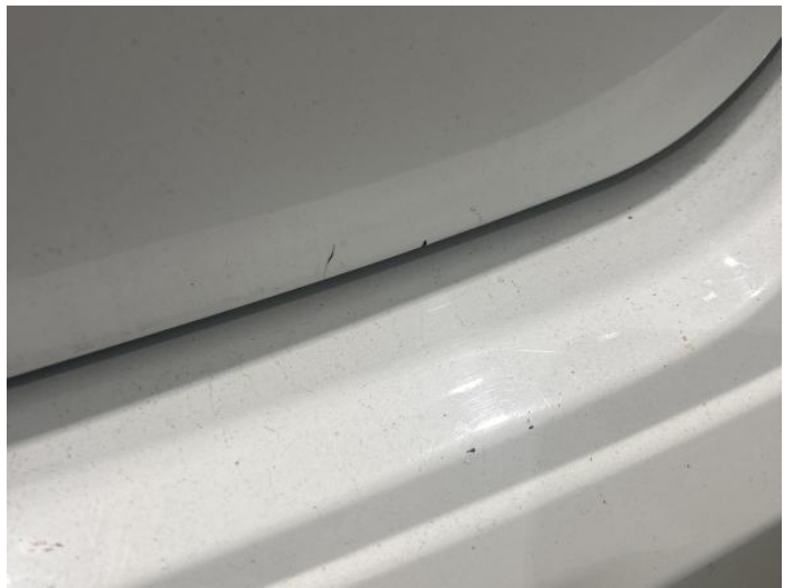
6: Tailgate Chipped 1 To 5