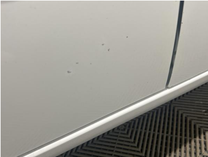
15: Door osr Chipped 1 To 5