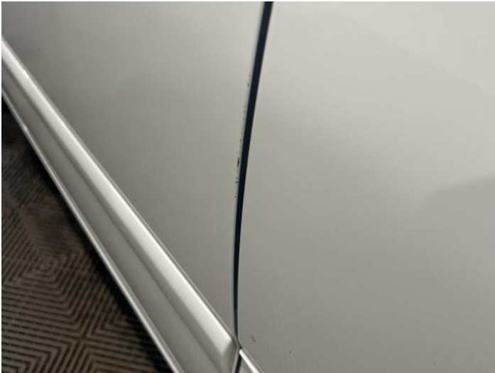
9: Door nsf Chipped Edge Chip