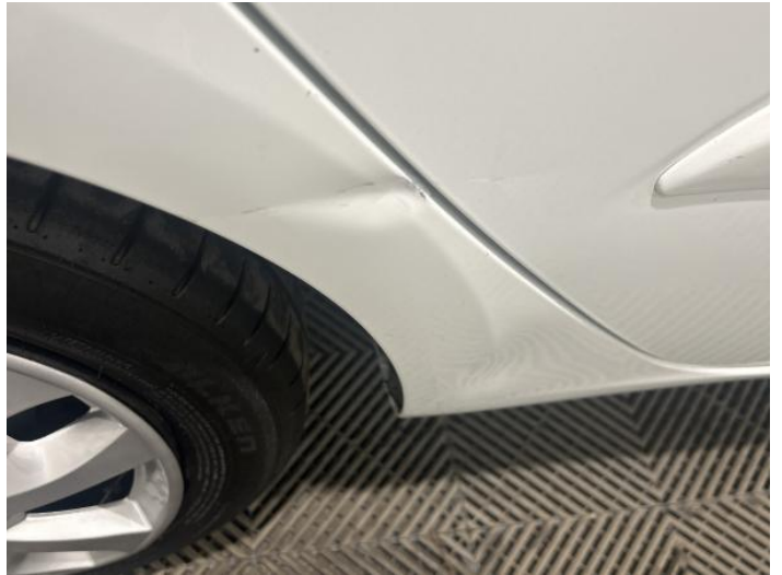
4: Qtr Panel osr Dented Over 30mm