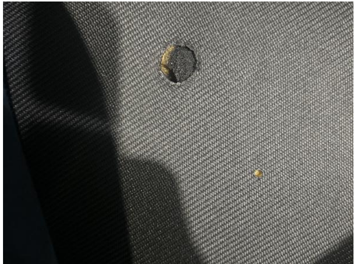
2: Seat Base Cover osf Holed Over 3mm