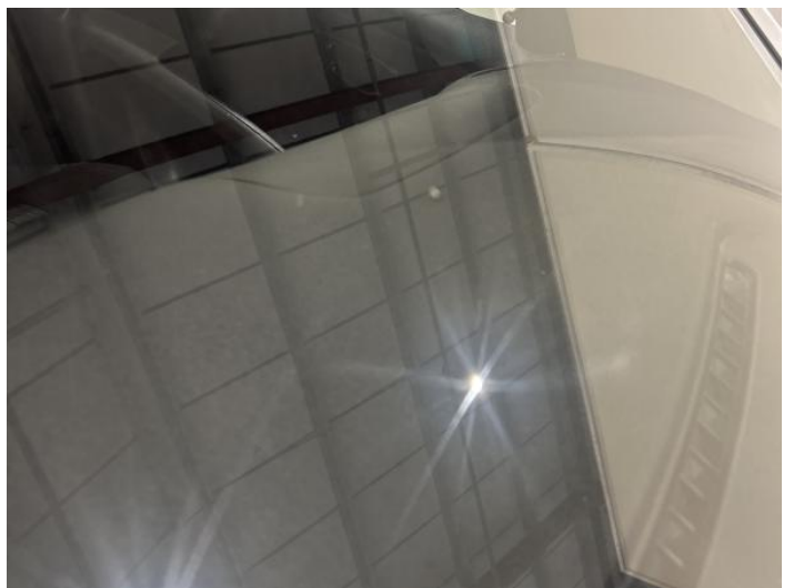
14: Screen Front Chipped UpTo 10mm