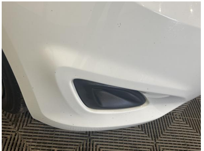
12: Bumper Front Chipped Multiple Chips