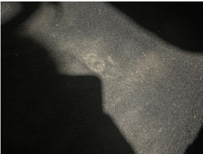
17: Carpets Front Holed Over 3mm