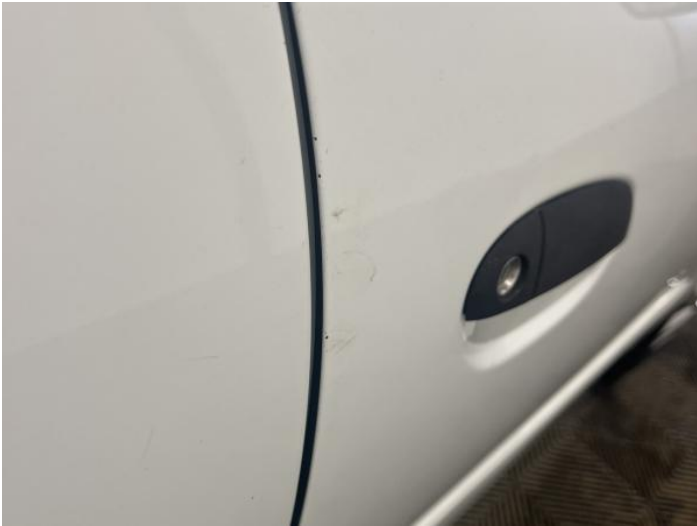
3: Door osf Chipped Edge Chip