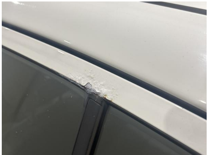
18: Door nsr Poor Previous Repair Paint Flake