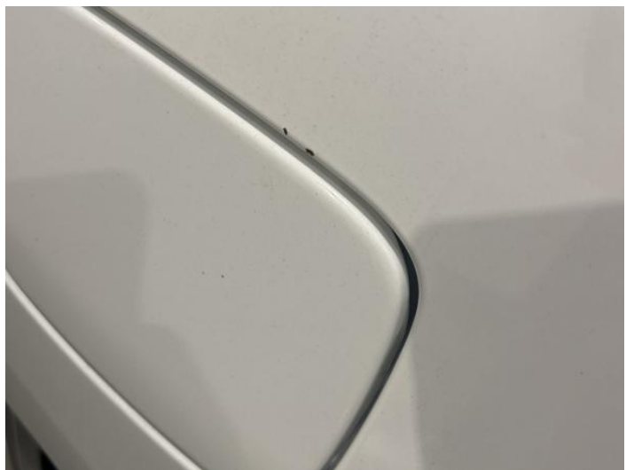
8: Qtr Panel nsr Chipped 1 To 5