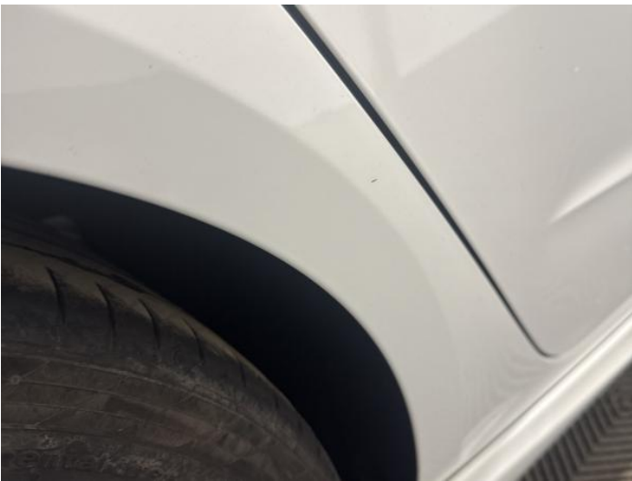
11: Qtr Panel osr Chipped 1 To 5