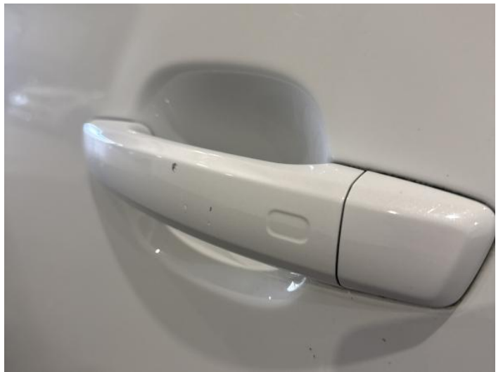
6: Handle Outer nsf Scratched (Painted) Up To 25mm Thru Paint