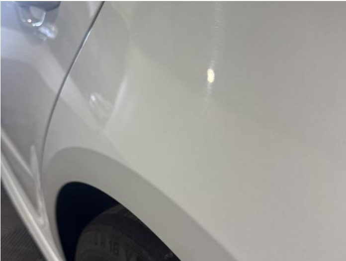
9: Qtr Panel nsr Dented Between 10mm + 30mm