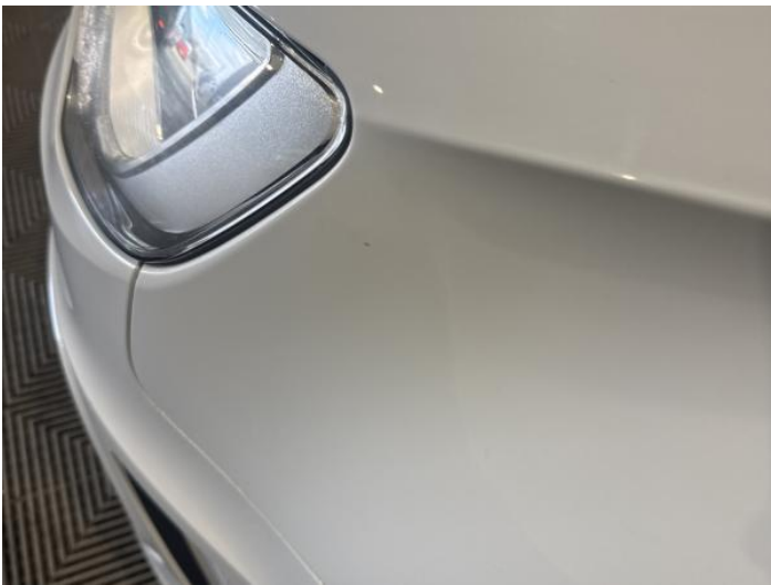
5: Wing nsf Chipped 1 To 5