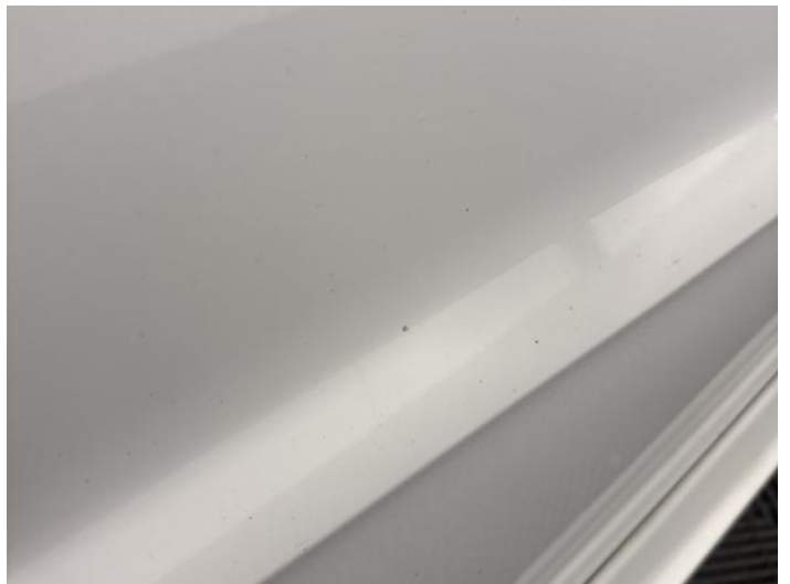
12: Door osf Chipped 1 To 5