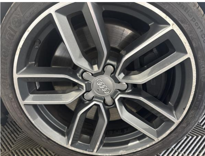
13: Wheel osf Scratched Over 50mm