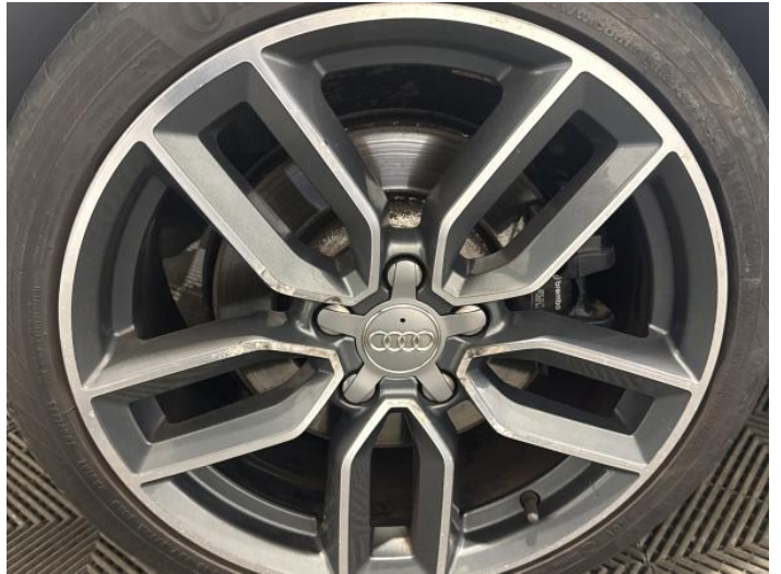
10: Wheel nsr Corroded Light