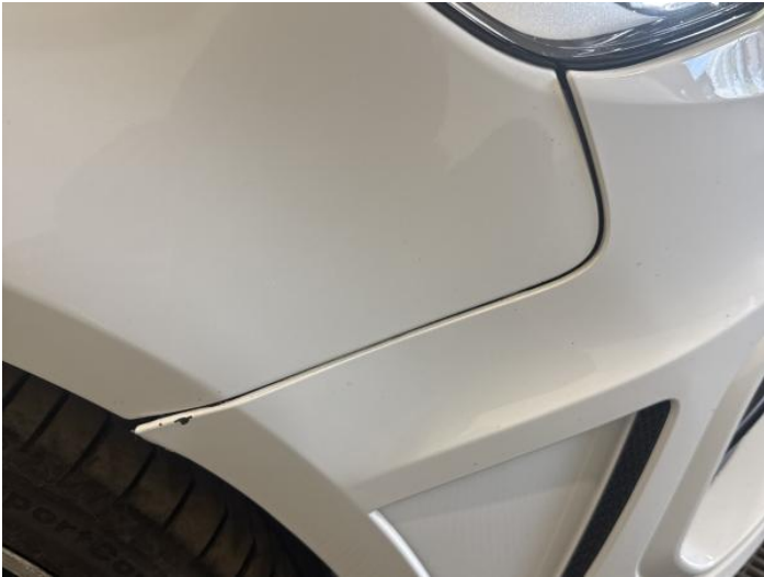
3: Bumper Front Insecure Action Required