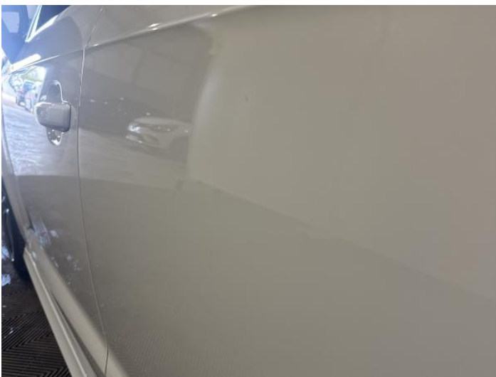
7: Door nsr Dented Between 10mm + 30mm