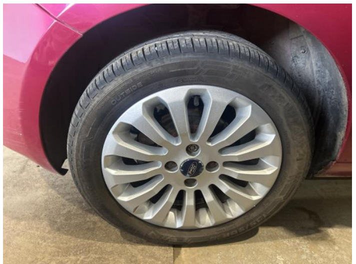
14: Wheel nsf Scratched Up To 50mm