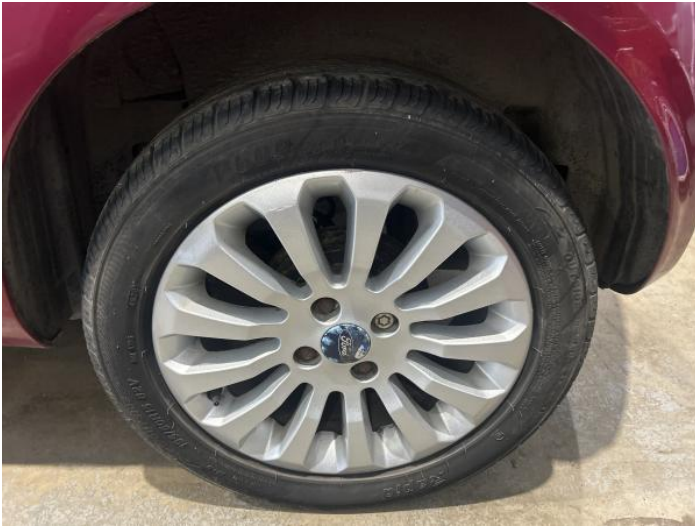
9: Wheel nsf Scratched Up To 50mm