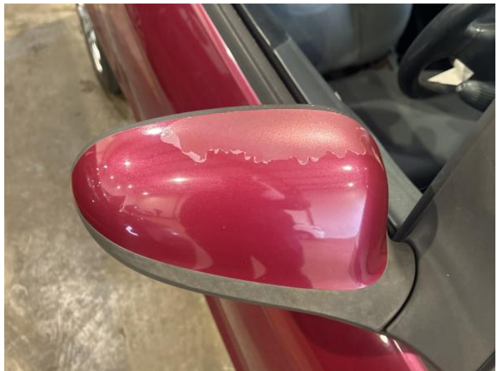
2: Door Mirror Assy osf Scratched (Painted) Over 25mm Thru Paint