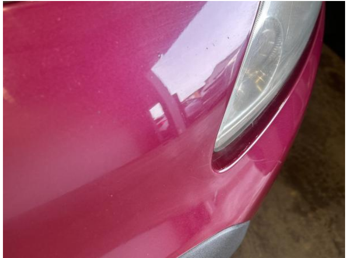
16: Bumper Front Chipped Multiple Chips