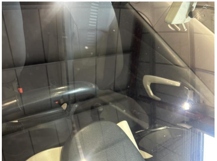
18: Screen Front Chipped Up To 10mm