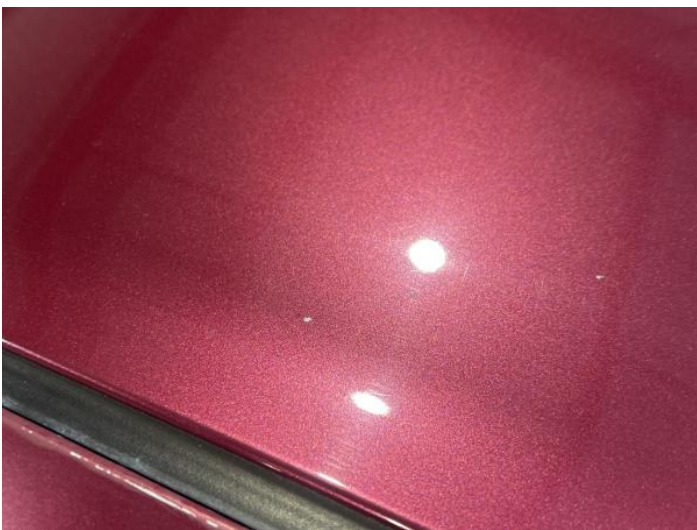
19: Roof Chipped 1 To 5