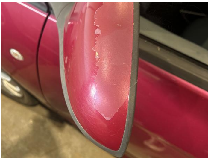
13: Door Mirror Assy nsf Scratched (Painted) Over 25mm Thru Paint