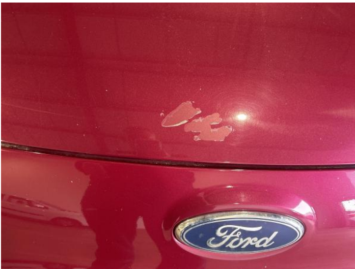
17: Bonnet Poor Previous Repair Paint Flake