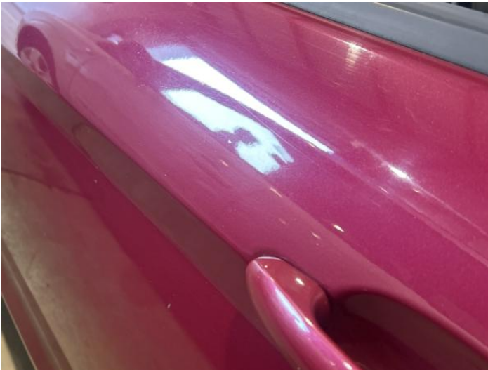
11: Door nsf Poor Previous Repair Poor Paint