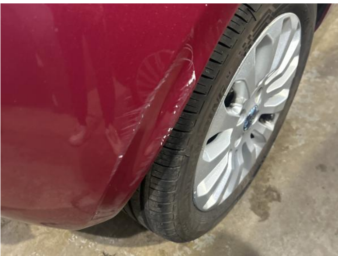
7: Bumper Rear Scratched Over 100mm Thru Paint