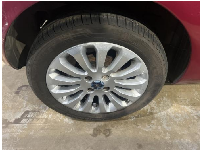
6: Wheel osr Scratched Up To 50mm