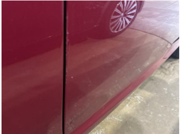
4: Door osf Chipped Edge Chip