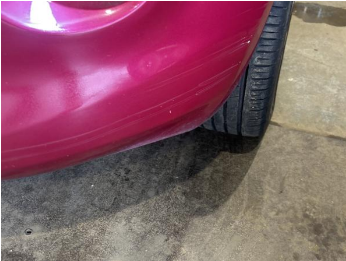
15: Bumper Front Scratched 25 to 100mm Thru Paint