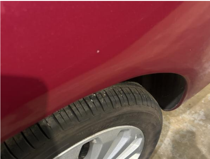
5: Qtr Panel osr Chipped 1 To 5