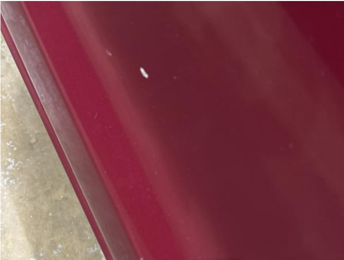
3: Door osf Chipped 1 To 5