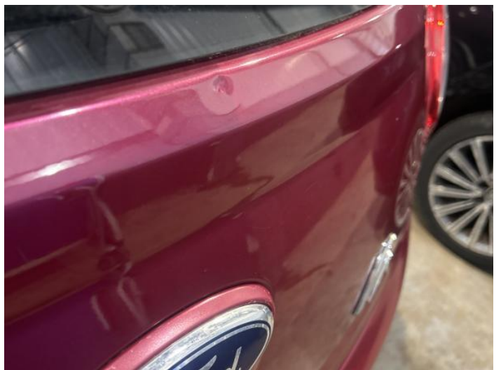
8: Tailgate Dented Between 10mm + 30mm