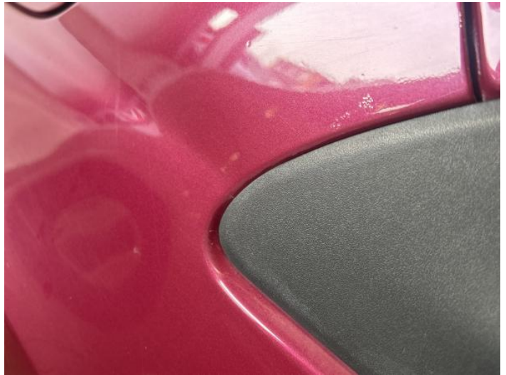
12: Wing nsf Poor Previous Repair Poor Paint