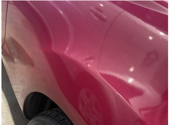
10: Qtr Panel nsf Poor Previous Repair Poor Paint