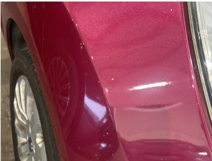
1: Wing osf Chipped Multiple Chips