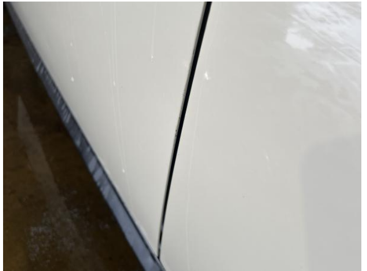
6: Door nsf Chipped Edge Chip