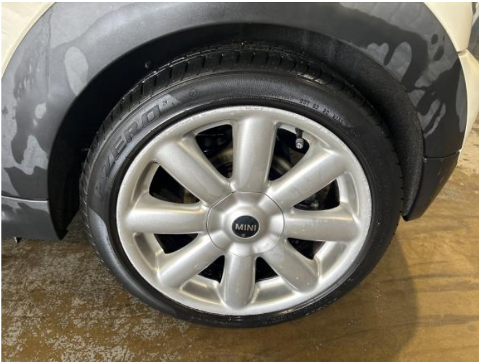
5: Wheel nsr Scratched Over 50mm