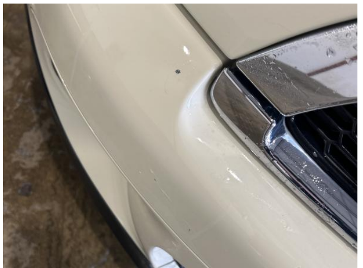
8: Bumper Front Chipped 1 To 5