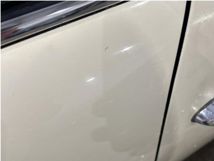
3: Qtr Panel osr Chipped 1 To 5