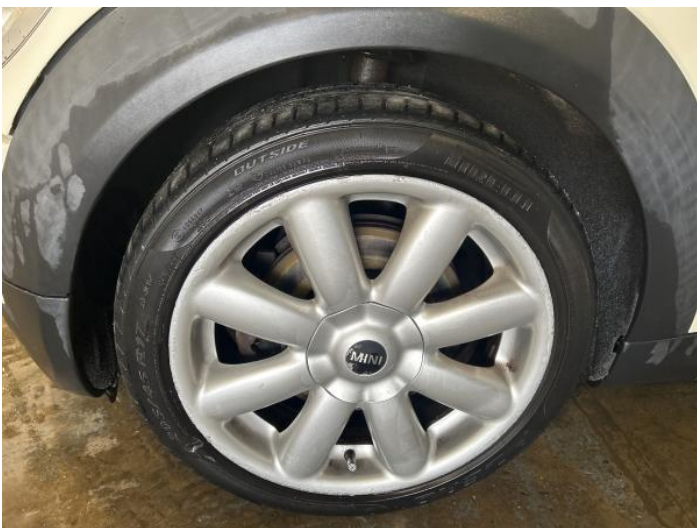
7: Wheel nsf Scratched Over 50mm