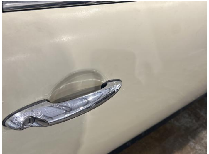
2: Door osf Poor Previous Repair Poor Paint