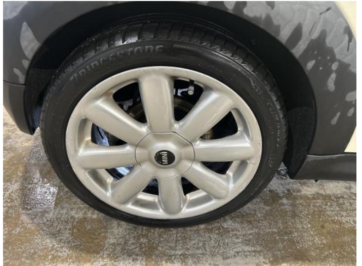
4: Wheel osr Scratched Over 50mm