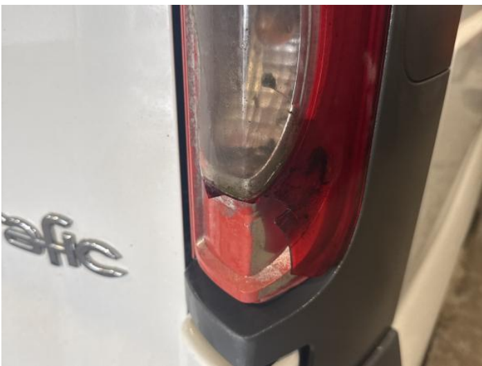
13: Lamp osr Broken Replace