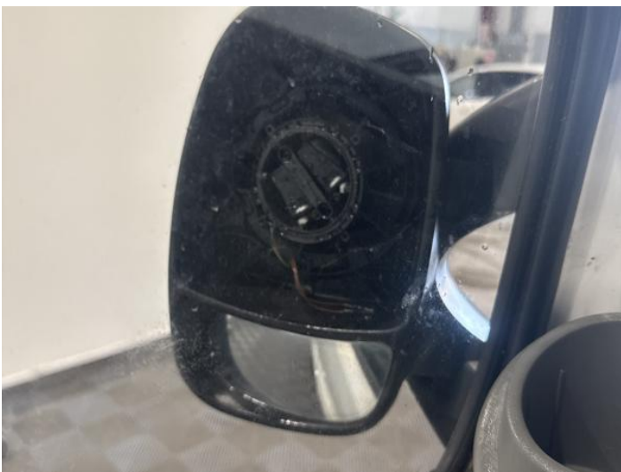
19: Door Mirror Glass ns Missing Replace