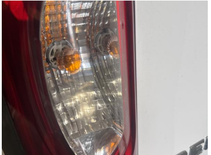
10: Lamp nsr Broken Replace