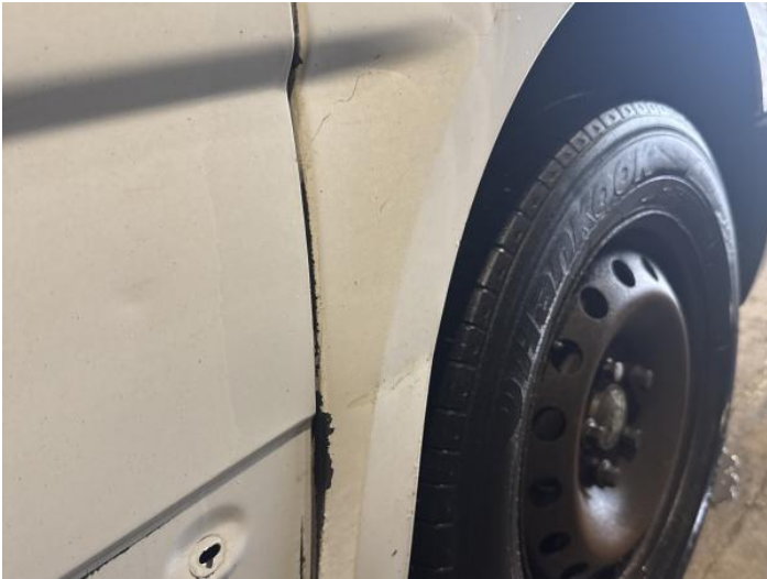
9: Qtr Panel nsr Dented With Paint Damage