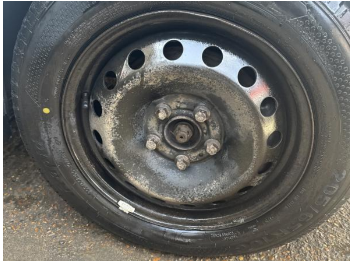
22: Wheel osf Dented Over 30mm (Steel)