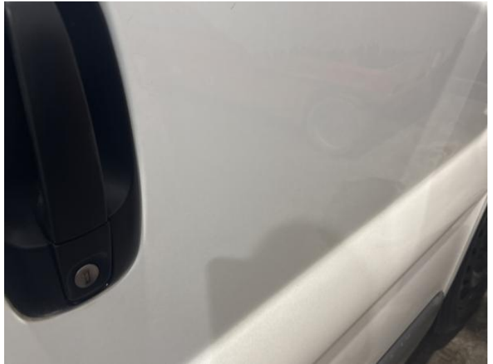
16: Door osf Dented Between 10mm + 30mm