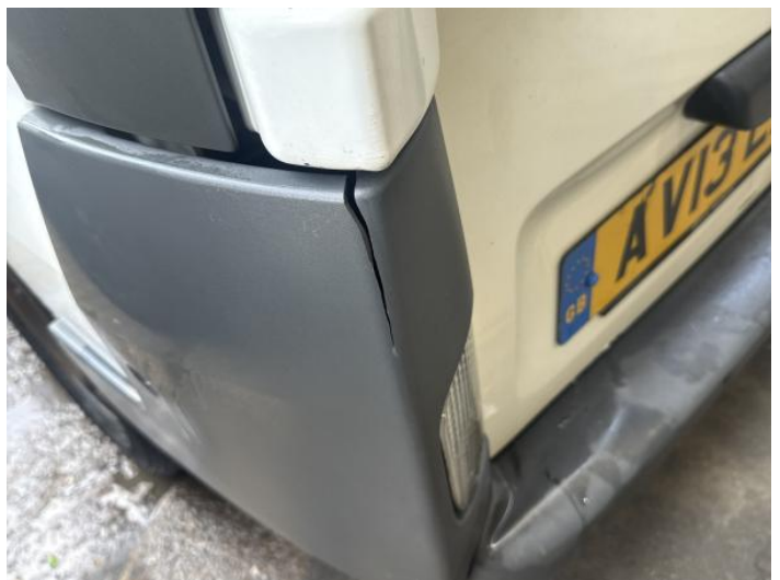
20: Bumper Rear Moulding Broken Replace