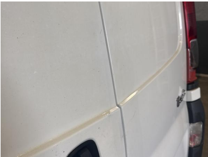
11: Tailgate Dented Over 30mm