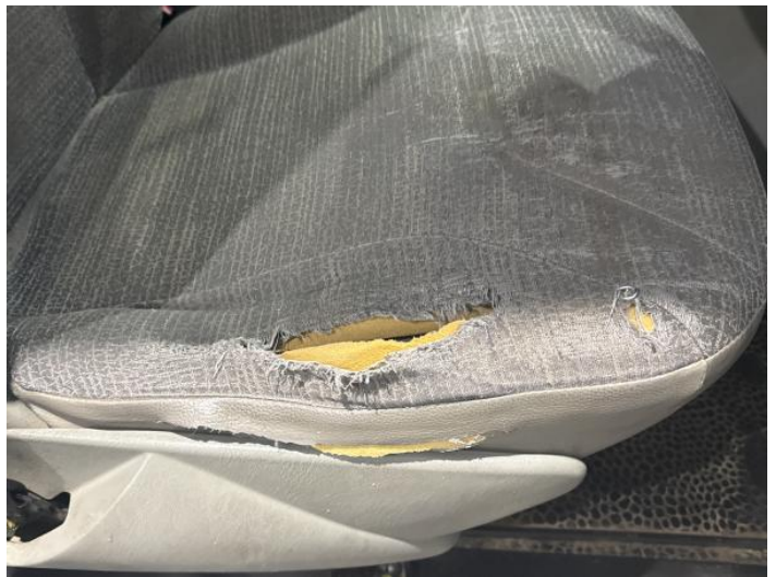
18: Seat Back Cover osf Torn Over 3mm