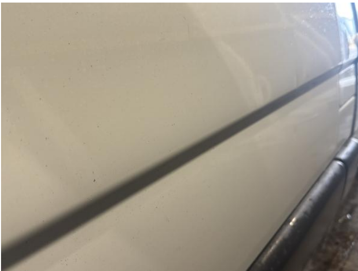
5: Door nsf Dented Over 30mm