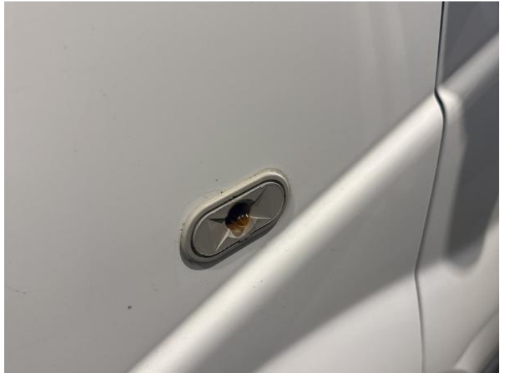
4: Flasher Side Repeater ns Broken Replace