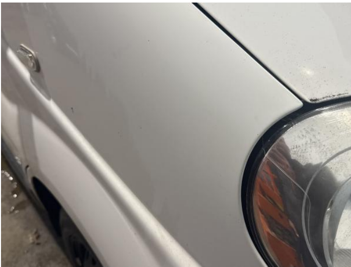
17: Wing osf Chipped 1 To 5