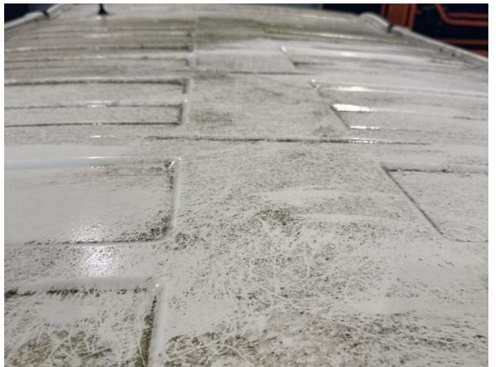
12: Roof Dented Over 30mm