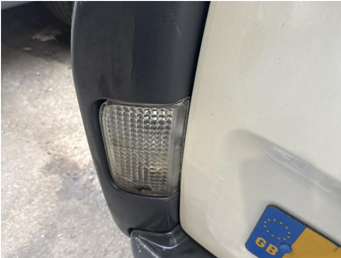
21: Bumper Reflector nsr Broken Replace