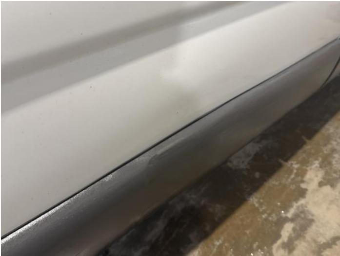
15: Panel Front Dented Over 30mm