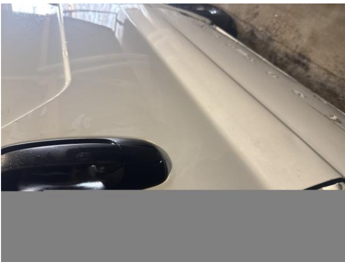
7: Door nsr Dented With Paint Damage