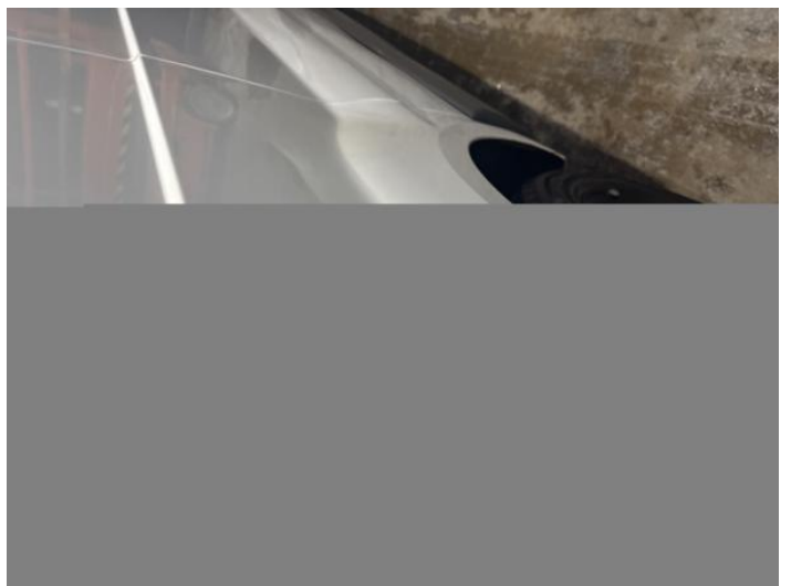
14: Qtr Panel osr Dented Over 30mm