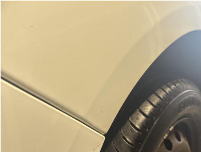
3: Wing nsf Chipped 1 To 5