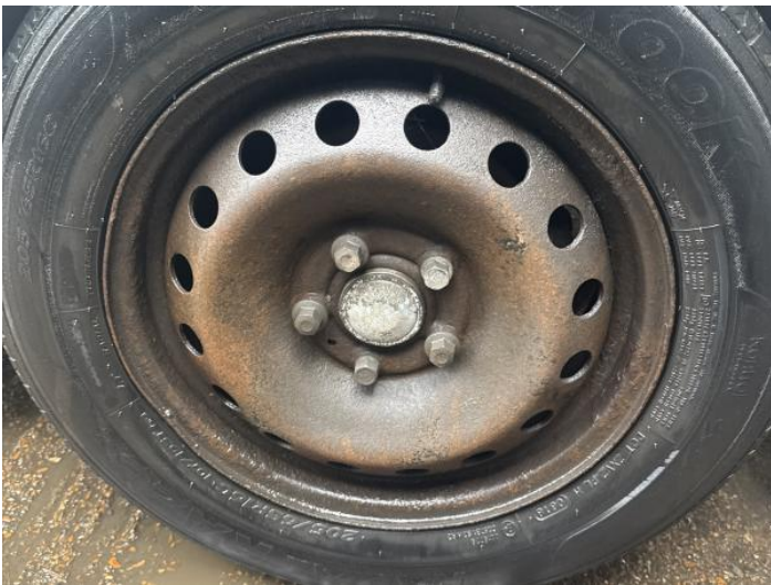
23: Wheel nsr Dented Over 30mm (Steel)