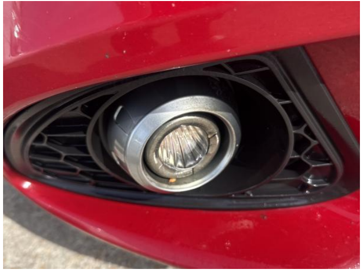
16: Fog Lamp Surround os Broken Replace