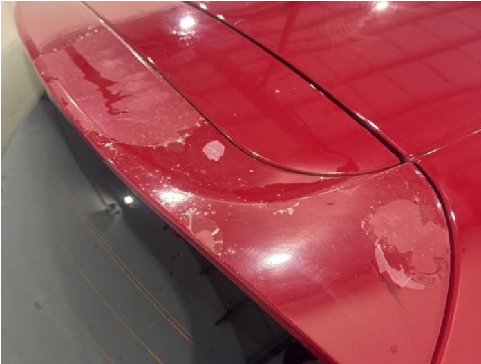
9: Spoiler Rear Scratched (Painted) Over 25mm Thru Paint