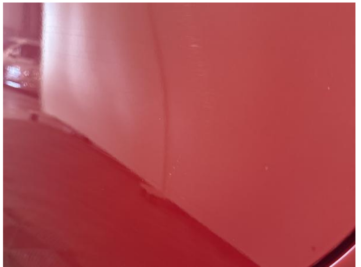
6: Door nsr Chipped 1 To 5