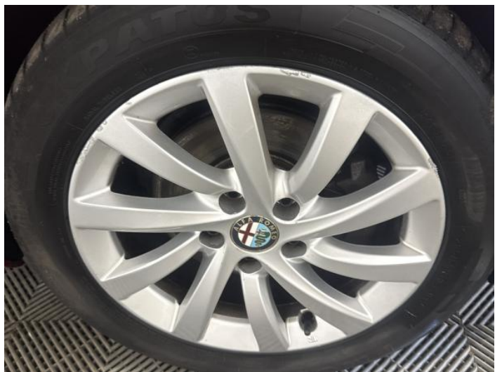
14: Wheel osf Scratched Over 50mm