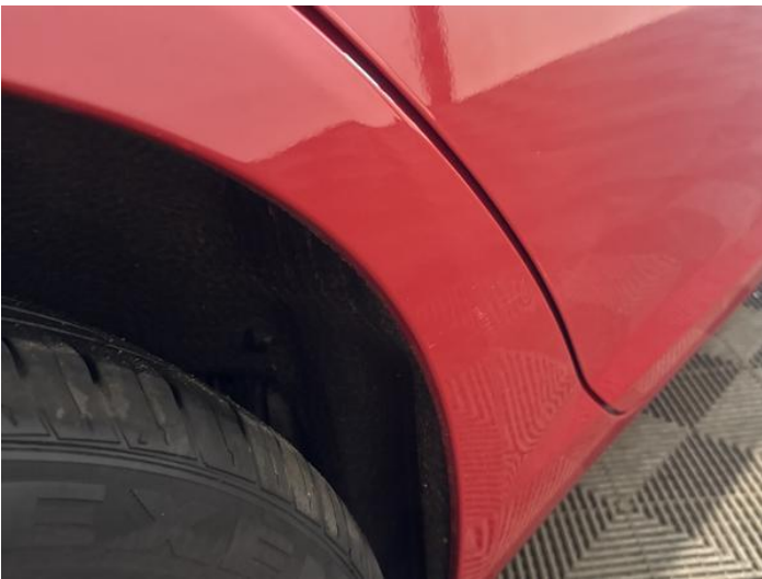
11: Qtr Panel osr Scratched Over 25mm Thru Paint