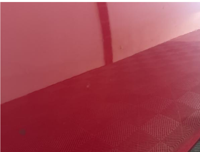
13: Door osf Rusted UpTo 5mm