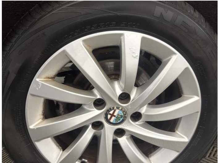
10: Wheel osr Corroded Light