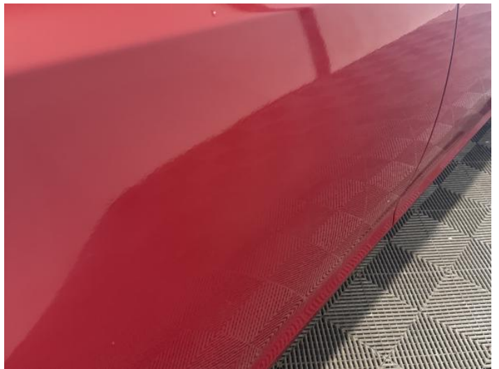
12: Door osr Poor Previous Repair Poor Paint