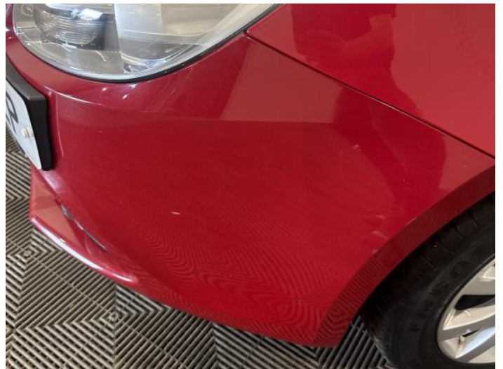
2: Bumper Front Poor Previous Repair Poor Colour