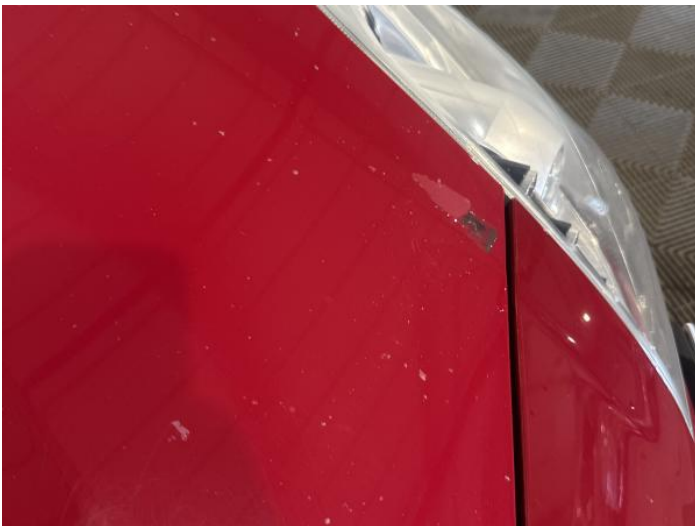
1: Bonnet Poor Previous Repair Paint Flake