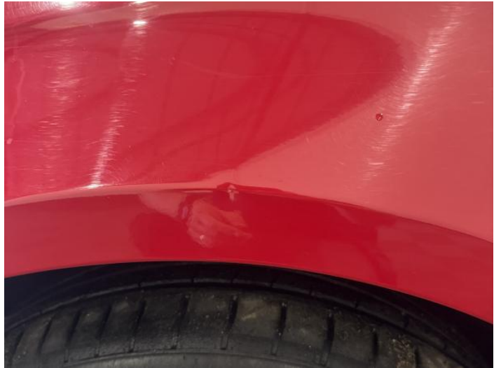
4: Wing osf Dented Between 10mm + 30mm