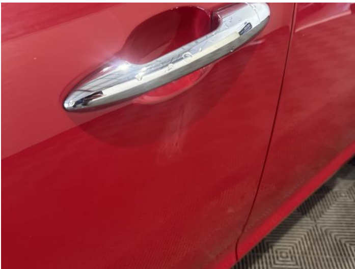
5: Door nsf Scratched Over 25mm Thru Paint