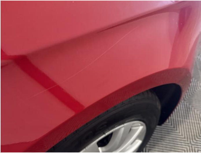
15: Wing osf Scratched Over 25mm Thru Paint