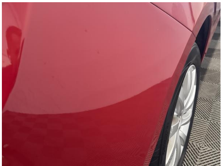
8: Bumper Rear Chipped 1 To 5