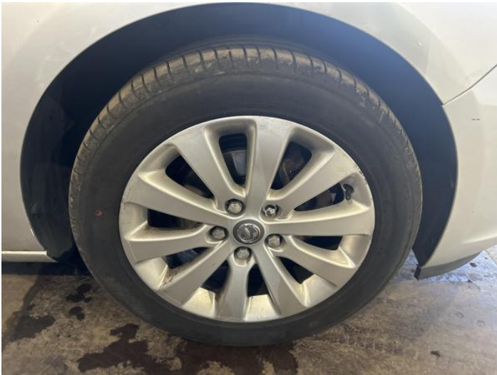
1: Wheel of Scratched Over 50mm