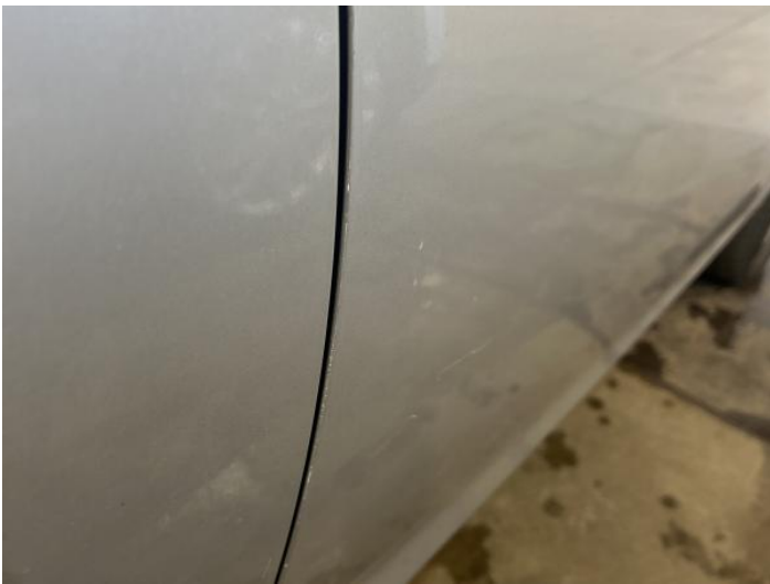
5: Door osf Chipped Edge Chip