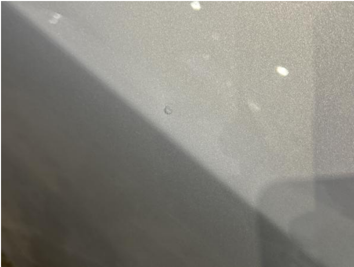
3: Door osf Chipped 1 To 5