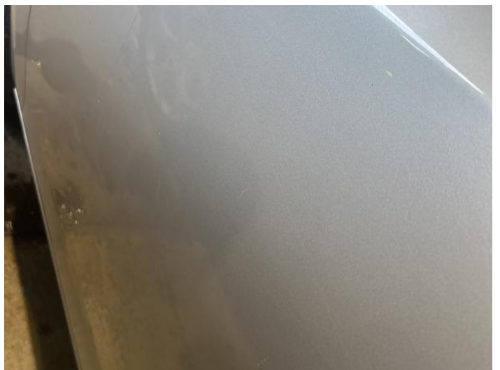
14: Door nsf Scratched Over 25mm Not Thru Paint