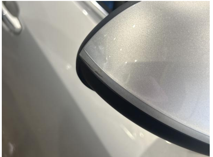
2: Door Mirror Assy of Scratched (Painted) Up To 25mm Thru Paint