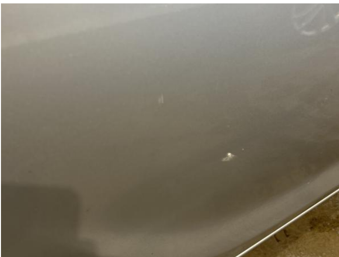
7: Door osr Chipped 1 To 5