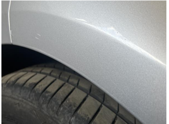
16: Wing nsf Chipped 1 To 5