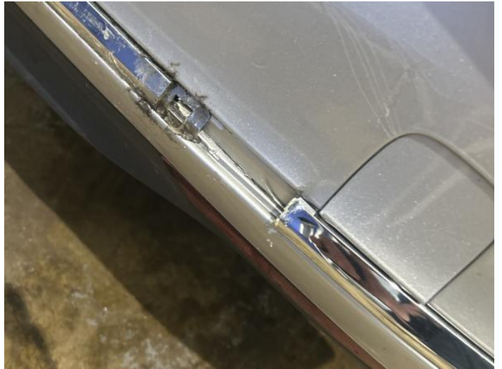
10: Bumper Rear Moulding Broken Replace