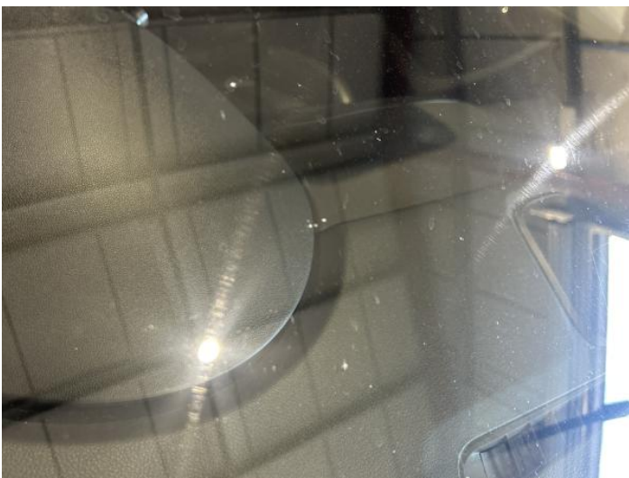
19: Screen Front Chipped UpTo 10mm