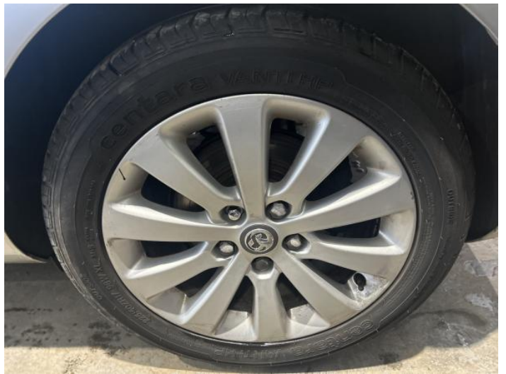
12: Wheel nsr Scratched Over 50mm