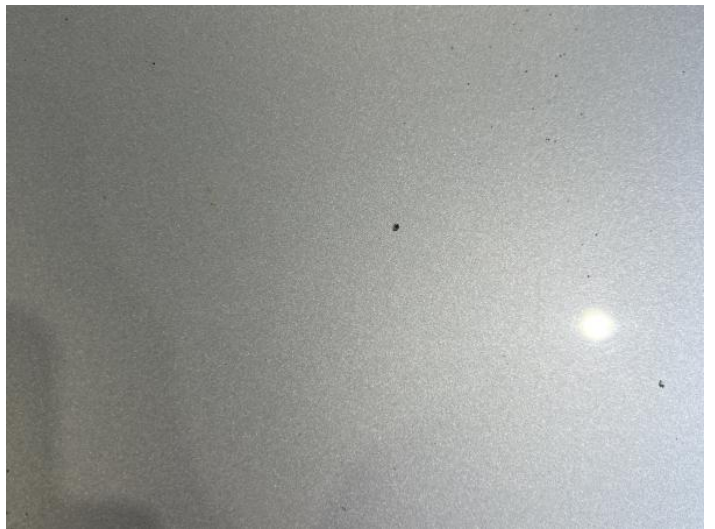
18: Bonnet Chipped 1 To 5