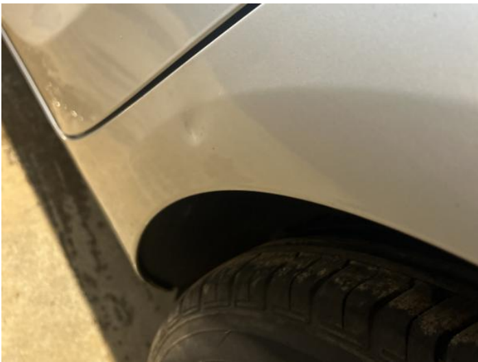
11: Qtr Panel nsr Dented Between 10mm + 30mm