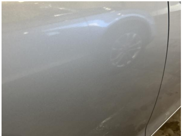
6: Door osr Scratched Over 25mm Not Thru Paint