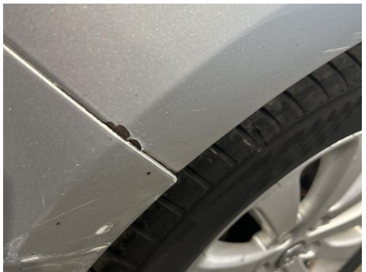
8: Qtr Panel osr Poor Previous Repair Paint Flake