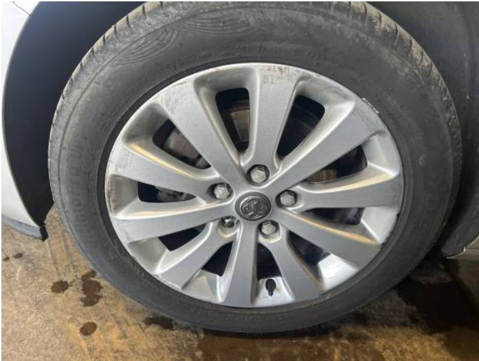
15: Wheel nsf Scratched Over 50mm