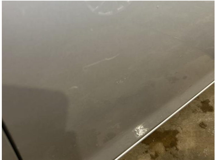
4: Door osf Scratched Over 25mm Not Thru Paint