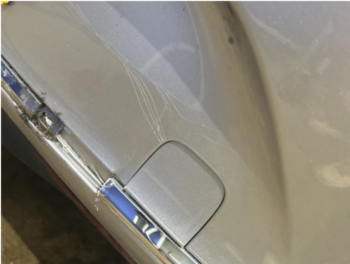
9: Bumper Rear Poor Previous Repair Paint Flake