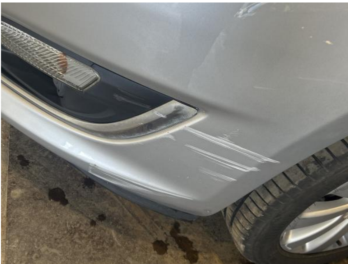
17: Bumper Front Scratched Over 100mm Thru Paint