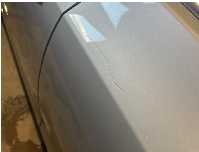
13: Door nsr Scratched Over 25mm Thru Paint