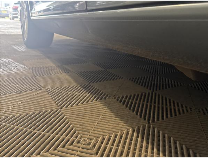
9: Sill ns Dented Over 30mm