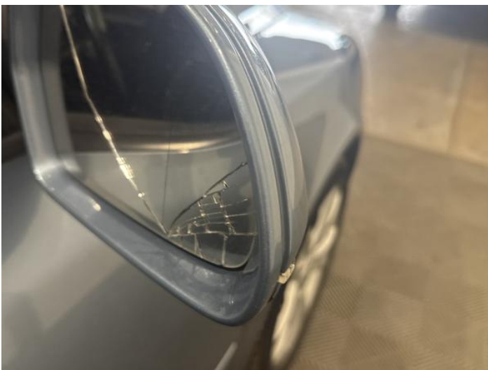
19: Door Mirror Glass os Broken Replace