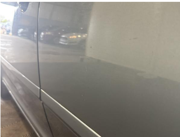
7: Door nsr Dented Over 30mm