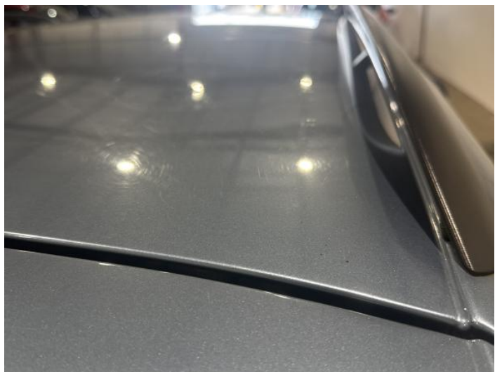
14: Roof Dented Over 30mm