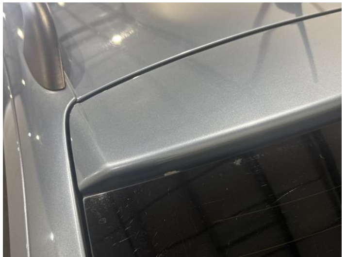
12: Tailgate Dented With Paint Damage