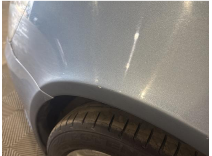
4: Wing nsf Chipped Over 5mm