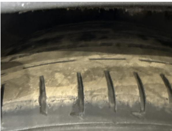
25: Tyre nsf Damaged Replace