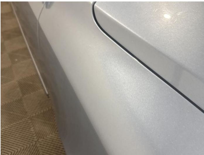
23: Wing osf Chipped 1 To 5