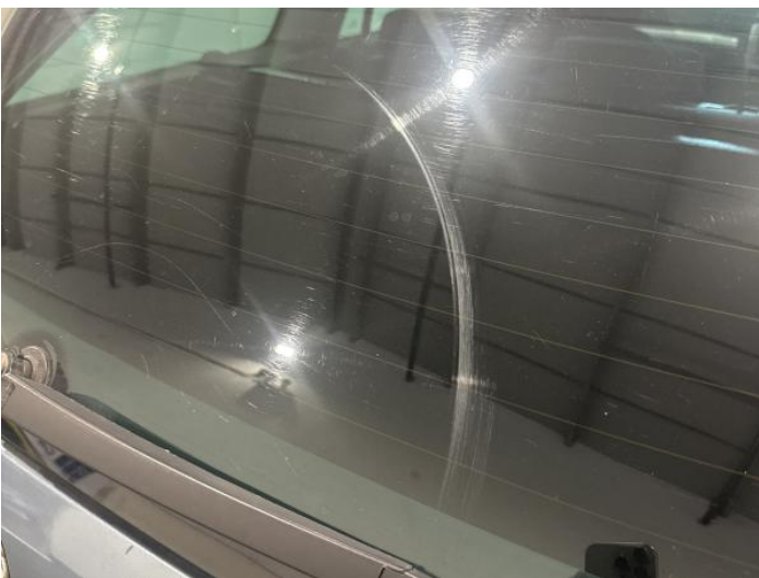
13: Screen Rear Scratched Over 30mm