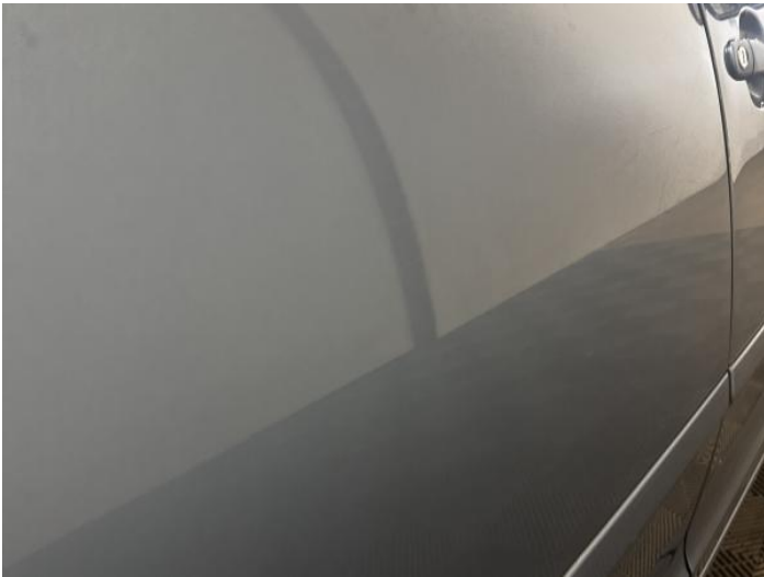
17: Door osr Dented With Paint Damage