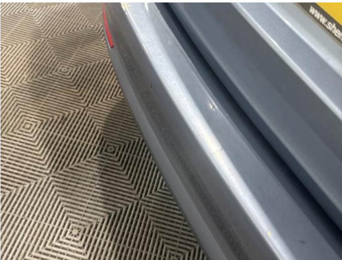
11: Bumper Rear Scratched 25 to 100mm Thru Paint