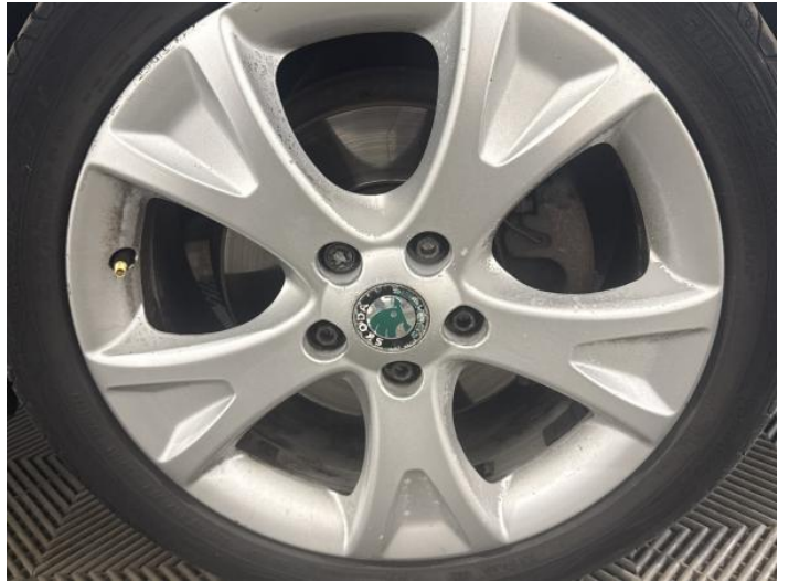
22: Wheel osf Scratched Over 50mm