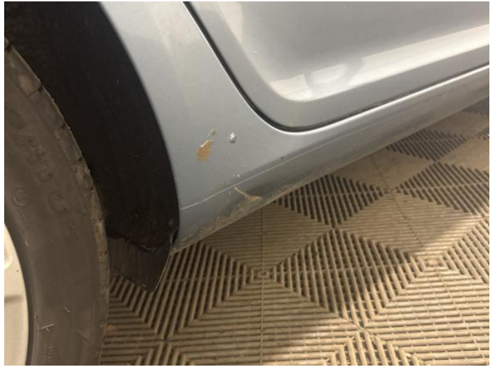
16: Qtr Panel osr Rusted Over 5mm