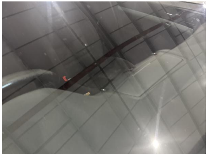
24: Screen Front Chipped Over 10mm