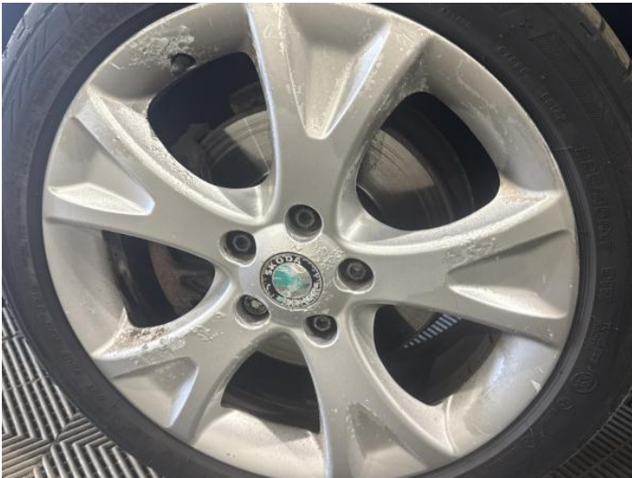
5: Wheel nsf Scratched Over 50mm