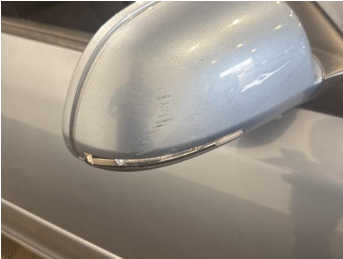
21: Door Mirror Assy osf Scratched (Painted) Over 25mm Thru Paint