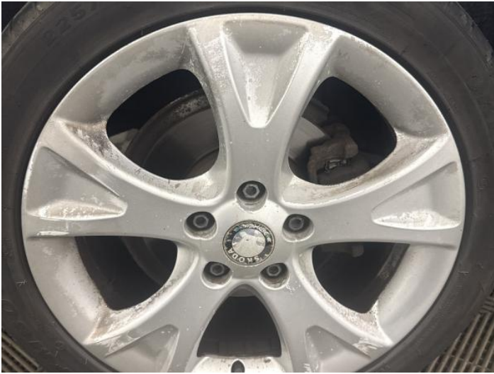
15: Wheel osr Scratched Over 50mm