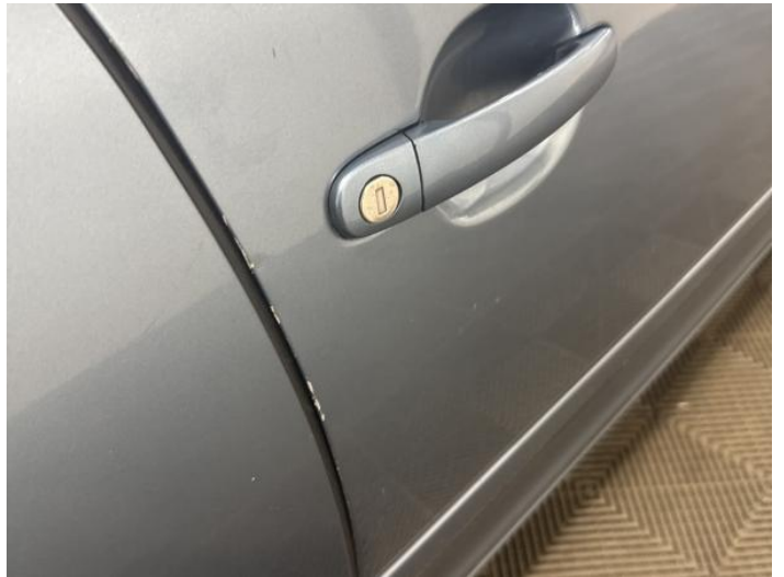
18: Door osf Chipped Edge Chip