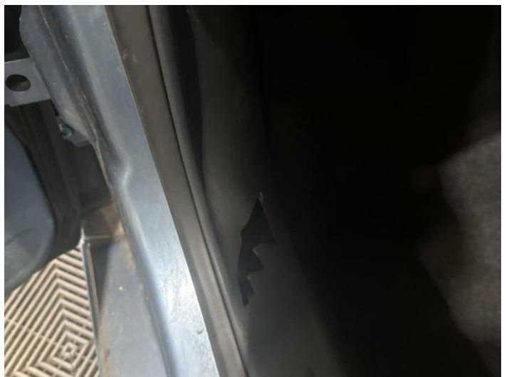
26: Fascia Trim Damaged Replace