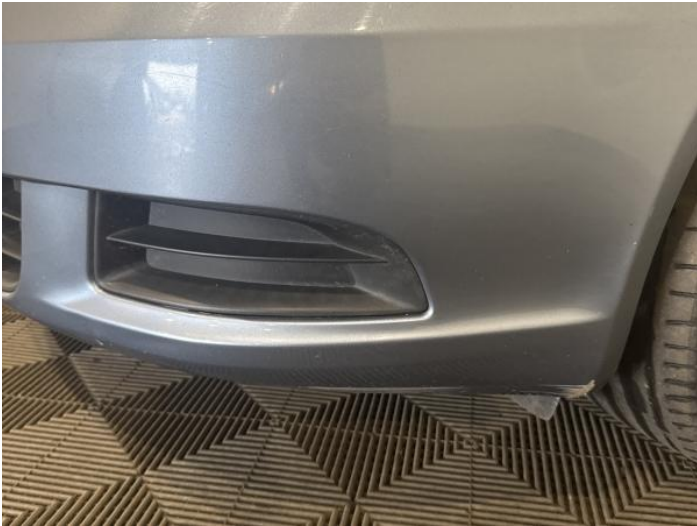
3: Bumper Front Scratched 25 to 100mm Thru Paint