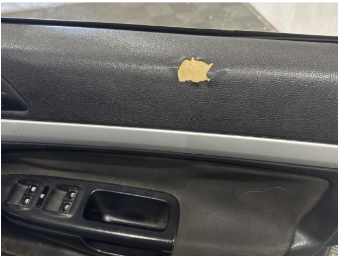
1: Door Pad osf Scuffed Over 25mm