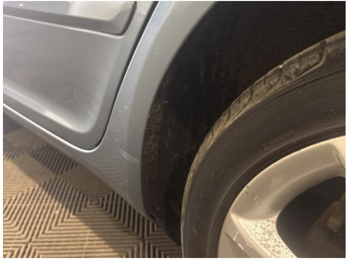
10: Qtr Panel nsr Scratched Over 25mm Thru Paint