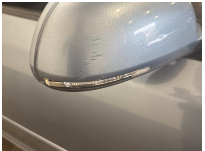
20: Flasher Side Repeater os Broken Replace