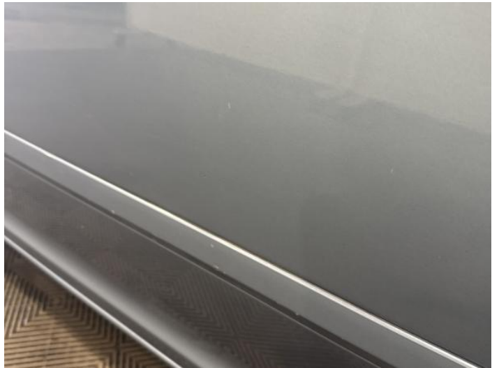
6: Door nsf Dented Over 30mm