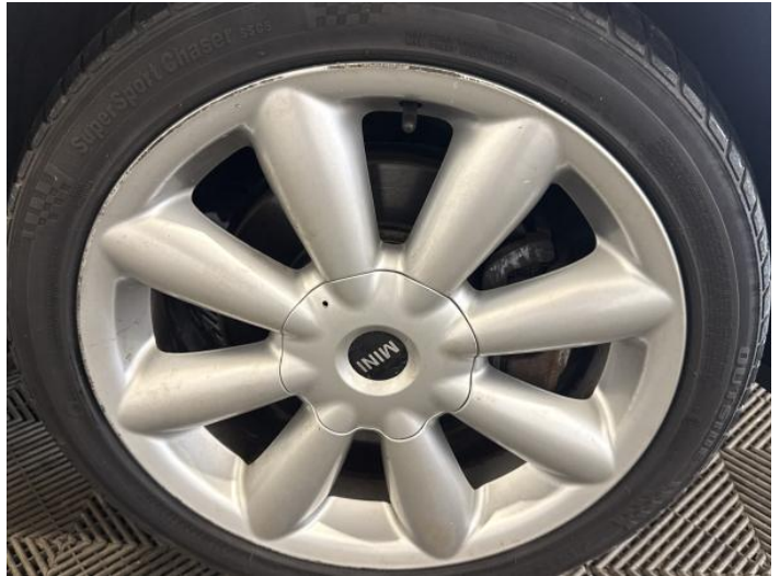
10: Wheel osf Scratched Over 50mm