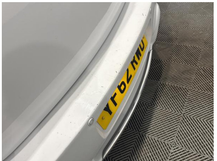
8: Bumper Rear Dented With Paint Damage