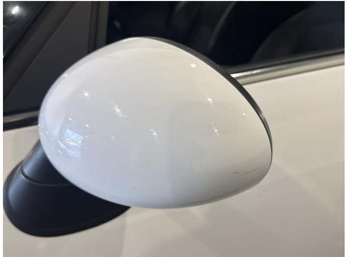
4: Door Mirror Assy nsf Scratched (Painted) UpTo 25mm Thru Paint