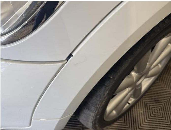
11: Wing Front Arch Extension ns Scratched (Painted) Over 25mm Thru Paint