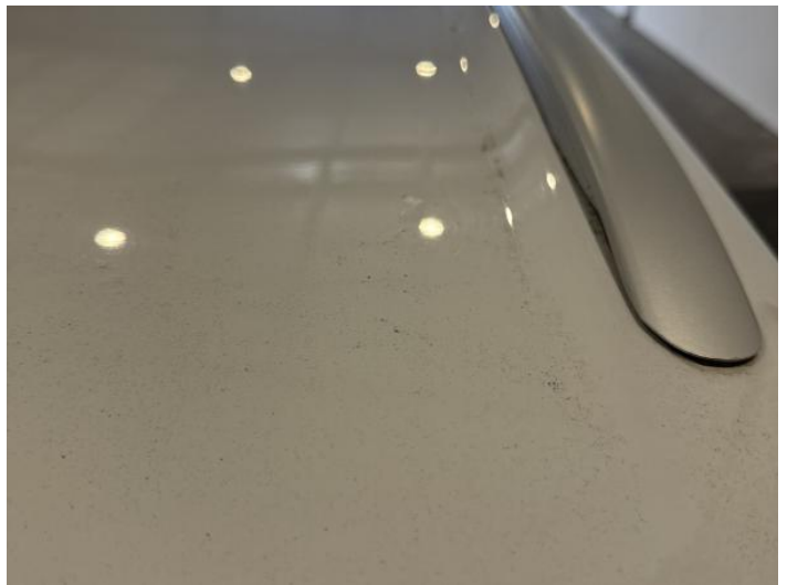
12: Roof Dented Between 10mm + 30mm