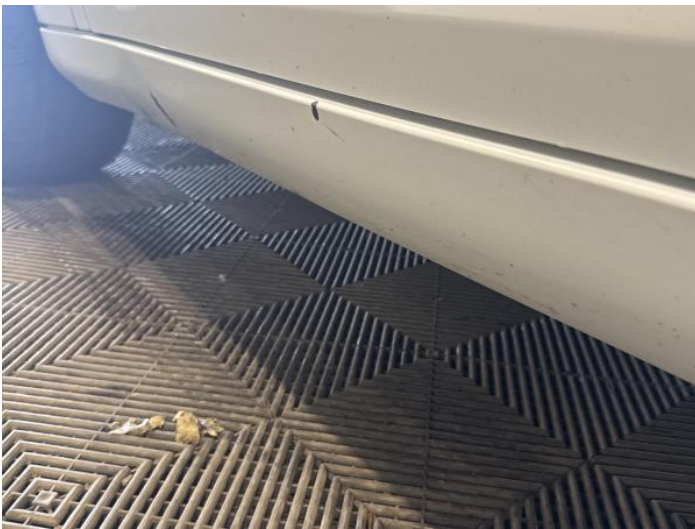
5: Sill ns Scratched Over 25mm Thru Paint