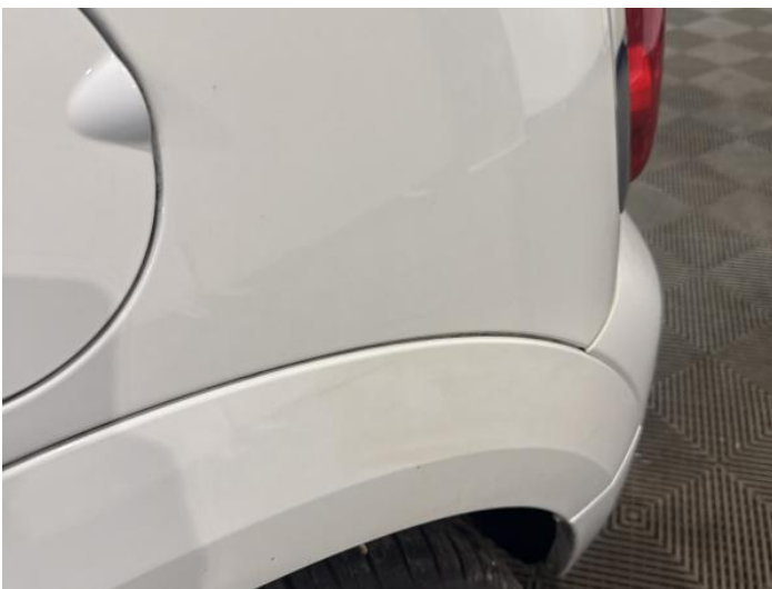
7: Qtr Panel nsr Chipped 1 To 5