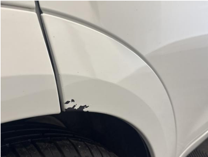
9: Door Moulding osr Scratched (Painted) Over 25mm Thru Paint