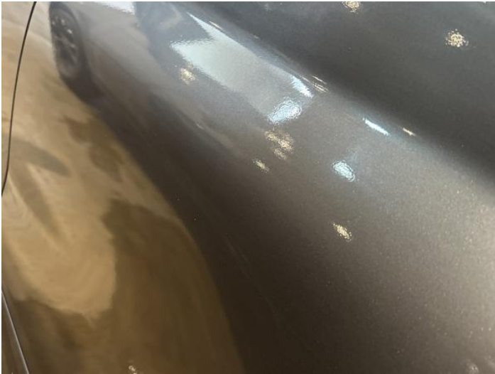
9: Door nsr Poor Previous Repair Poor Paint