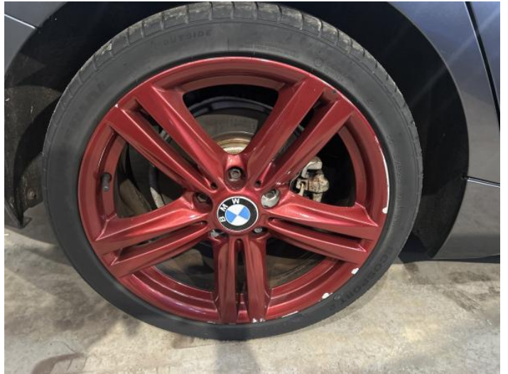
4: Wheel osr Scratched Over 50mm