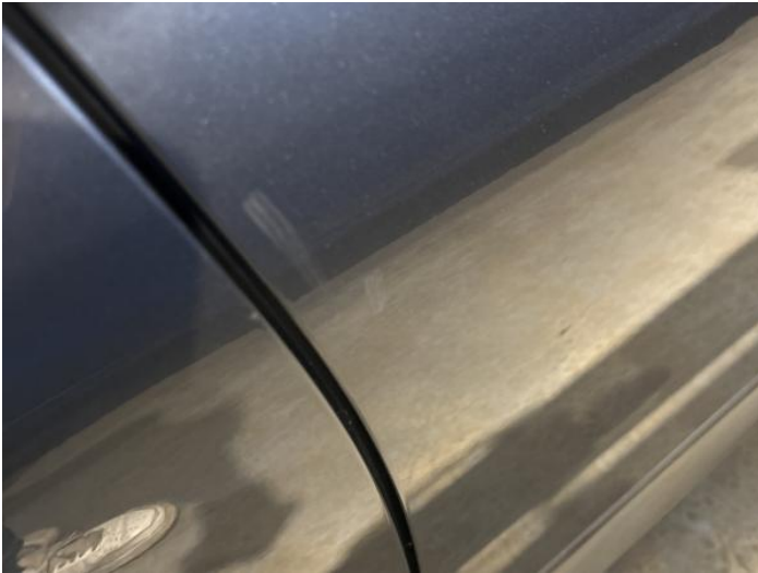
3: Door osf Poor Previous Repair Poor Paint