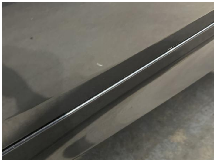
6: Door nsr Chipped 1 To 5