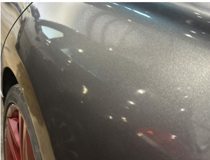
7: Qtr Panel nsr Poor Previous Repair Poor Paint