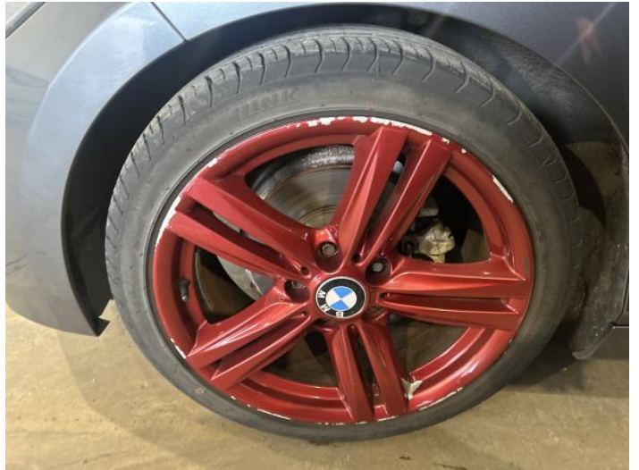
10: Wheel nsf Scratched Over 50mm