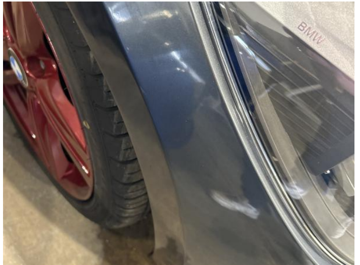
12: Bumper Front Poor Previous Repair Poor Paint