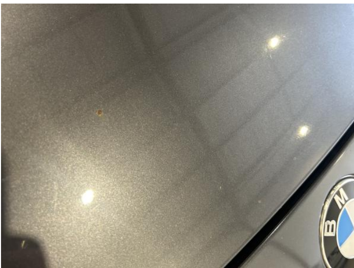
13: Bonnet Chipped 1 To 5