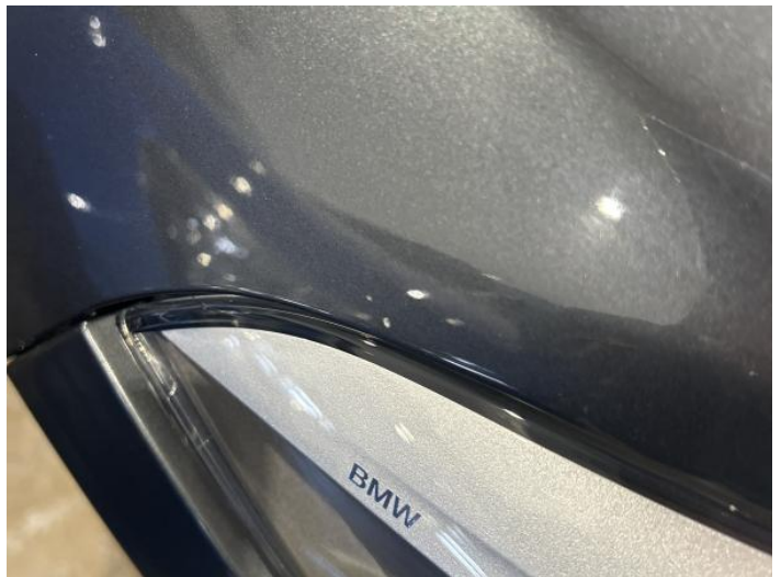
2: Wing of Chipped 1 To 5