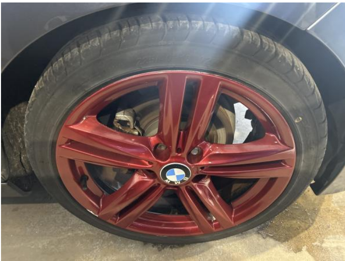
1: Wheel of Scratched Up To 50mm