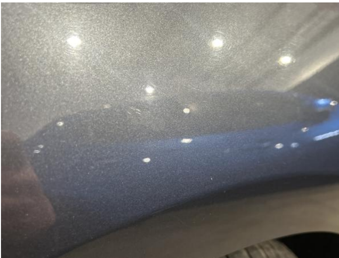
5: Qtr Panel osr Poor Previous Repair Poor Paint