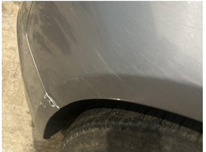
12: Wing nsf Dented With Paint Damage