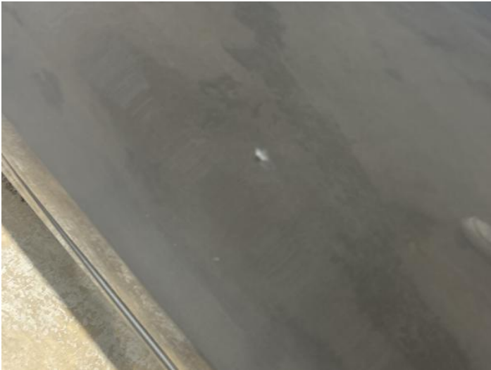
3: Door osf Chipped 1 To 5