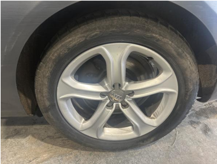
9: Wheel nsr Scratched Up To 50mm