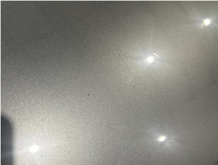
15: Bonnet Chipped 1 To 5