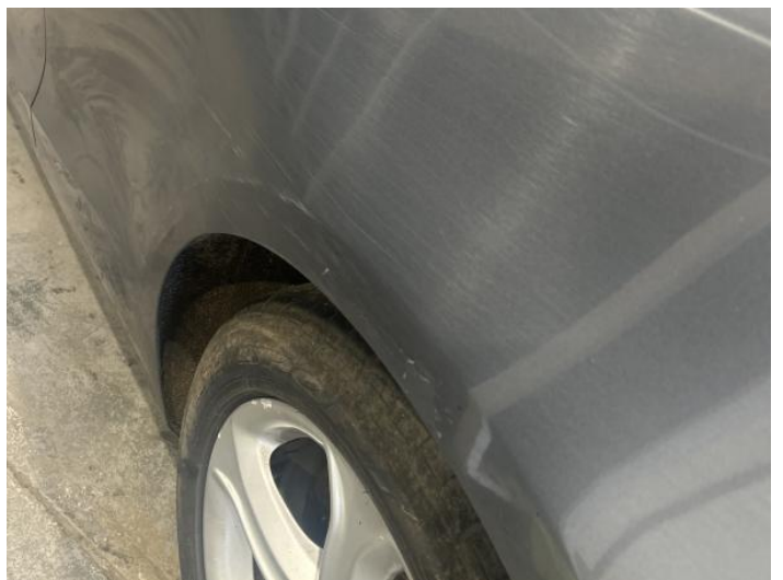
8: Qtr Panel nsr Dented With Paint Damage