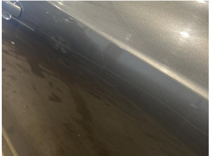
4: Door osf Scratched Over 25mm Not Thru Paint