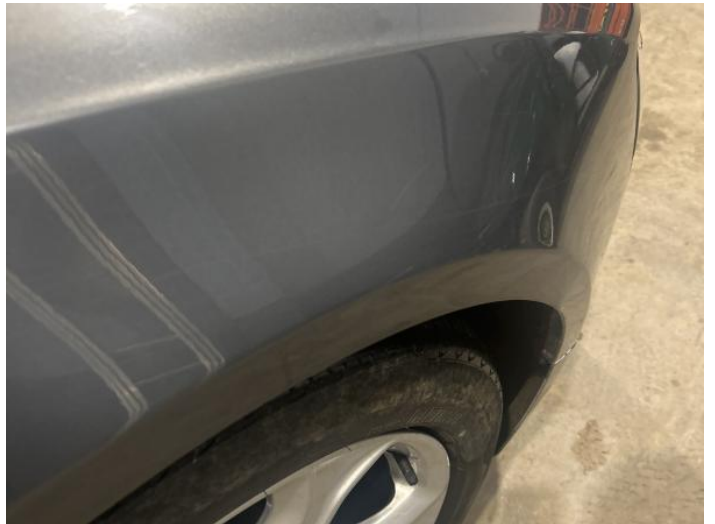
2: Wing osf Scratched Over 25mm Not Thru Paint