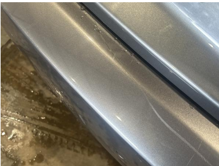
7: Bumper Rear Poor Previous Repair Poor Paint