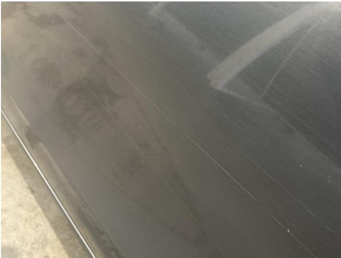
11: Door nsf Scratched Over 25mm Not Thru Paint