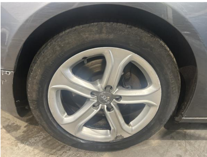
13: Wheel nsf Scratched Over 50mm