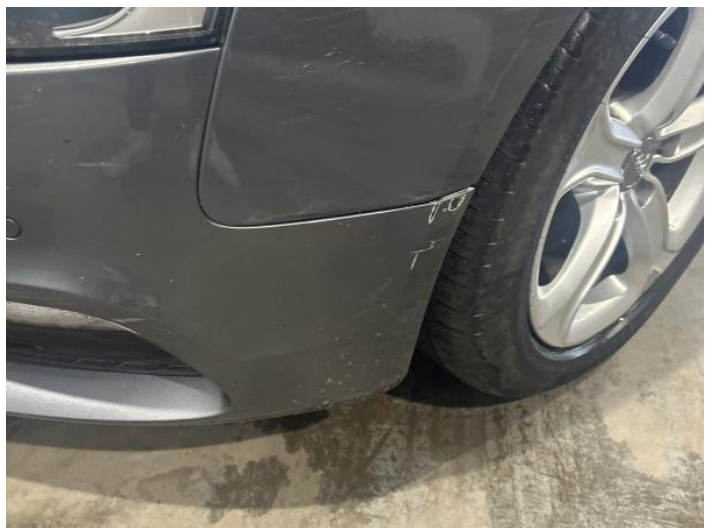
14: Bumper Front Scratched Over 100mm Thru Paint