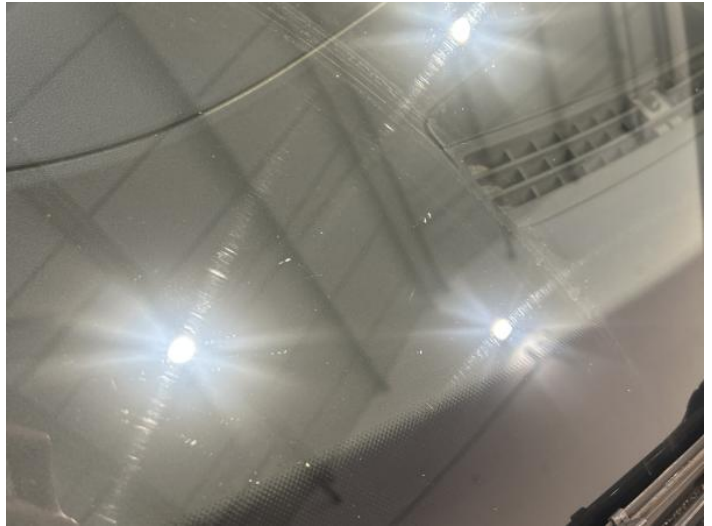
16: Screen Front Chipped UpTo 10mm