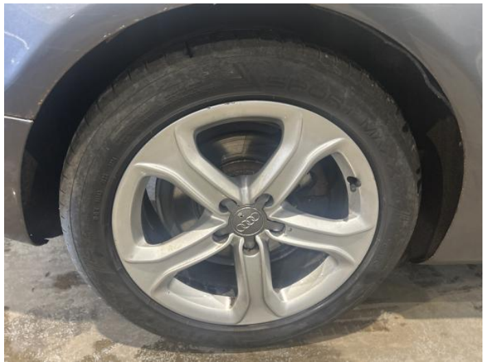
6: Wheel osr Scratched Up To 50mm