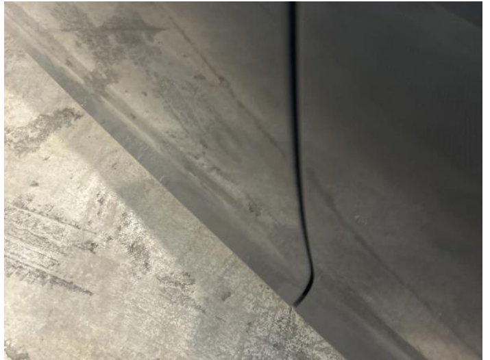
10: Door nsf Dented 2 Or Less Up To 10mm