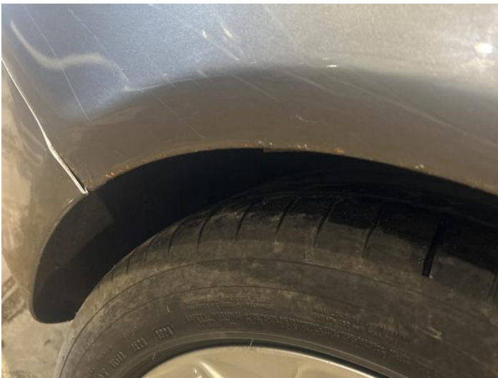
5: Qtr Panel osr Rusted Over 5mm