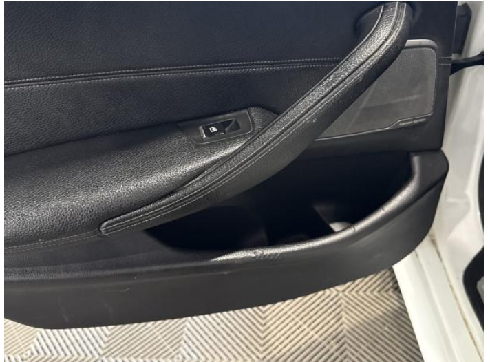
16: Door Pad nsr Scuffed Over 25mm