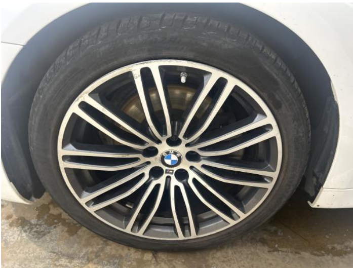
11: Wheel nsf Scratched Over 50mm