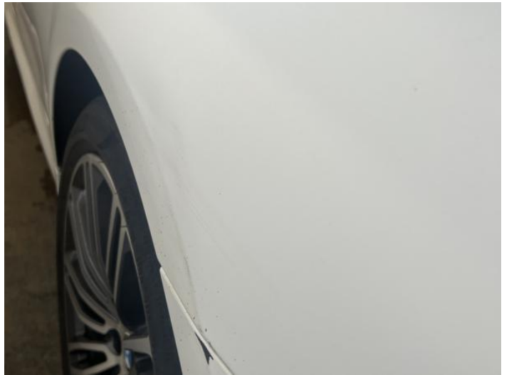
6: Qtr Panel nsr Dented With Paint Damage