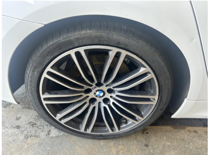
4: Wheel osr Scratched Over 50mm