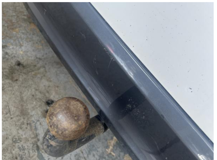
14: Bumper Rear Moulding Scratched (Painted) Over 25mm Thru Paint