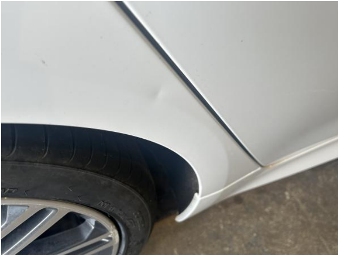
3: Qtr Panel osr Dented 2 Or Less UpTo 10mm