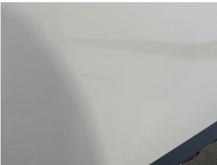
13: Bonnet Scratched UpTo 25mm Not Thru Paint