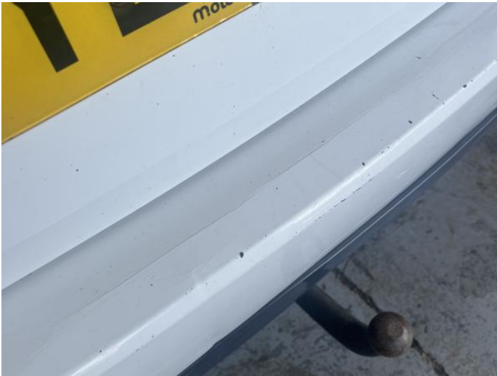
5: Bumper Rear Poor Previous Repair Paint Flake