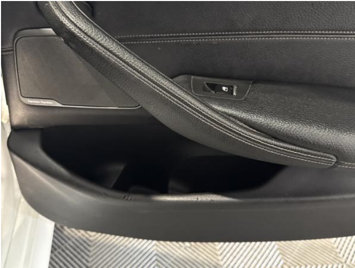
15: Door Pad osr Scuffed Over 25mm