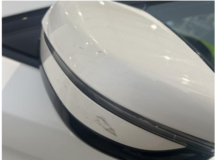
10: Door Mirror Assy nsf Scratched (Painted) Over 25mm Not Thru Paint