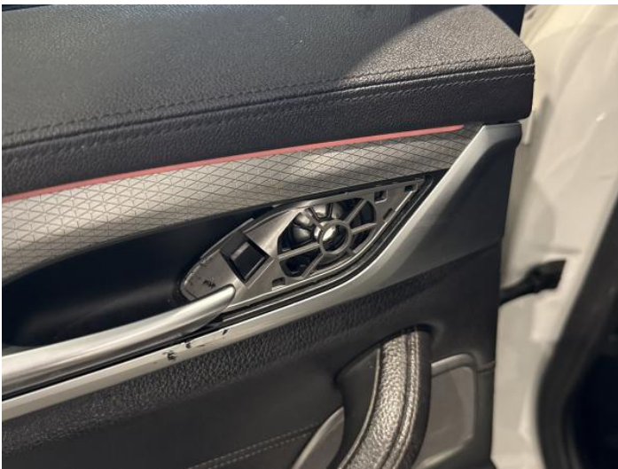
17: Fascia Trim Missing Replace