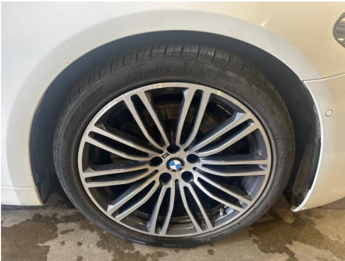
1: Wheel of Scratched Over 50mm