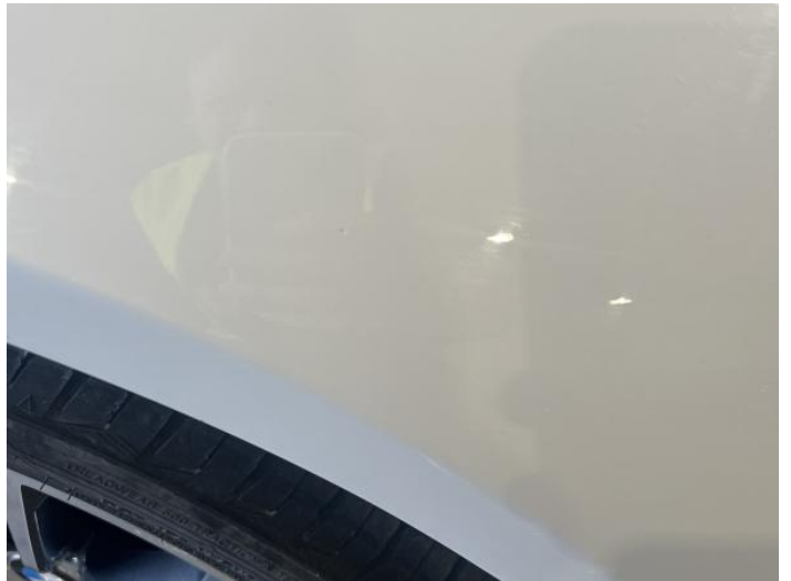
2: Wing of Chipped 1 To 5