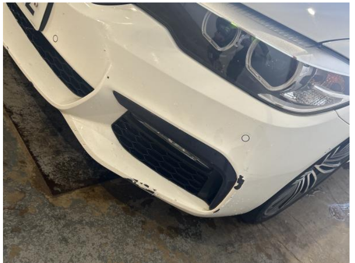
12: Bumper Front Scratched Over 100mm Thru Paint