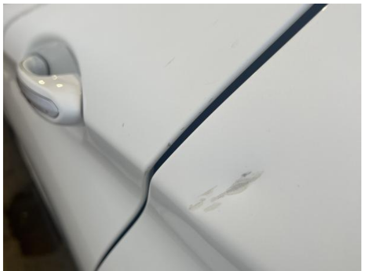
8: Door nsr Chipped Edge Chip