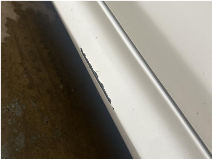
9: Sill Panel Trim ns Scratched (Painted) Over 25mm Thru Paint