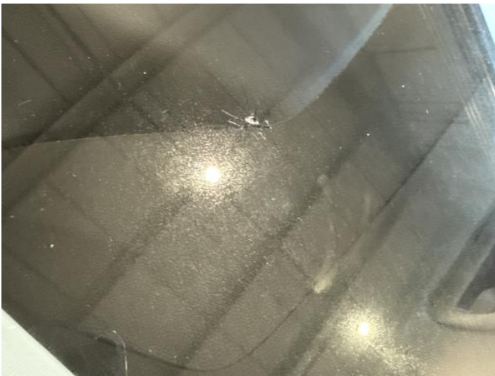
17: Screen Front Cracked Replace