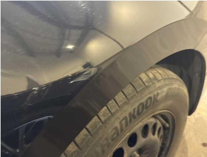
15: Wing osf Scratched UpTo 25mm Thru Paint