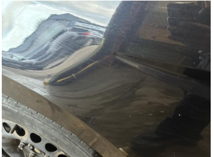
4: Wing nsf Chipped Multiple Chips