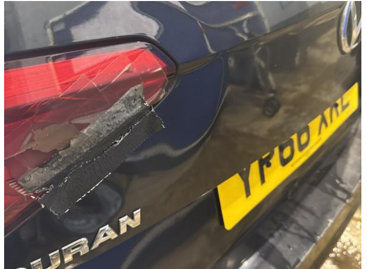
10: Tailgate Dented Over 30mm