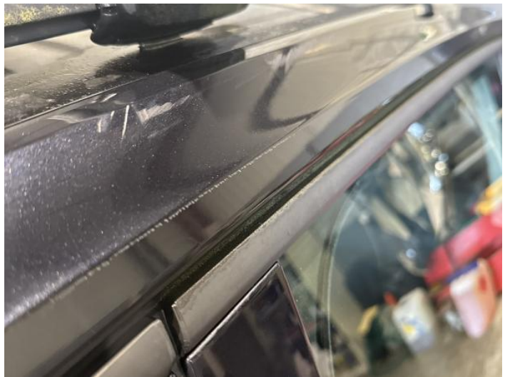
6: B Post ns Dented Between 10mm + 30mm