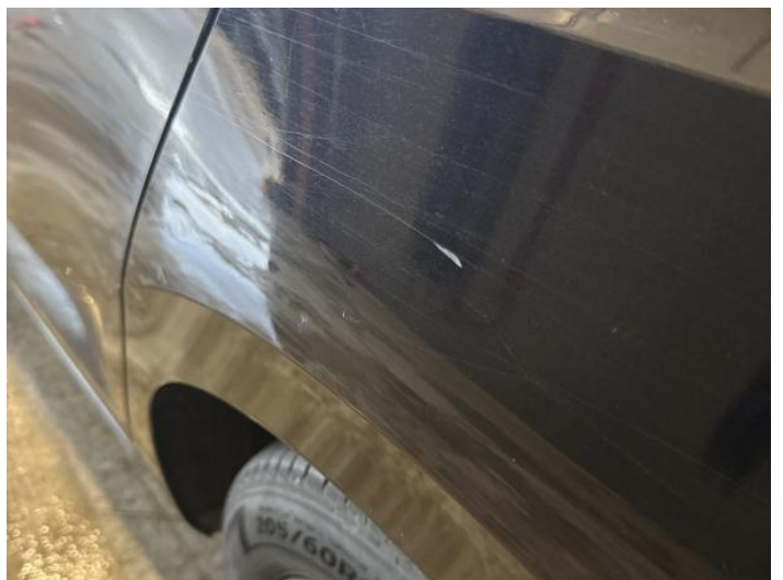
8: Qtr Panel nsr Dented With Paint Damage