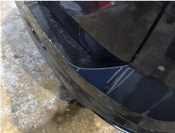
11: Bumper Rear Scratched Over 100mm Thru Paint