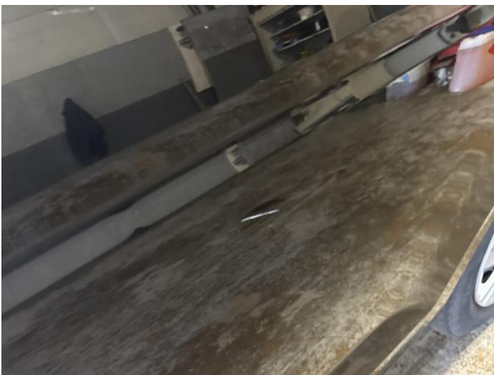
7: Door nsr Dented With Paint Damage