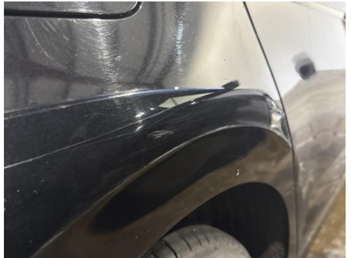
12: Qtr Panel osr Dented With Paint Damage