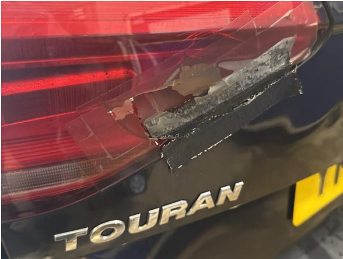
9: Lamp nsr Broken Replace