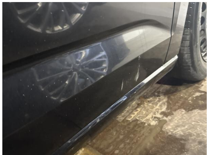
14: Door osf Scratched Over 25mm Thru Paint