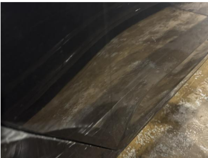
13: Door osr Dented With Paint Damage