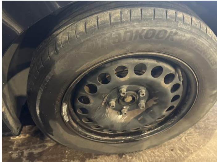
16: Wheel Trim osf Missing Replace