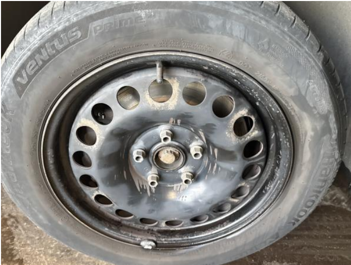
3: Wheel Trim nsf Missing Replace