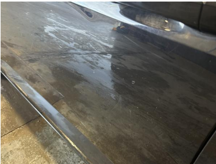
5: Door nsf Scratched Over 25mm Thru Paint