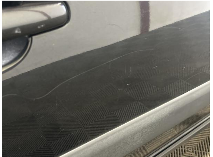
4: Door osf Scratched Over 25mm Thru Paint