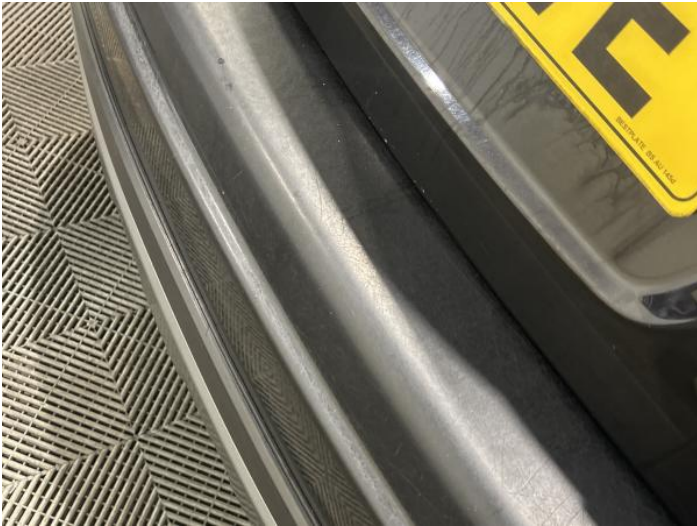
9: Bumper Rear Poor Previous Repair Poor Paint