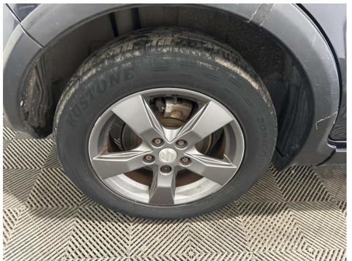
8: Wheel osr Scratched Over 50mm