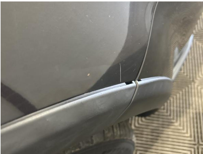
1: Wing osf Chipped 1 To 5