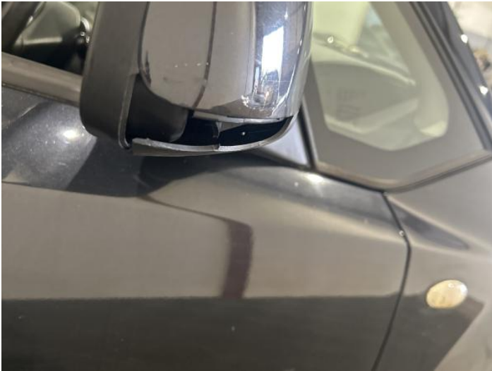
3: Door Mirror Assy osf Broken Replace