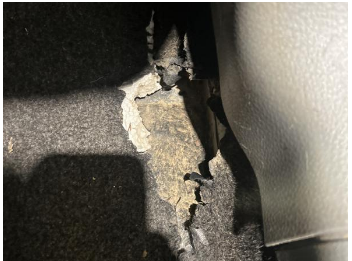
24: Carpets Front Holed Over 3mm