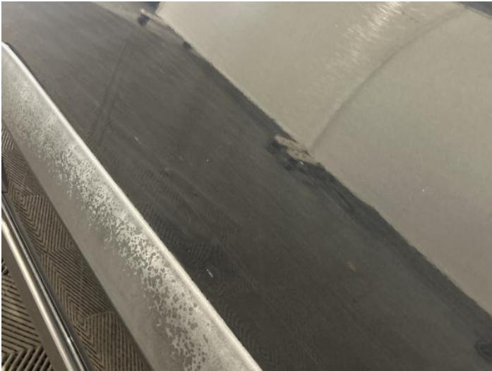
15: Door nsf Scratched Over 25mm Not Thru Paint