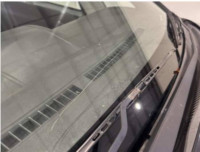
23: Screen Front Cracked Replace