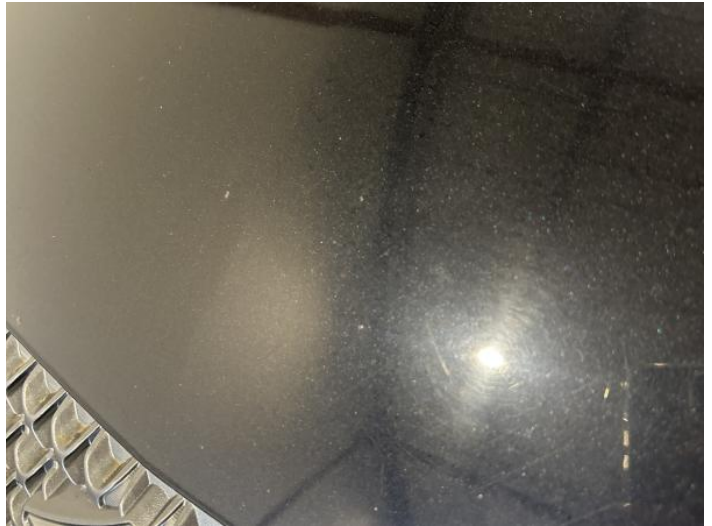
22: Bonnet Chipped 1 To 5