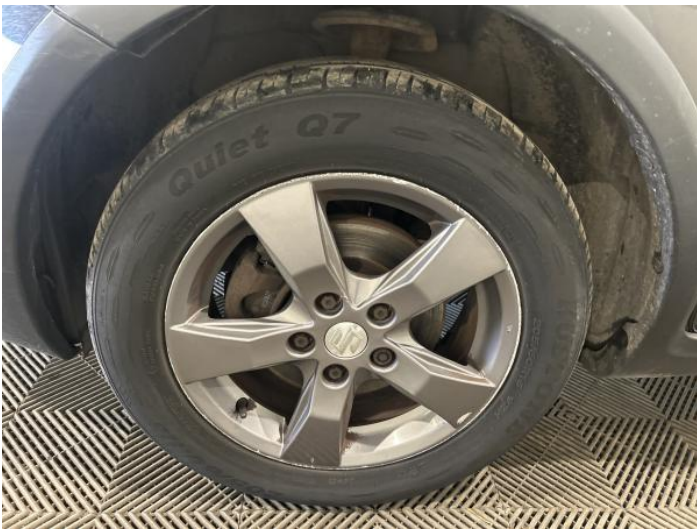
17: Wheel nsf Scratched Over 50mm