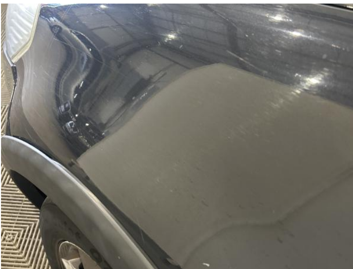
19: Wing nsf Scratched Over 25mm Not Thru Paint