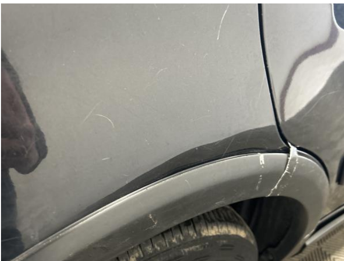
7: Qtr Panel osr Dented With Paint Damage