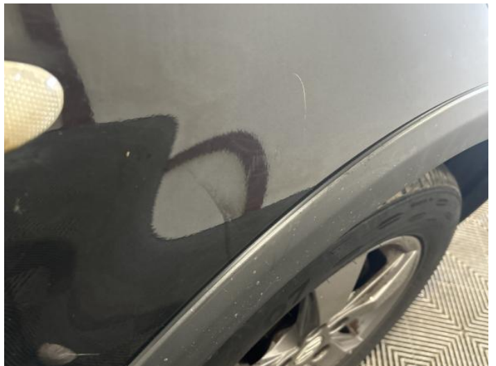
2: Wing osf Scratched Over 25mm Not Thru Paint