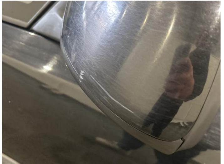
16: Door Mirror Assy nsf Scratched (Painted) Over 25mm Thru Paint