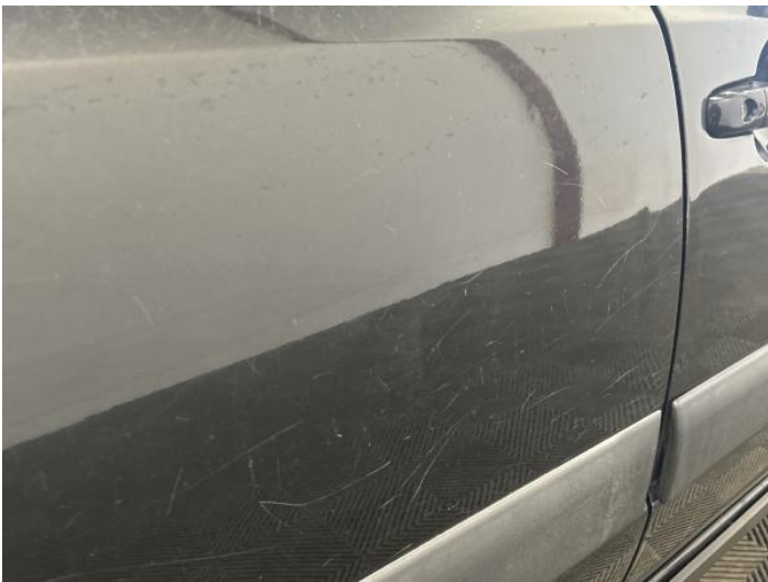
5: Door osr Scratched Over 25mm Thru Paint