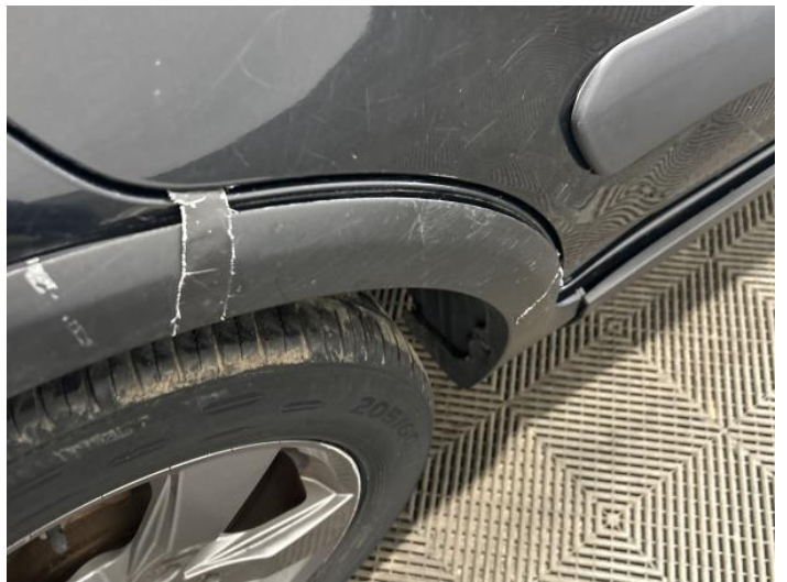
6: Qtr Panel Moulding os Broken Replace