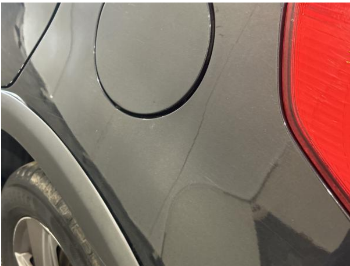
11: Qtr Panel nsr Scratched Over 25mm Not Thru Paint