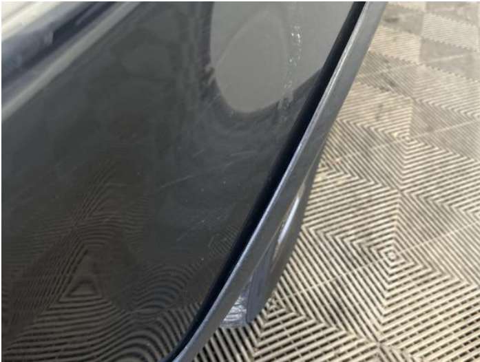
21: Bumper Front Scratched Over 25mm Not Thru Paint