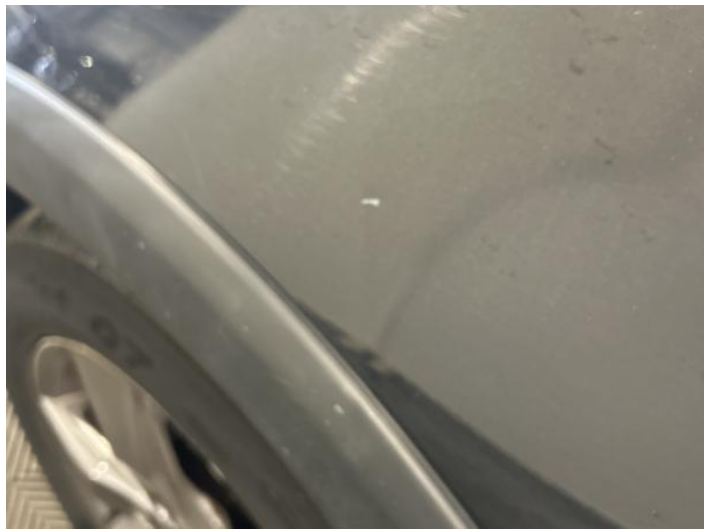
18: Wing nsf Chipped 1 To 5