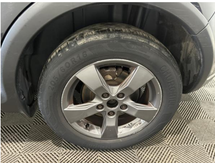
13: Wheel nsr Scratched Over 50mm