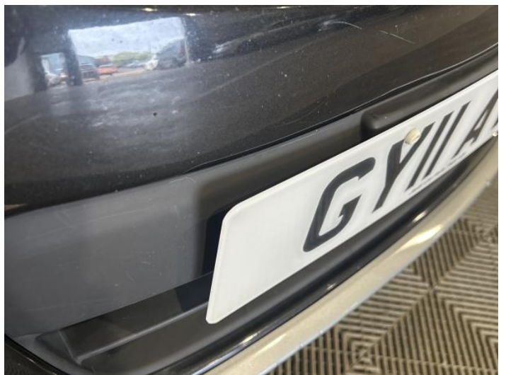
20: Bumper Front Scratched 25 to 100mm Thru Paint