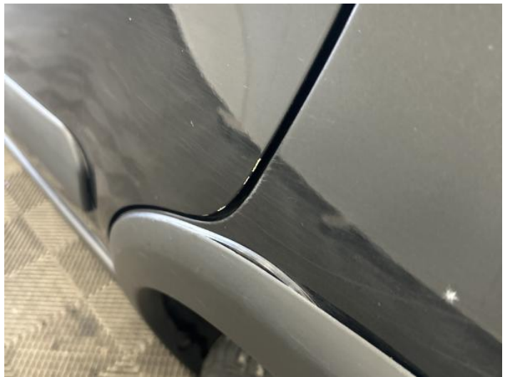
12: Door nsr Chipped Edge Chip