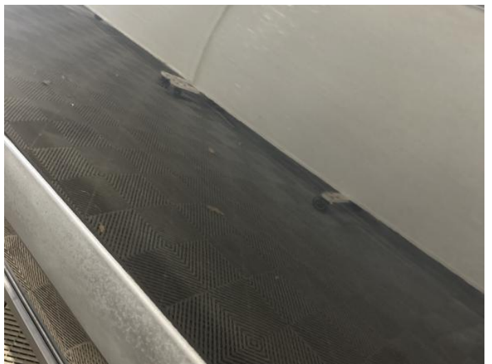
14: Door nsr Scratched Over 25mm Not Thru Paint