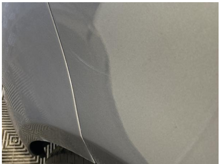
8: Wing nsf Scratched Over 25mm Not Thru Paint