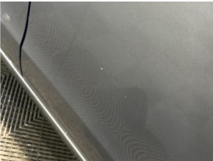
5: Door nsr Chipped 1 To 5