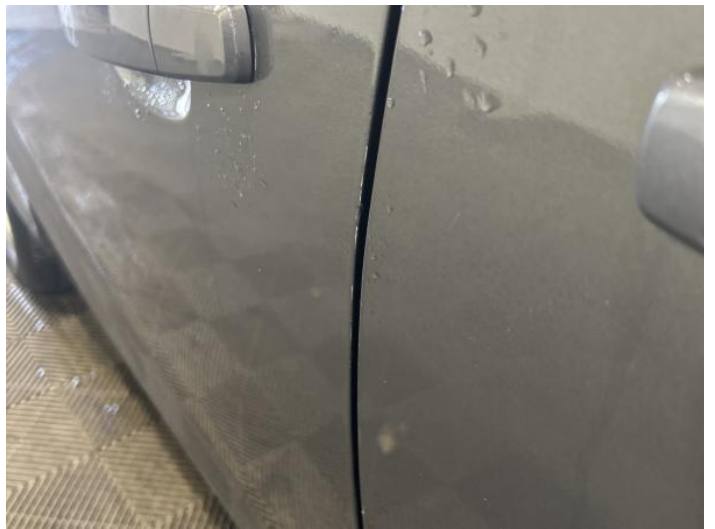
6: Door nsf Chipped Edge Chip