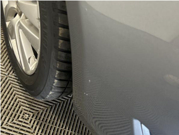
9: Bumper Front Chipped 1 To 5