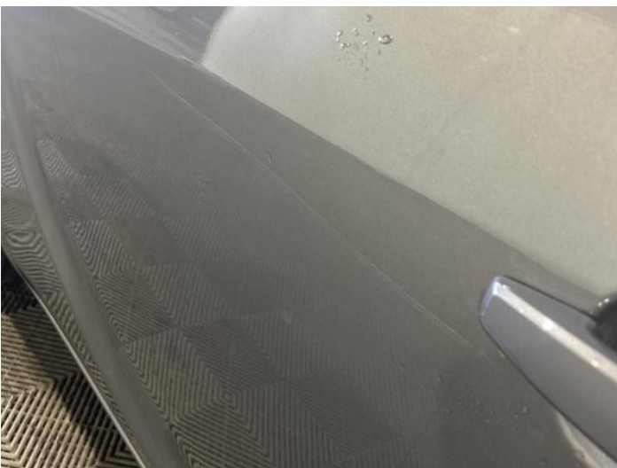
7: Door nsf Scratched Over 25mm Not Thru Paint