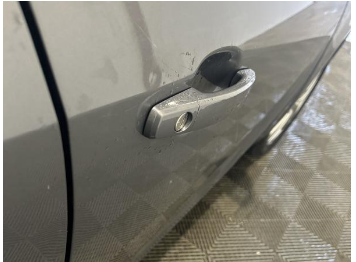
2: Door osf Dented 2 Or Less UpTo 10mm