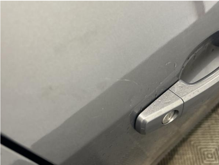
3: Door osf Scratched Over 25mm Not Thru Paint