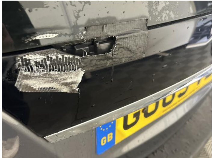
4: Tailgate Trim Panel Broken Replace