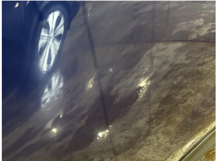
4: Door osr Chipped 1 To 5