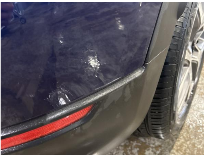
7: Bumper Rear Scratched 25 to 100mm Thru Paint