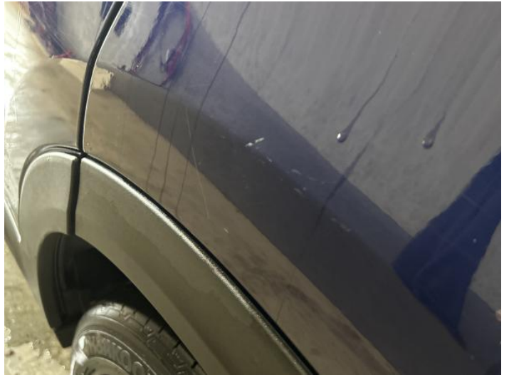
10: Qtr Panel nsr Scratched Over 25mm Not Thru Paint