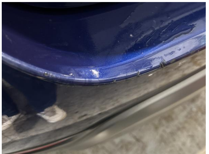
8: Bumper Rear Chipped Multiple Chips