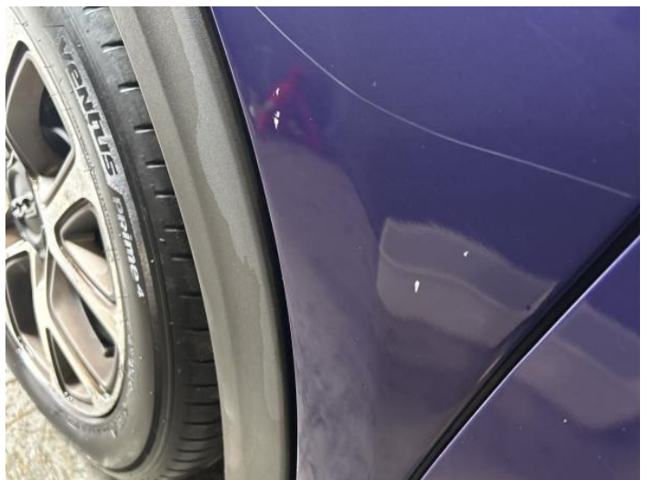
14: Wing nsf Chipped 1 To 5