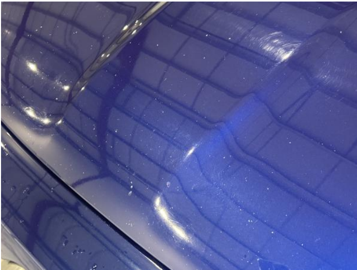
17: Bonnet Chipped Multiple Chips