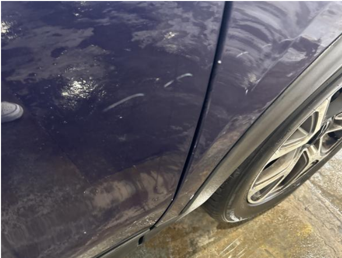
3: Door osf Scratched Over 25mm Thru Paint