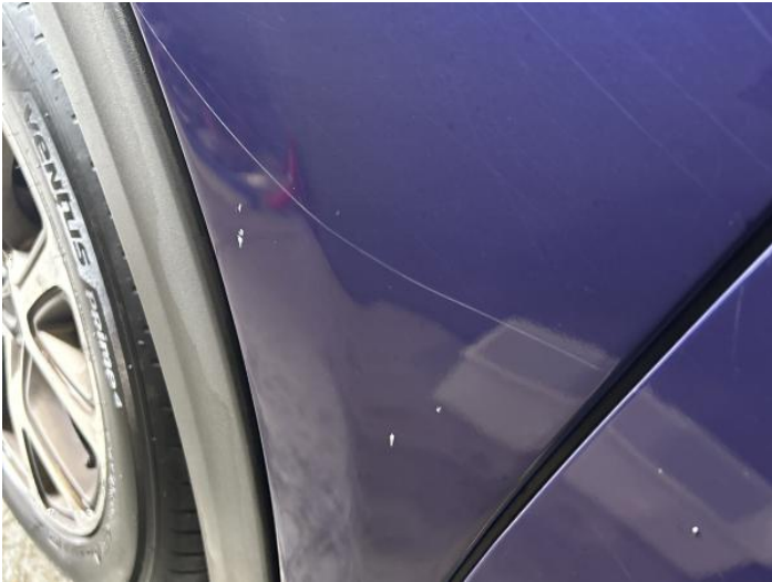
15: Wing nsf Scratched Over 25mm Not Thru Paint