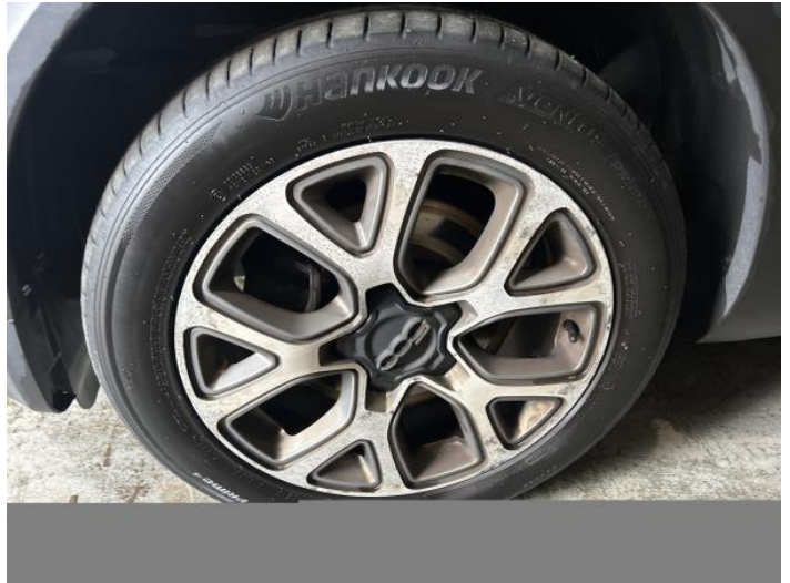
16: Wheel nsf Corroded Light