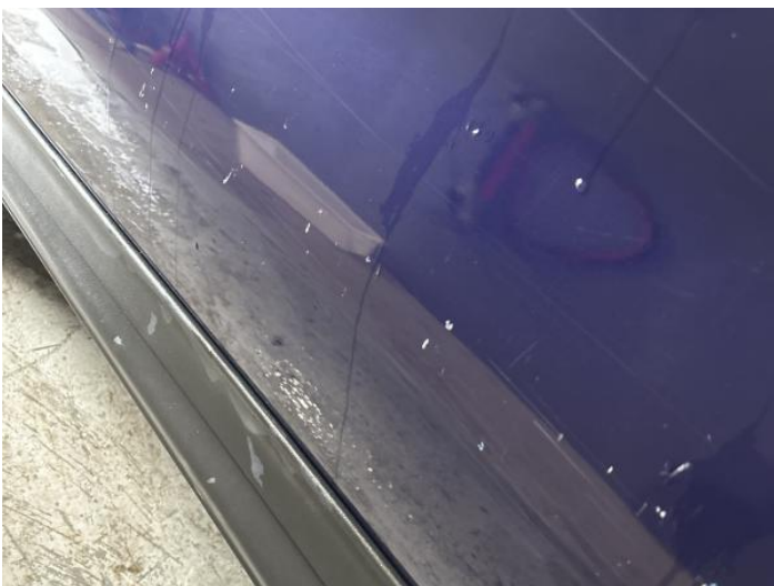
13: Door nsf Chipped Multiple Chips