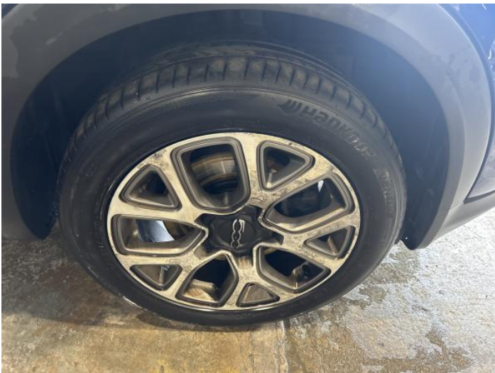
1: Wheel of Corroded Light