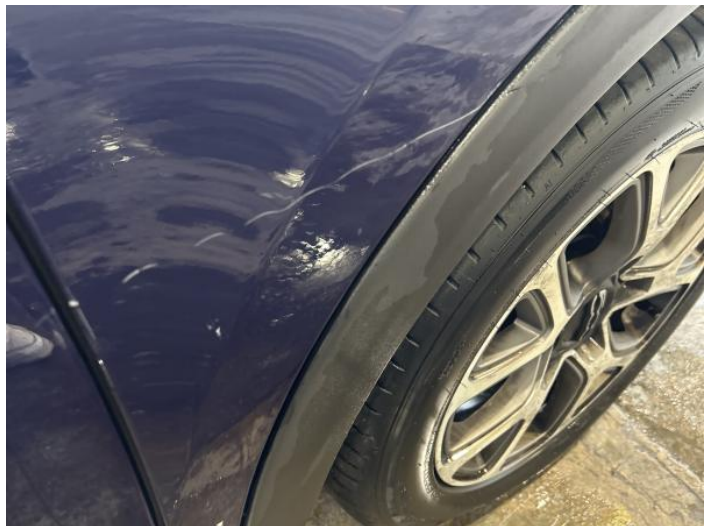
2: Wing of Scratched Over 25mm Thru Paint