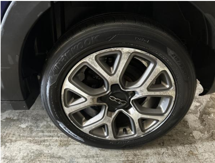
11: Wheel nsr Corroded Light