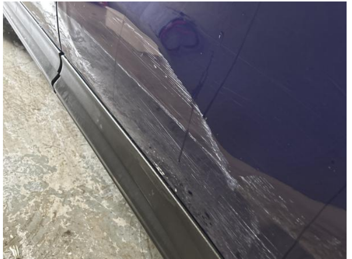
12: Door nsr Dented With Paint Damage