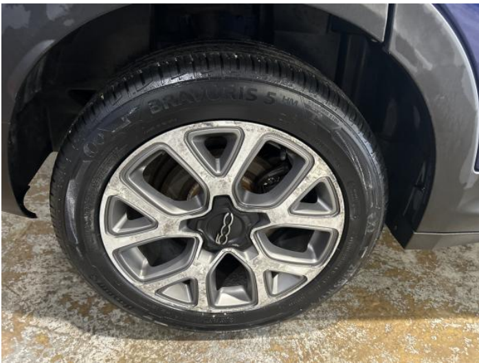
5: Wheel osr Corroded Light