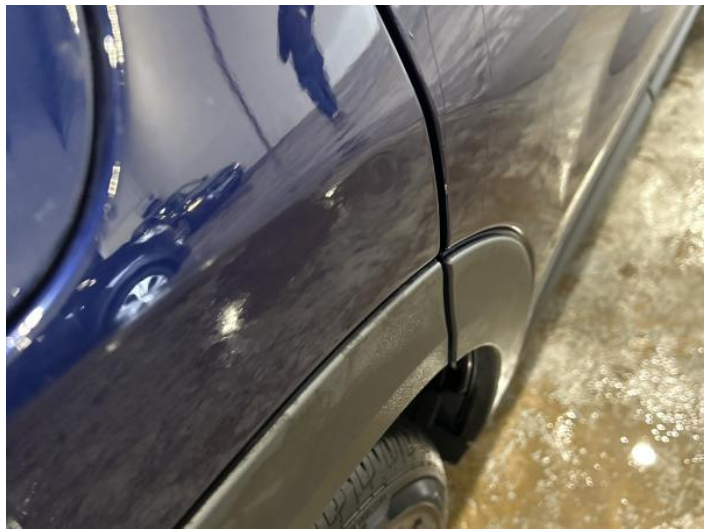
6: Qtr Panel osr Dented 2 Or Less UpTo 10mm