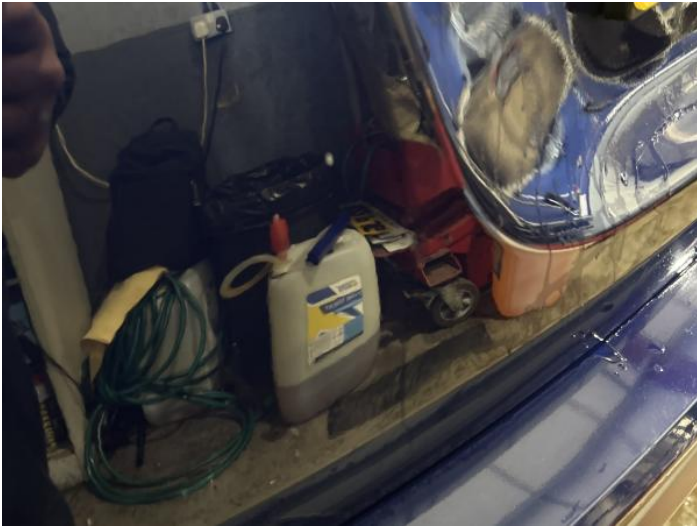
9: Tailgate Chipped 1 To 5