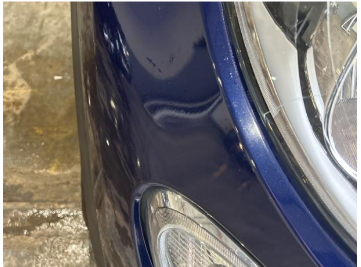
18: Bumper Front Poor Previous Repair Poor Paint