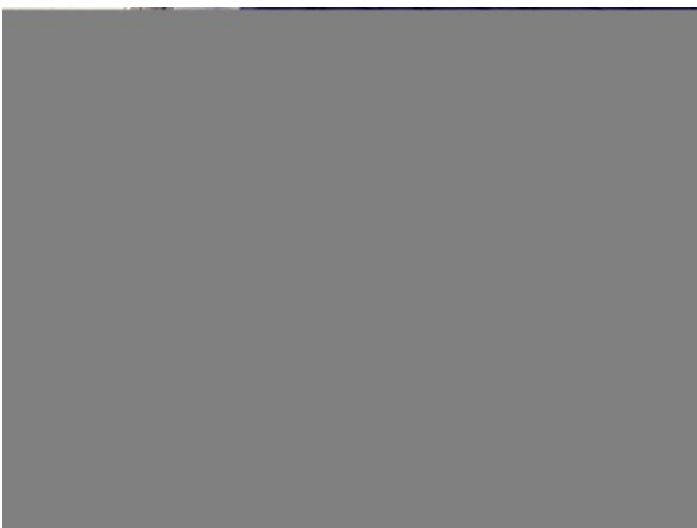
19: Roof Poor Previous Repair Paint Flake