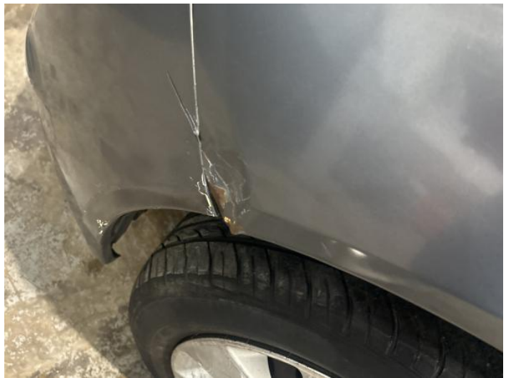
12: Wing nsf Dented With Paint Damage