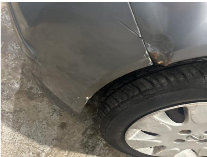
13: Bumper Front Scratched 25 to 100mm Thru Paint