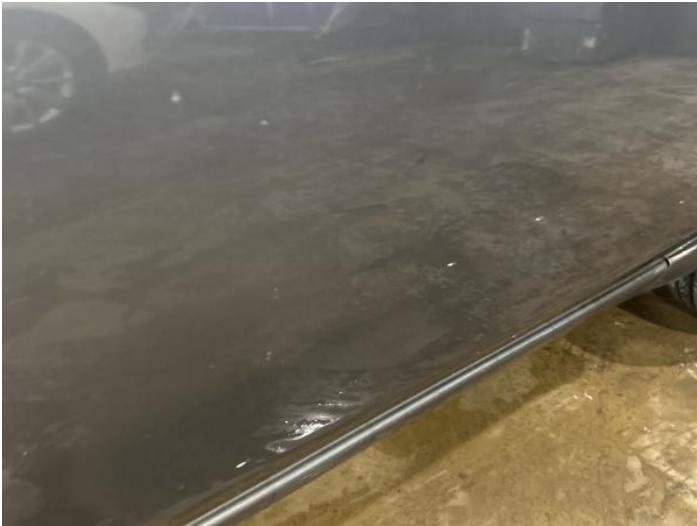
3: Door osf Chipped Multiple Chips