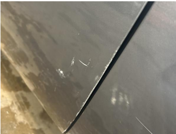
11: Door nsf Scratched Over 25mm Thru Paint