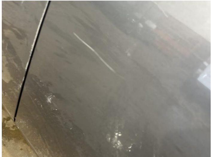
10: Qtr Panel nsr Scratched Over 25mm Thru Paint