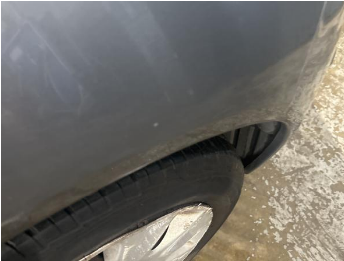
1: Wing osf Chipped 1 To 5