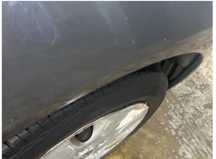
2: Wing osf Dented 2 Or Less UpTo 10mm