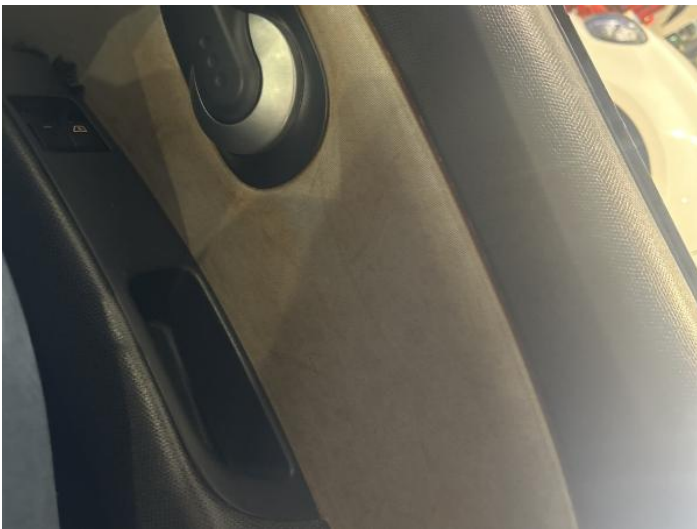
17: Door Pad osf Missing Replace