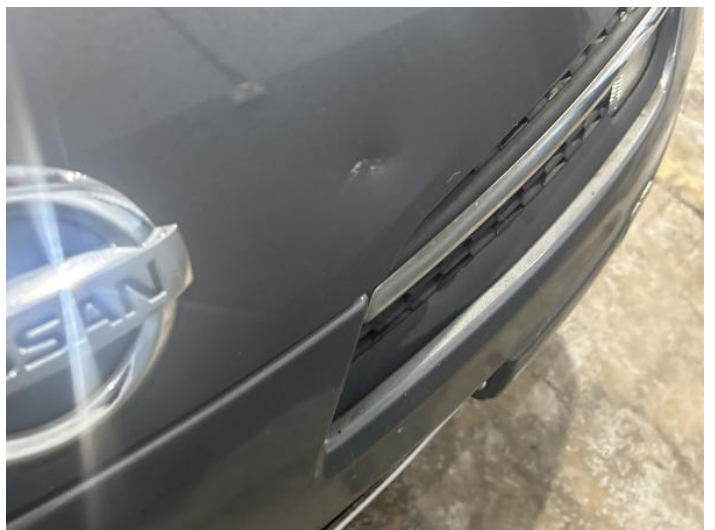
14: Bonnet Dented With Paint Damage