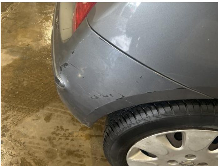
7: Bumper Rear Scratched Over 100mm Thru Paint