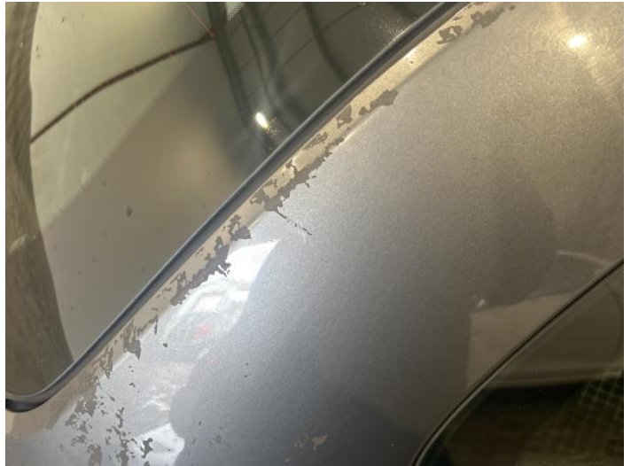
4: Other N/A N/A