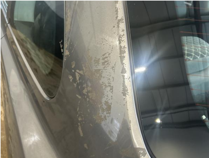
9: Other N/A N/A