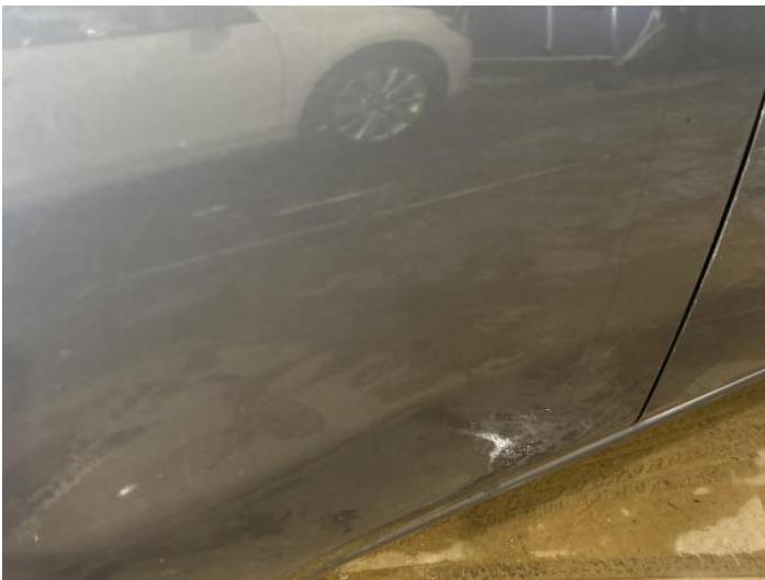
5: Qtr Panel osr Scratched Over 25mm Not Thru Paint