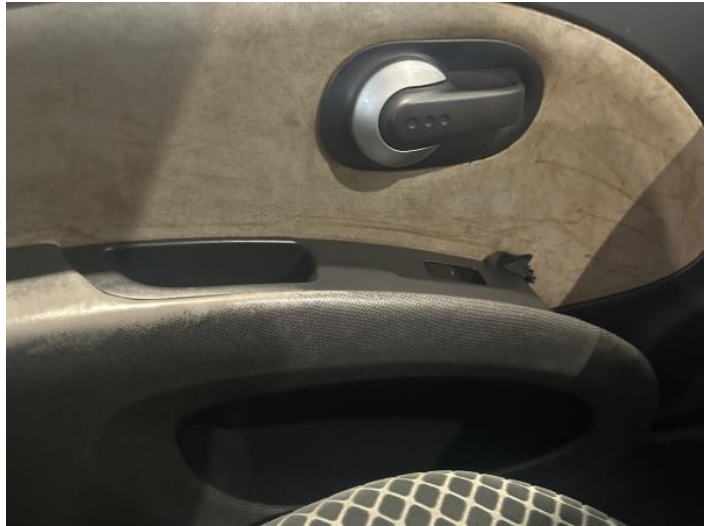
16: Door Pad nsf Missing Replace