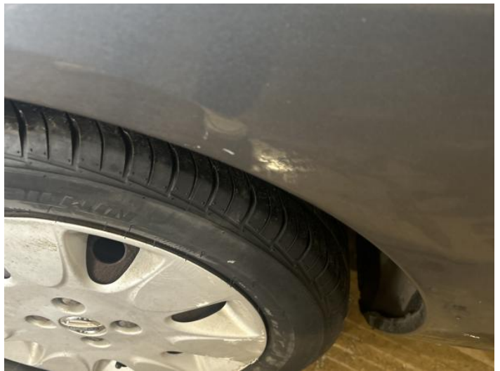
6: Qtr Panel osr Chipped 1 To 5