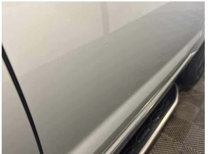
12: Door osf Dented Over 30mm