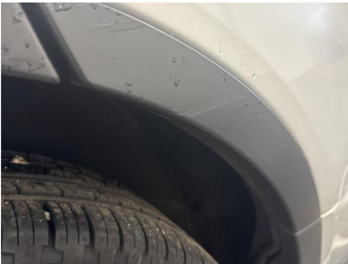
11: Door Moulding osr Scuffed (Unpainted) UpTo 100mm