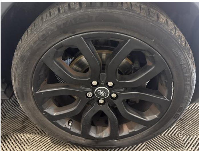
13: Wheel osf Scratched Over 50mm