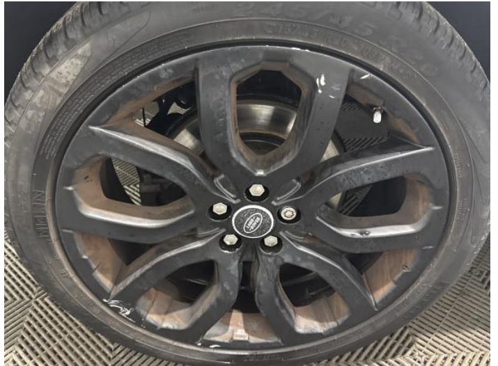
10: Wheel osr Scratched Over 50mm