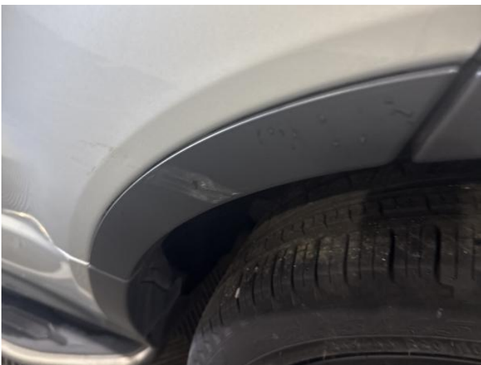
7: Door Moulding nsr Scuffed (Unpainted) Up To 100mm