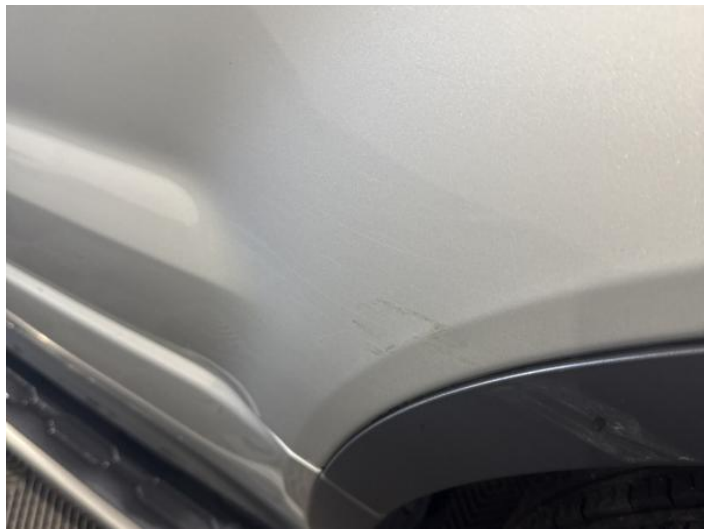
6: Door nsr Scratched Over 25mm Thru Paint