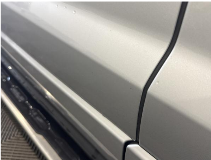
5: Door nsf Chipped 1 To 5