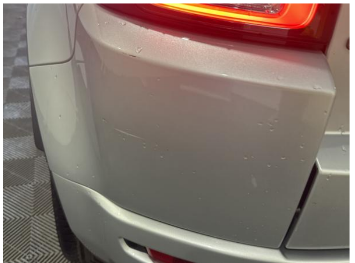
8: Bumper Rear Scratched 25 to 100mm Thru Paint