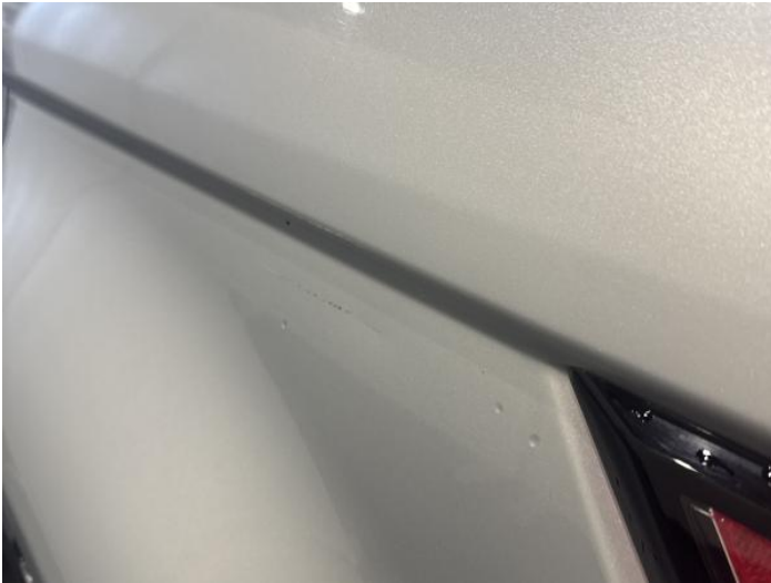
15: Qtr Panel osr Scratched Over 25mm Thru Paint