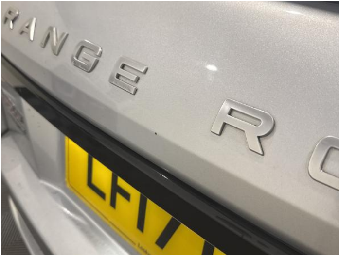
9: Tailgate Chipped 1 To 5