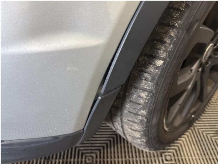
3: Bumper Front Moulding Scuffed (Unpainted) Over 100mm