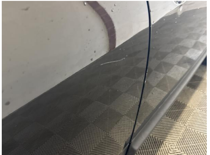
12: Door nsr Scratched Over 25mm Thru Paint