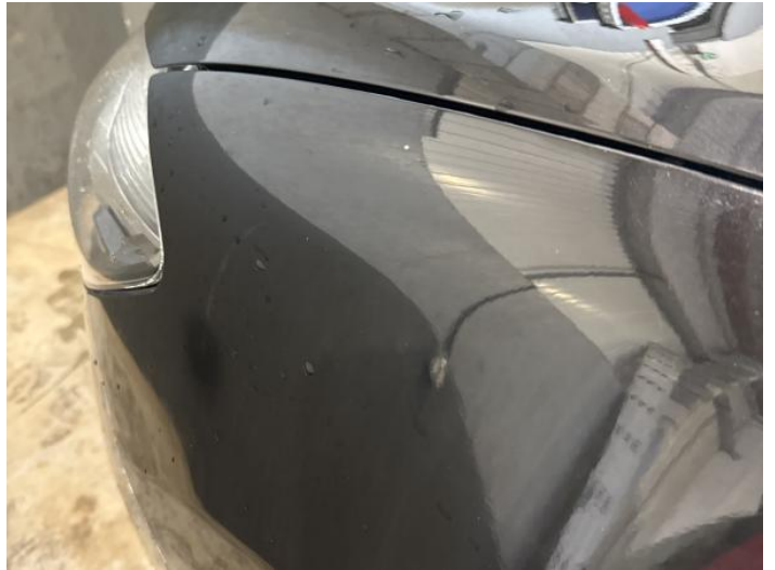
4: Wing nsf Chipped 1 To 5