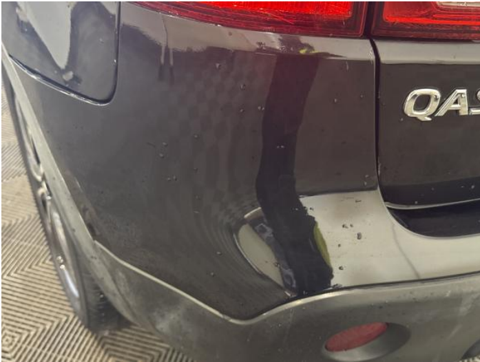
9: Bumper Rear Dented With Paint Damage