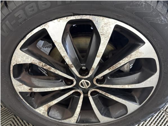
15: Wheel osf Scratched Over 50mm