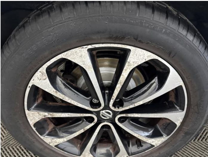
11: Wheel osr Scratched Over 50mm