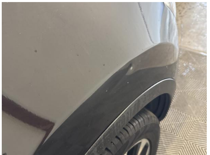
14: Wing osf Dented Over 30mm