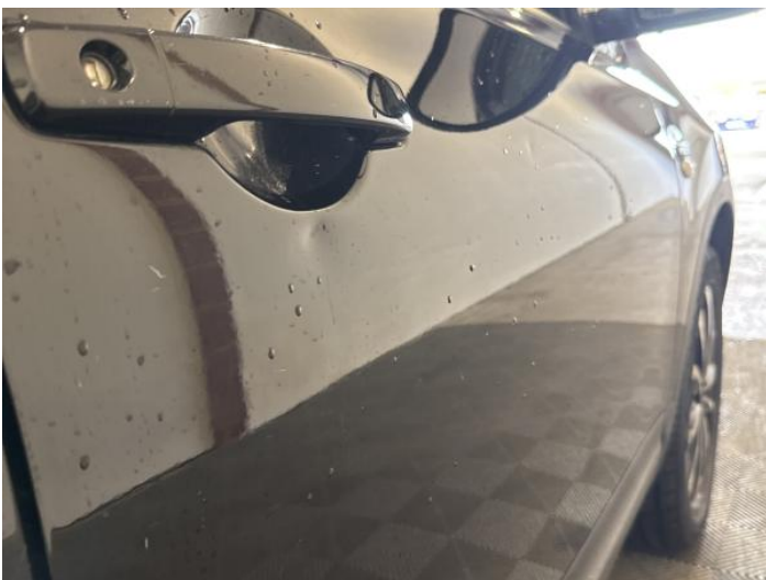
13: Door osf Dented Over 30mm