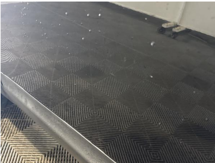
5: Door nsf Scratched Over 25mm Thru Paint