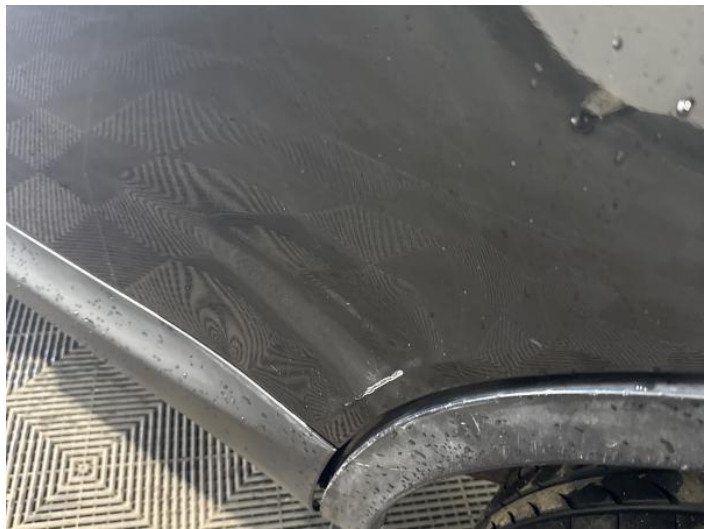
6: Door nsr Dented With Paint Damage