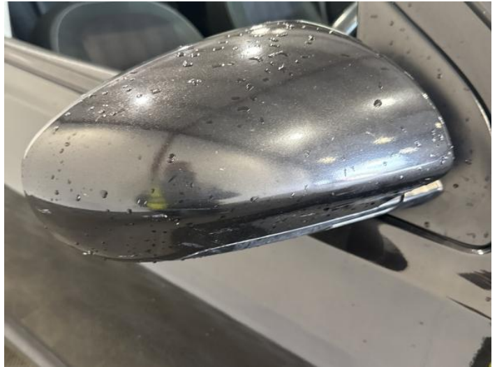
16: Door Mirror Assy osf Scratched (Painted) Over 25mm Thru Paint