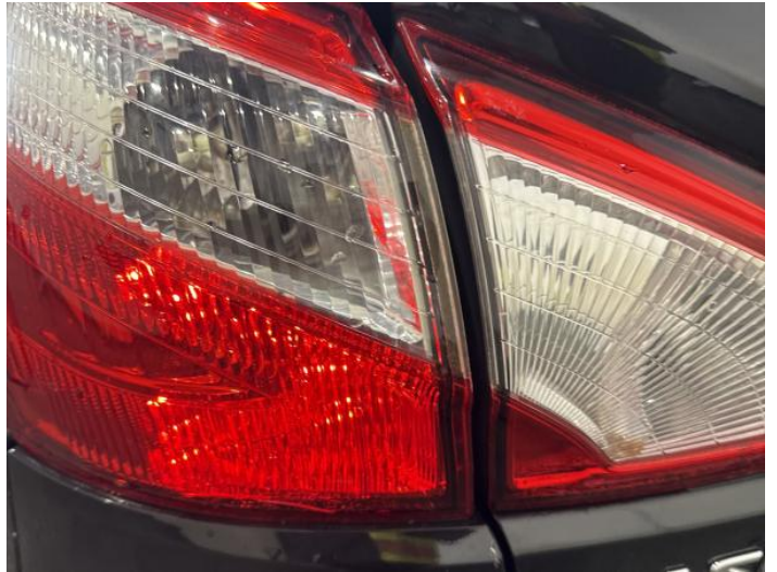
10: Lamp nsr Broken Replace