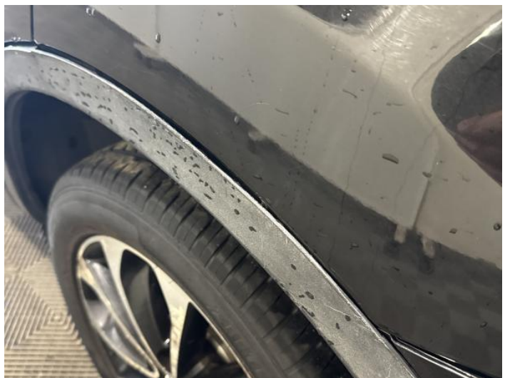
8: Qtr Panel nsr Scratched Over 25mm Thru Paint