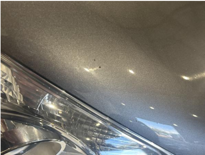
11: Bonnet Chipped 1 To 5