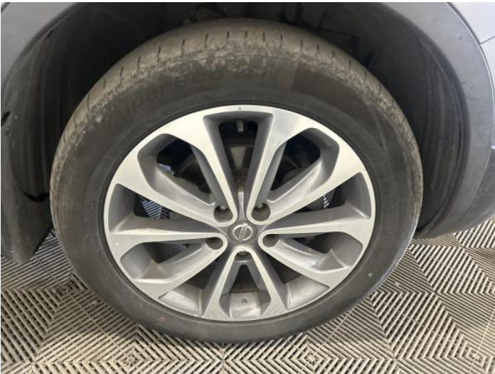
1: Wheel of Corroded Light