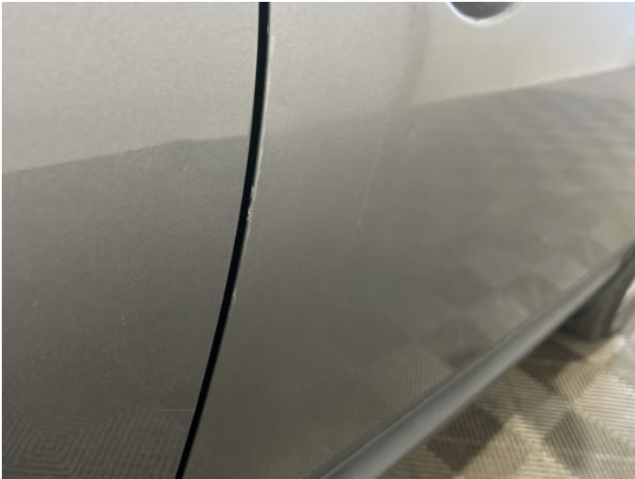
3: Door osf Chipped Edge Chip