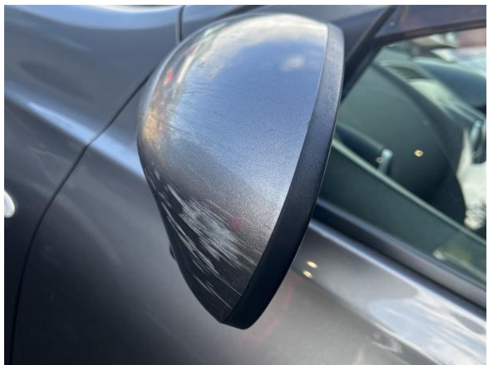
14: Door Mirror Assy nsf Scratched (Painted) Over 25mm Thru Paint