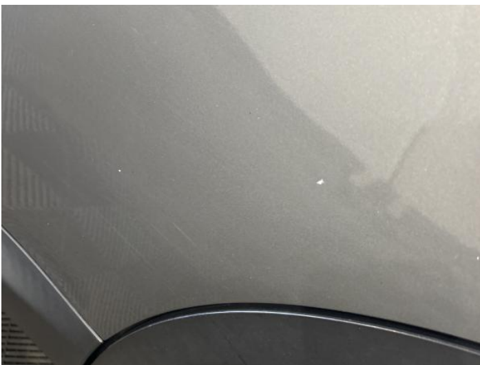
7: Door nsr Chipped 1 To 5