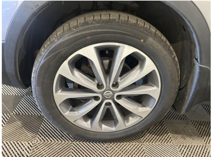
10: Wheel nsf Corroded Light