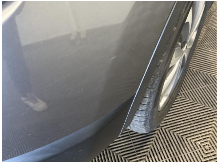
12: Bumper Front Scratched Over 25mm Not Thru Paint