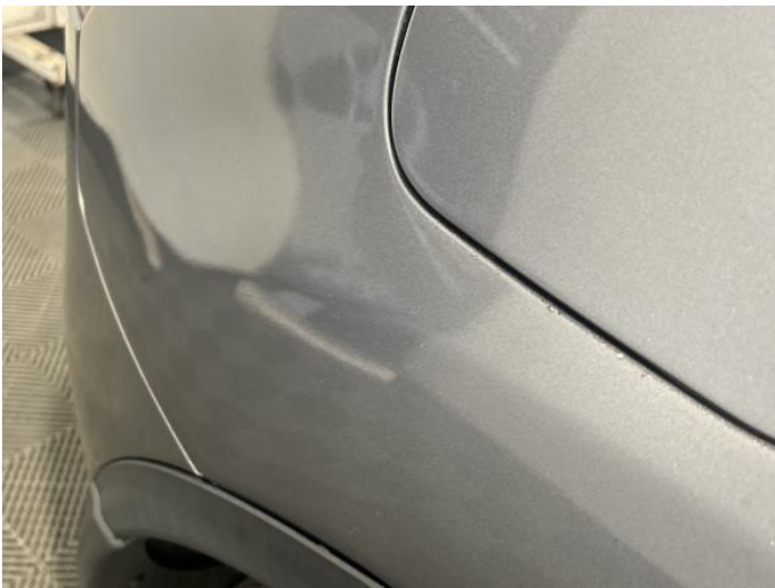
5: Qtr Panel osr Poor Previous Repair Poor Paint