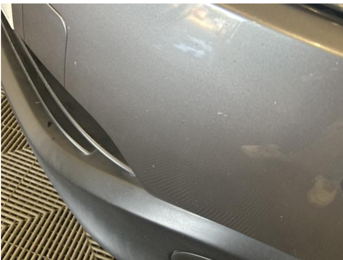
13: Bumper Front Chipped Multiple Chips