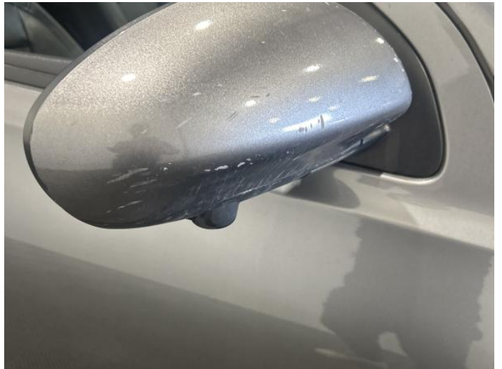
2: Door Mirror Assy of Scratched (Painted) Over 25mm Thru Paint