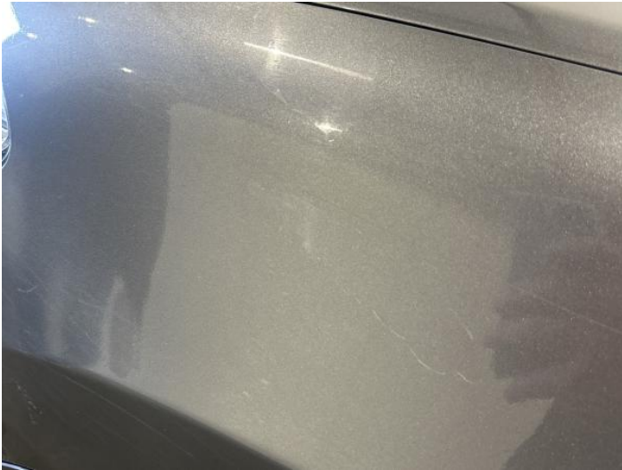
9: Wing nsf Poor Previous Repair Paint Flake