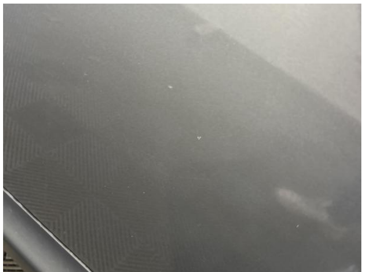
8: Door nsf Chipped 1 To 5