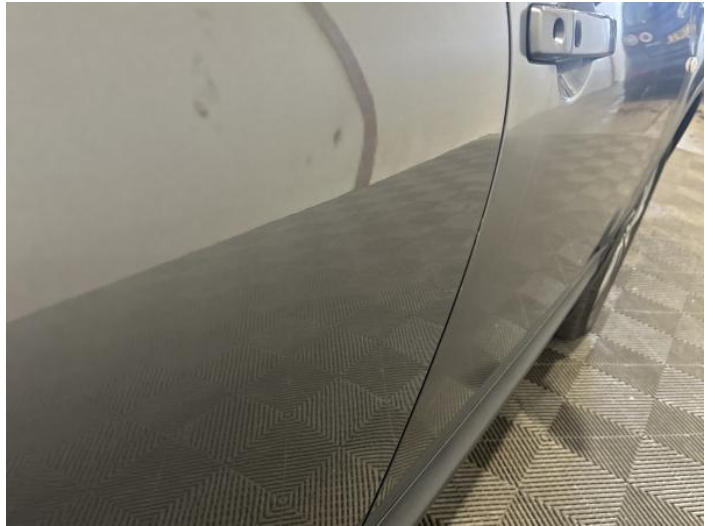
4: Door osr Dented Between 10mm + 30mm