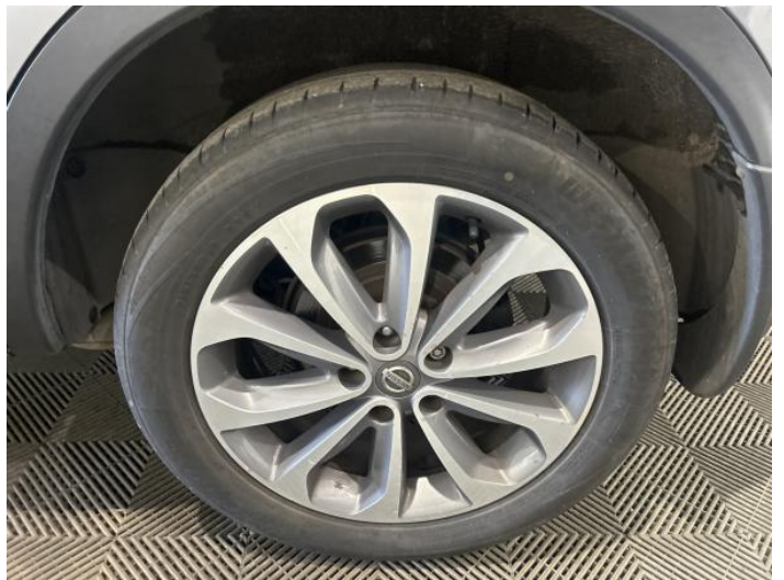
6: Wheel nsr Corroded Light