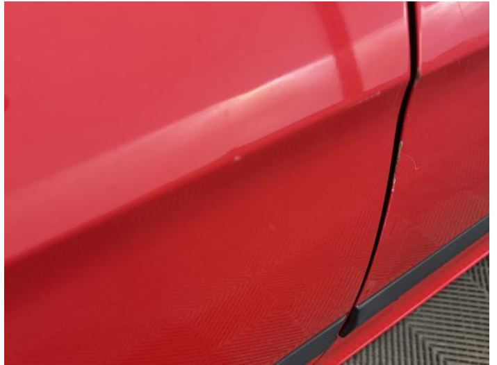
4: Door osr Chipped 1 To 5