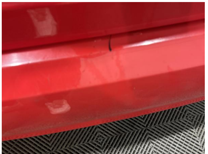
8: Bumper Rear Scratched 25 to 100mm Thru Paint