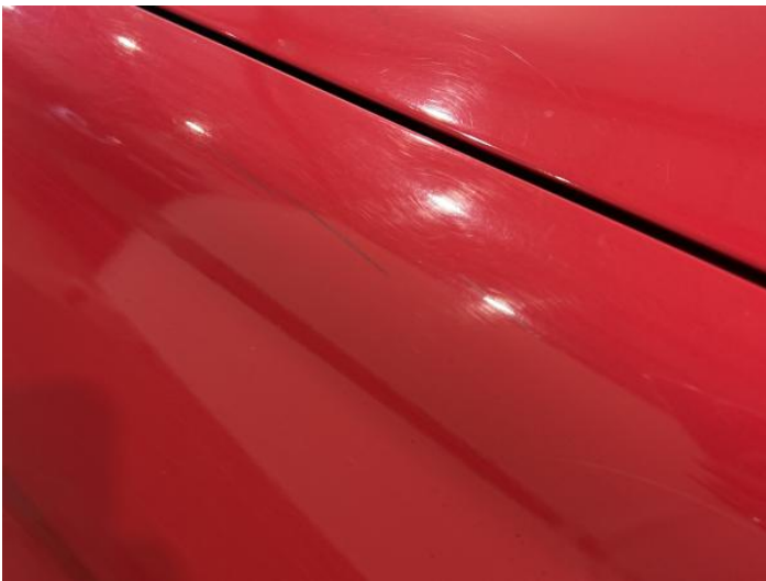
11: Wing nsf Scratched Over 25mm Not Thru Paint