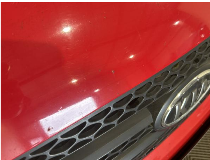
13: Bonnet Chipped Multiple Chips