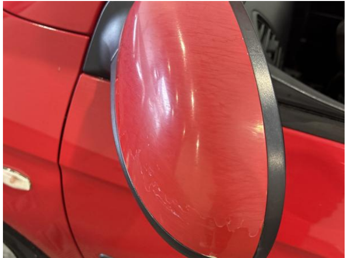
10: Door Mirror Assy nsf Scratched (Painted) Over 25mm Thru Paint