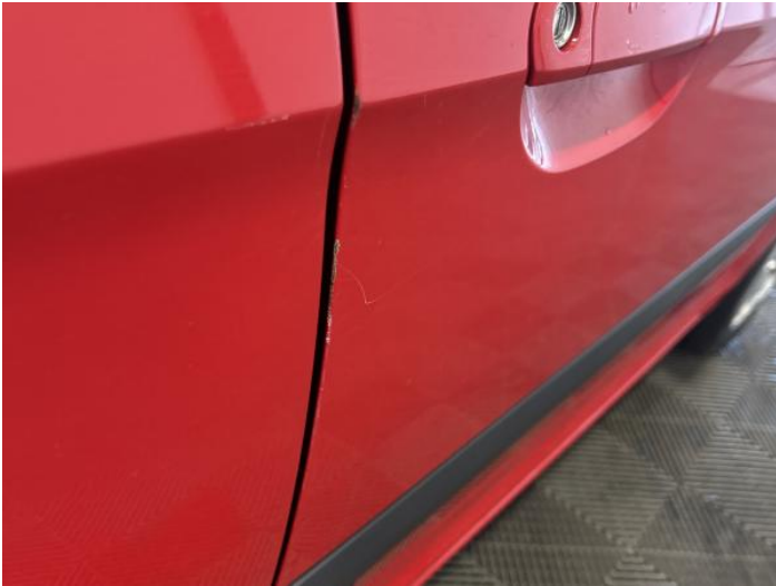
3: Door osf Chipped Edge Chip