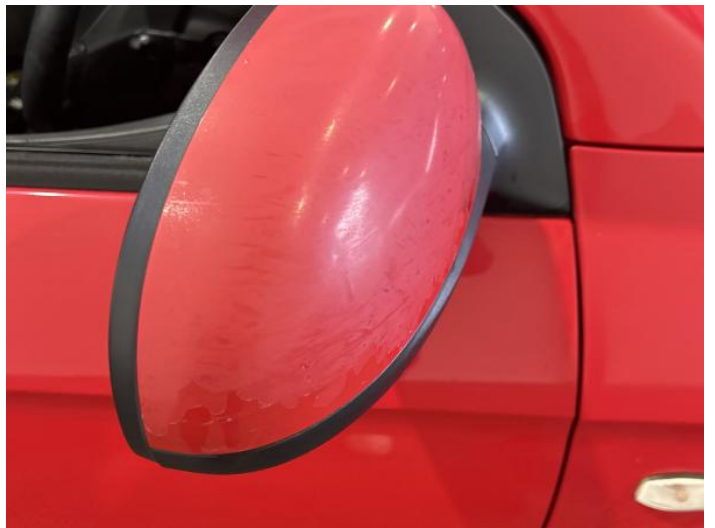
2: Door Mirror Assy osf Scratched (Painted) Over 25mm Thru Paint