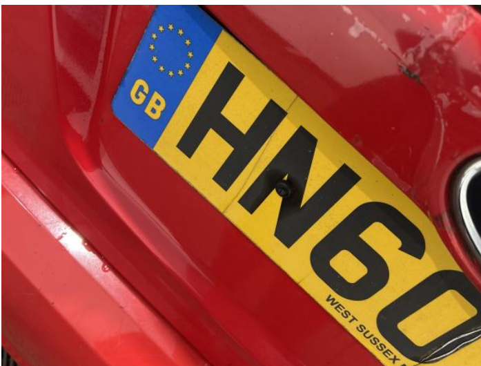
7: Tailgate Poor Previous Repair Paint Flake