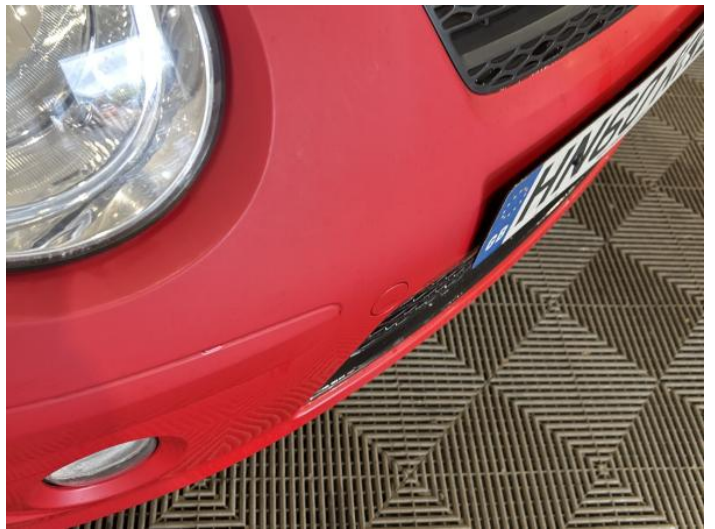
12: Bumper Front Scratched Over 25mm Not Thru Paint