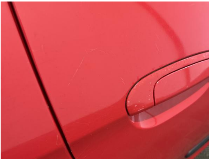
5: Door osr Scratched Over 25mm Not Thru Paint