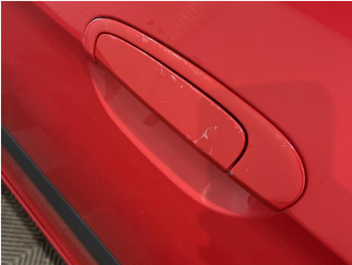
9: Other N/A N/A