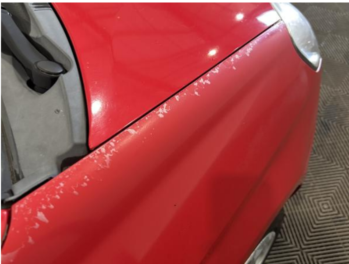
1: Wing osf Poor Previous Repair Paint Flake