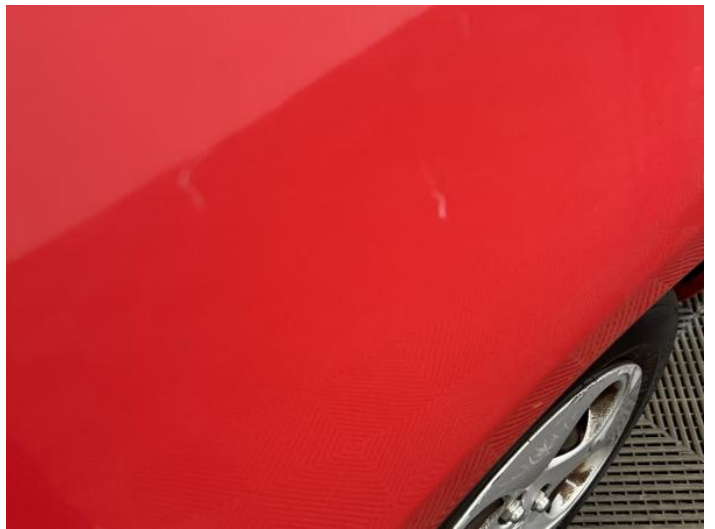
6: Qtr Panel osr Scratched UpTo 25mm Thru Paint