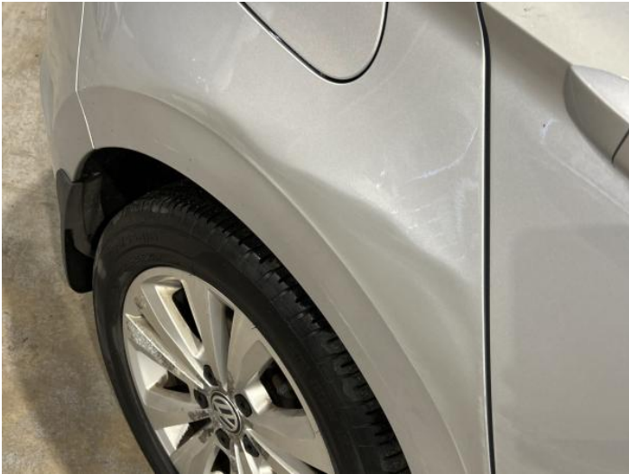
3: Qtr Panel osr Dented With Paint Damage