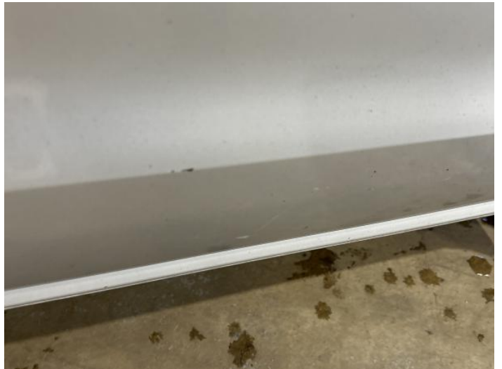
2: Door osf Chipped 1 To 5