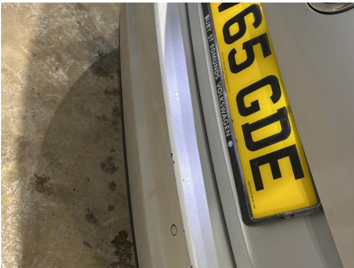
5: Bumper Rear Scratched Over 100mm Thru Paint