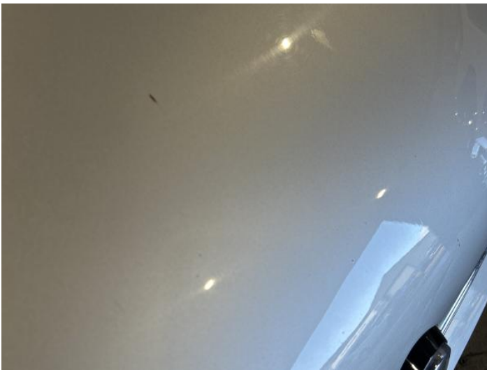
11: Bonnet Chipped 1 To 5