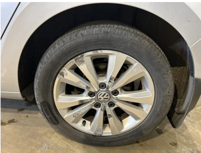
7: Wheel nsr Corroded Light