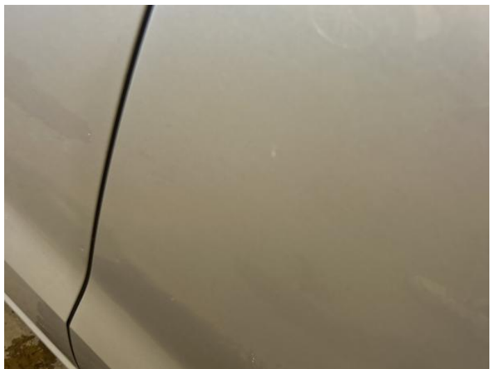
8: Door nsr Chipped 1 To 5