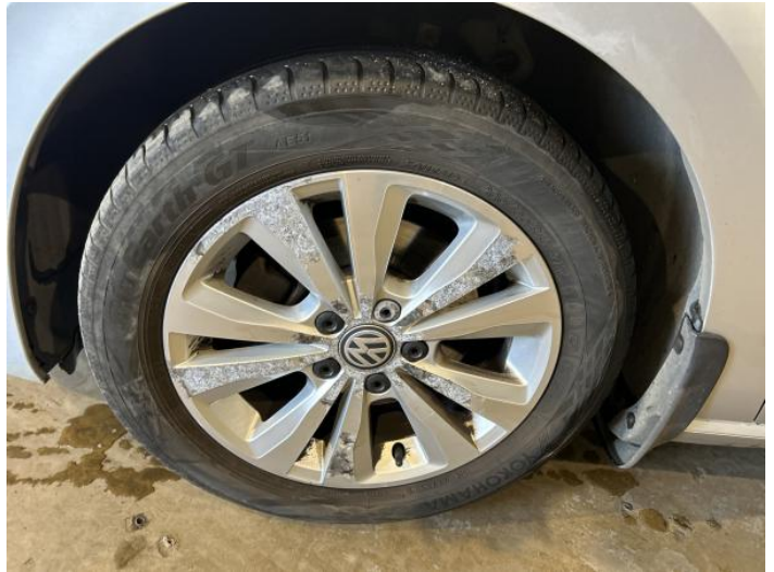
10: Wheel nsf Corroded Light