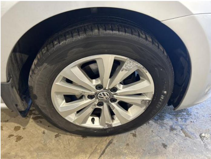
1: Wheel osf Corroded Light