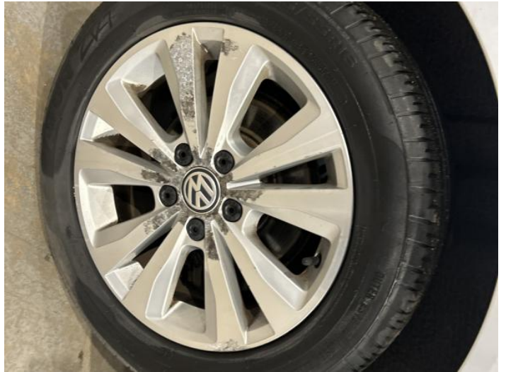
4: Wheel osr Corroded Light