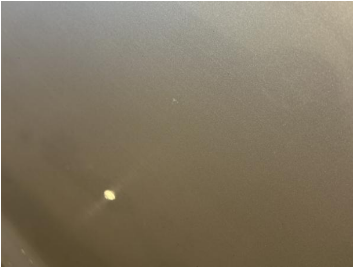
9: Door nsf Chipped 1 To 5