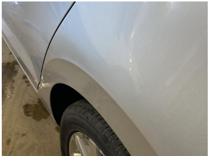
6: Qtr Panel nsr Dented Over 30mm