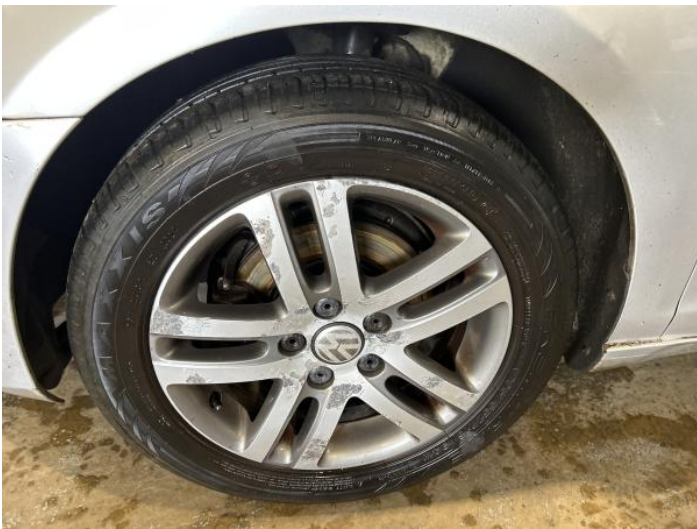
17: Wheel nsf Corroded Light