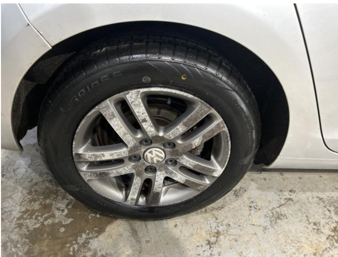
7: Wheel osr Corroded Light