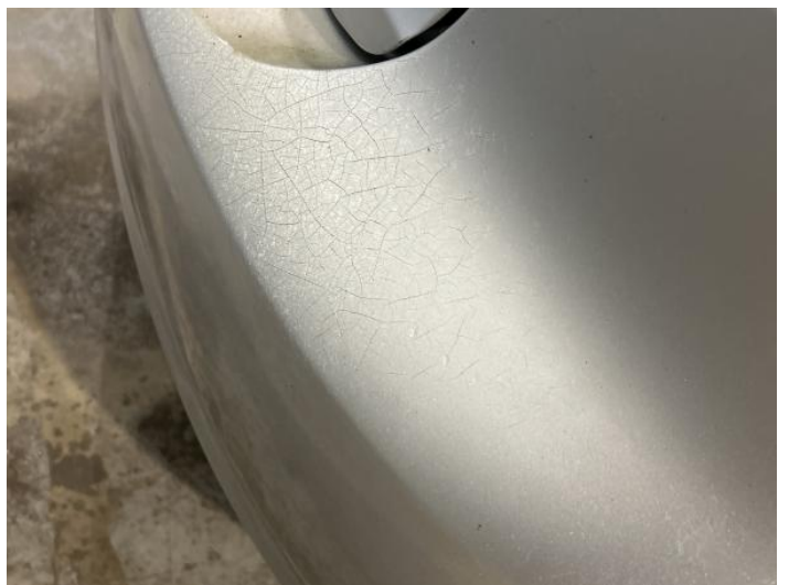
8: Bumper Rear Poor Previous Repair Paint Flake