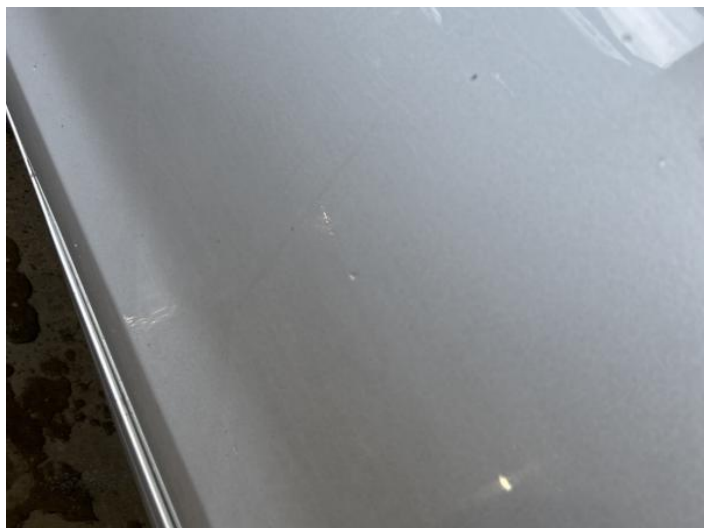
14: Door nsf Scratched Over 25mm Not Thru Paint