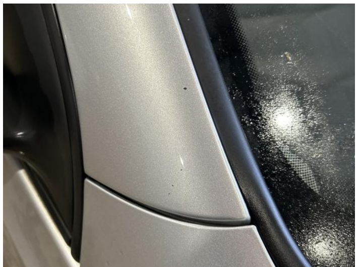
20: A Post os Chipped 1 To 5