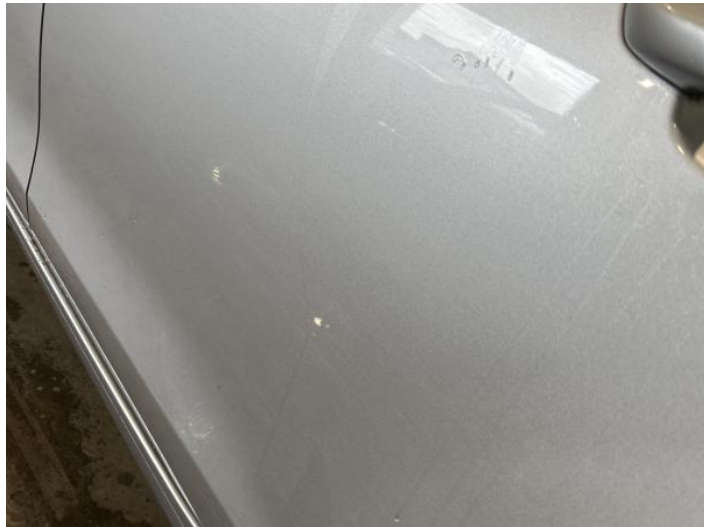
12: Door nsr Scratched Over 25mm Not Thru Paint