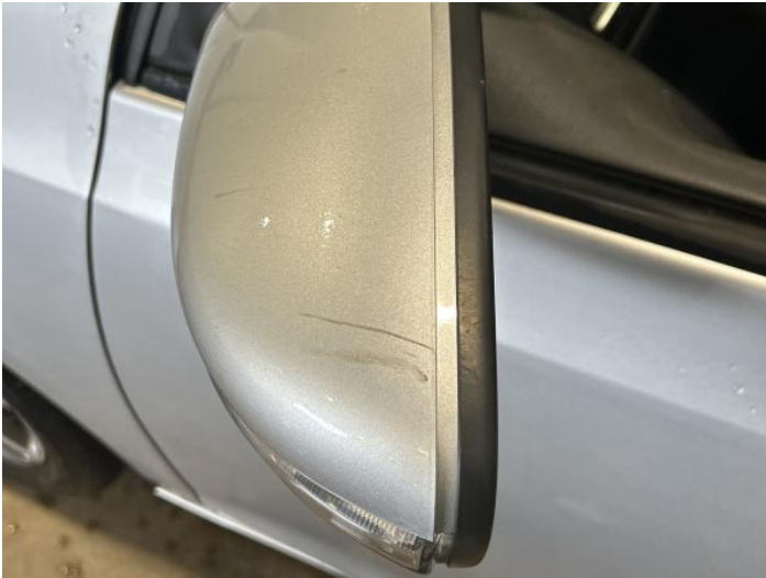
15: Door Mirror Assy nsf Scratched (Painted) Over 25mm Not Thru Paint