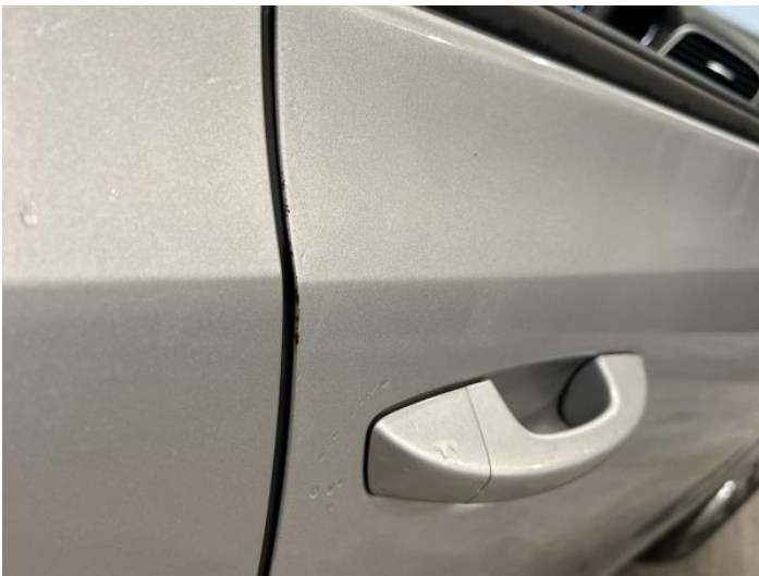
5: Door osf Chipped Edge Chip