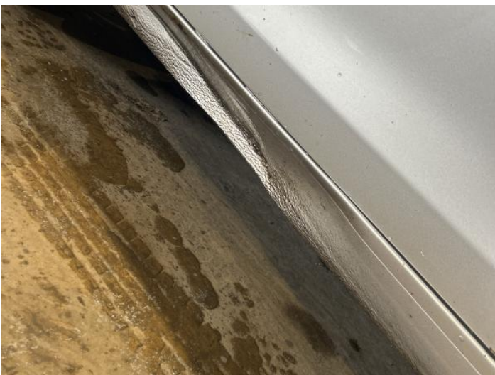
13: Sill ns Dented Over 30% Of Panel