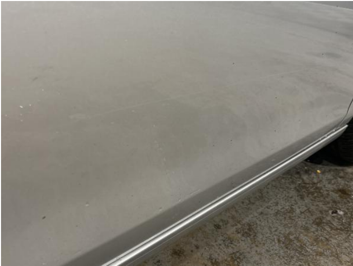
3: Door osf Scratched Over 25mm Not Thru Paint