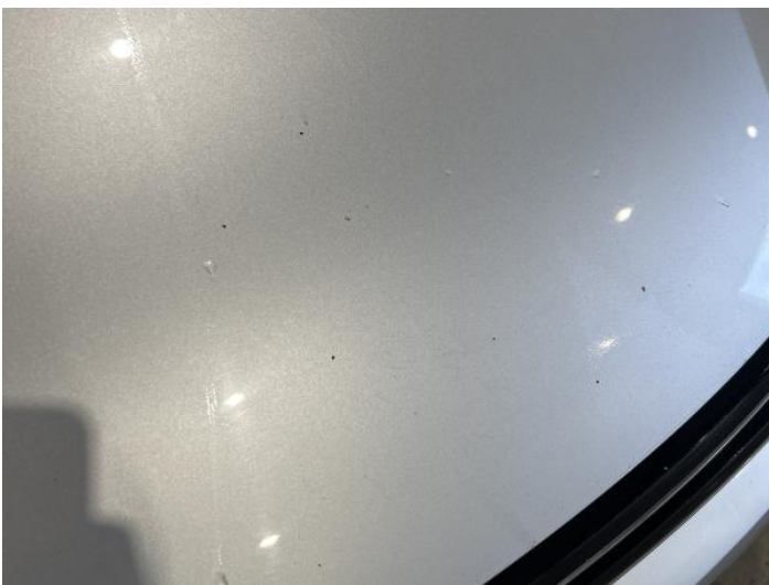
19: Bonnet Chipped Multiple Chips