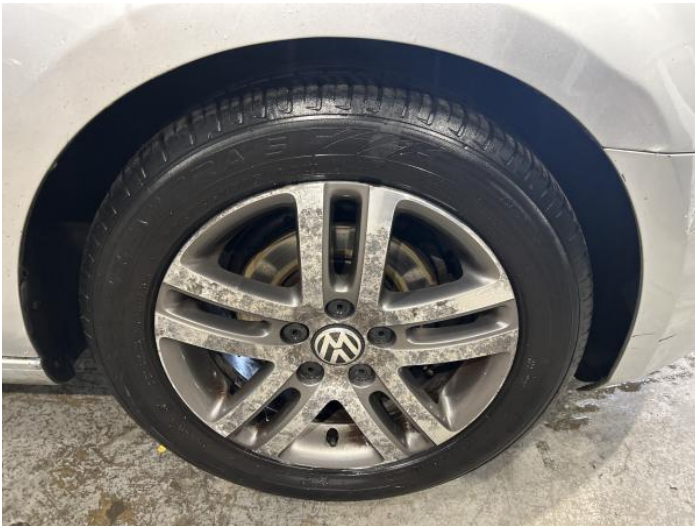
1: Wheel osf Corroded Light