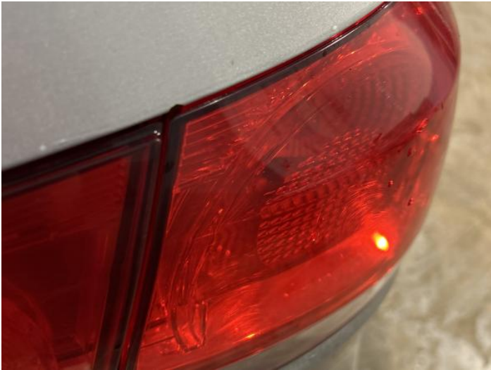
9: Tailgate Chipped 1 To 5