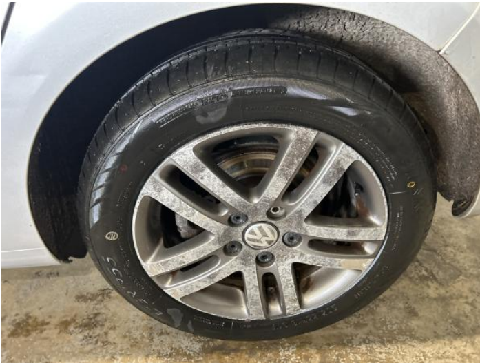
11: Wheel nsr Corroded Light