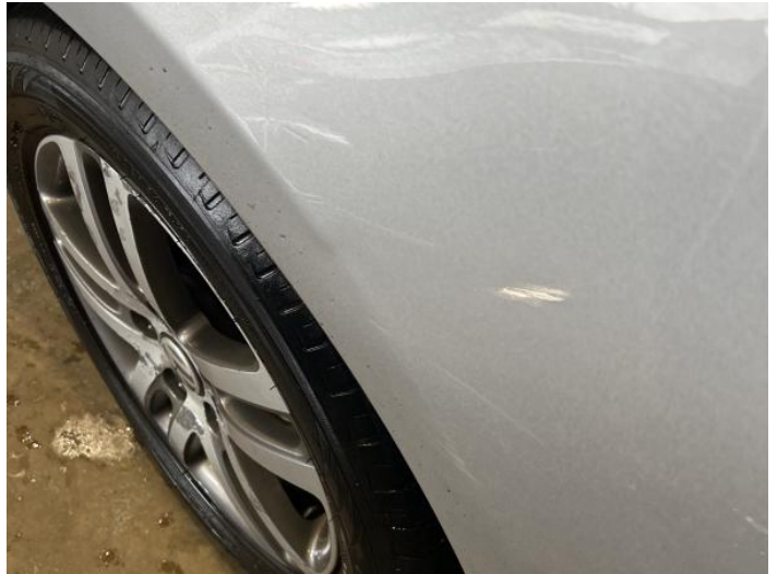
16: Wing nsf Dented Between 10mm + 30mm