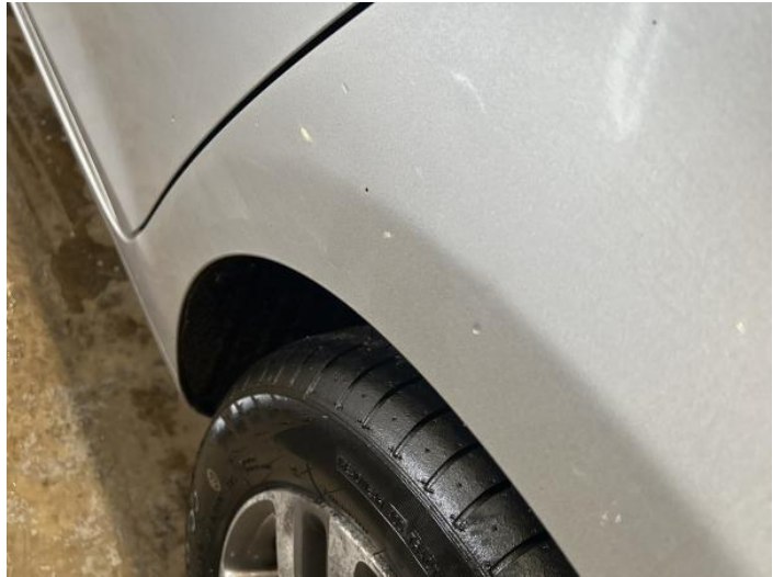
10: Qtr Panel nsr Dented Over 30mm