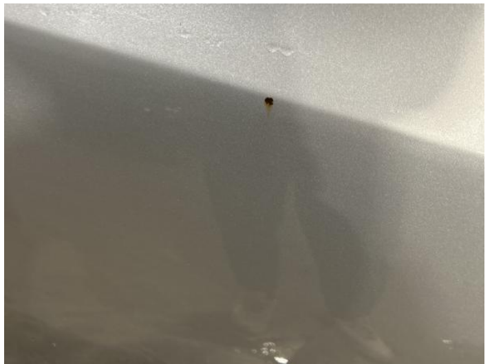
6: Door osr Chipped 1 To 5