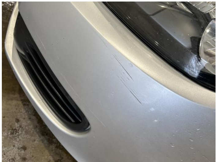
18: Bumper Front Scratched Over 100mm Thru Paint