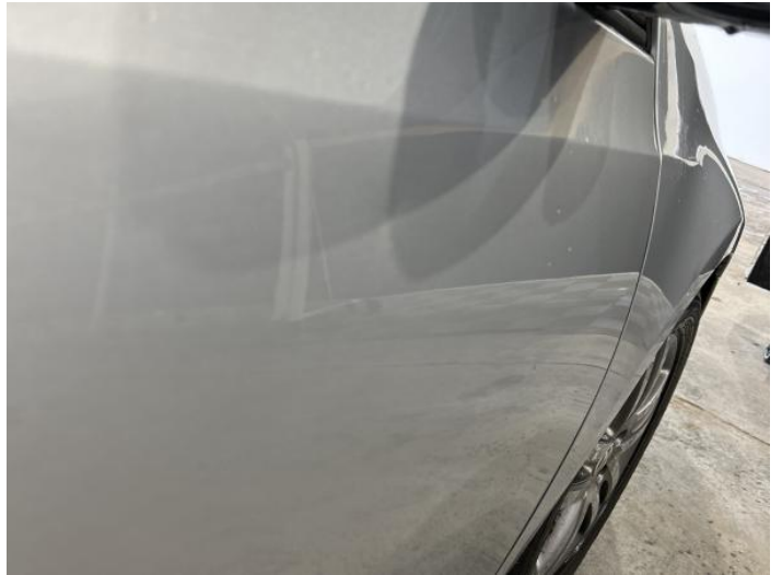
4: Door osf Dented 2 Or Less Up To 10mm