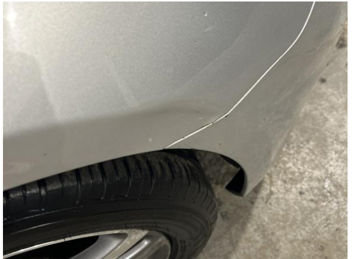
2: Wing osf Dented Over 30mm