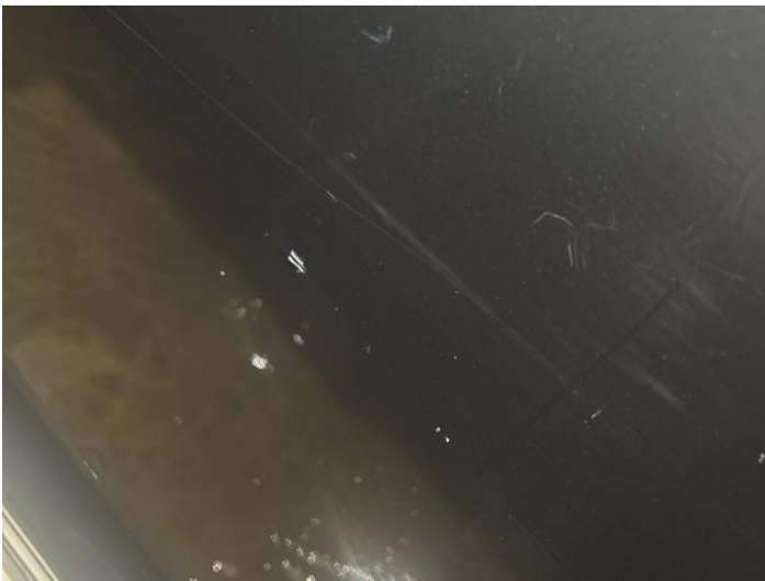
5: Door osr Chipped 1 To 5