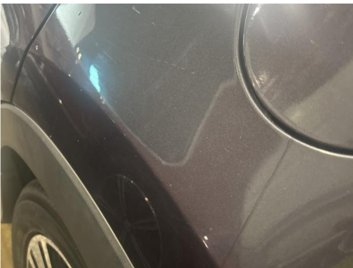
13: Qtr Panel nsr Scratched Over 25mm Not Thru Paint