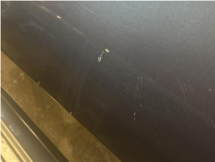
15: Door nsf Chipped 1 To 5