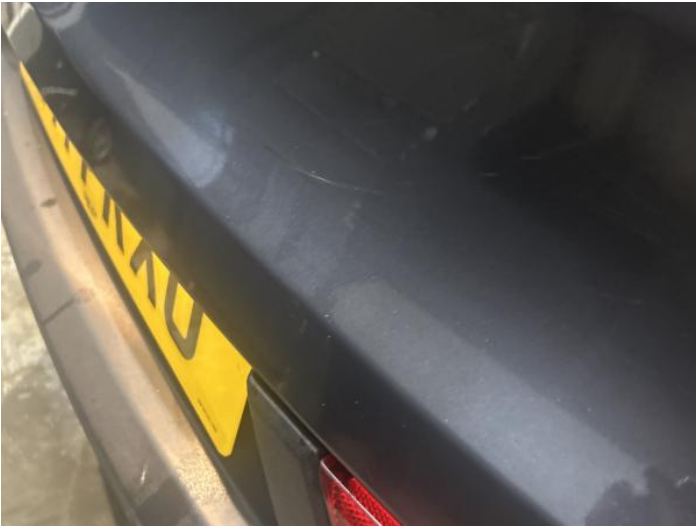
9: Tailgate Scratched Over 25mm Not Thru Paint