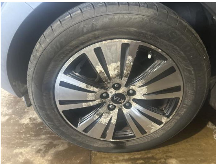
19: Wheel nsf Corroded Light