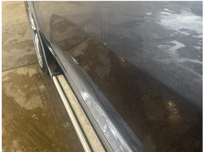
24: Door nsf Dented 2 Or Less UpTo 10mm