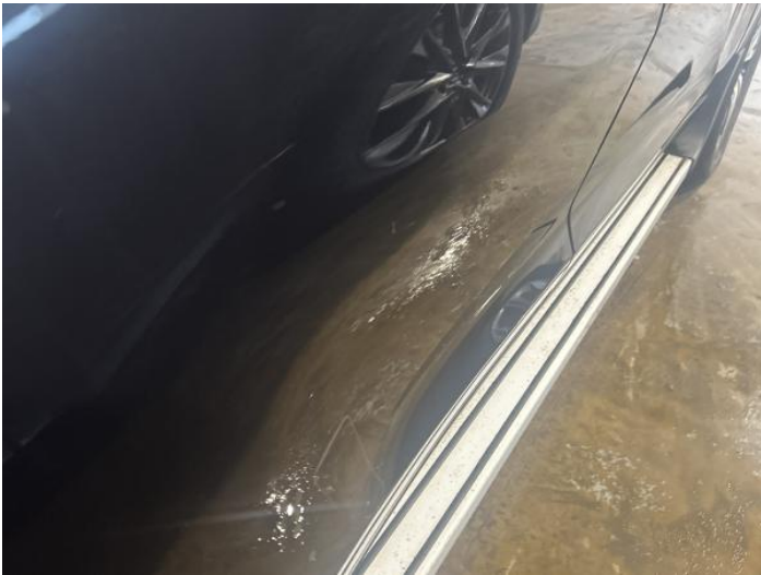
23: Door osr Dented 2 Or Less UpTo 10mm