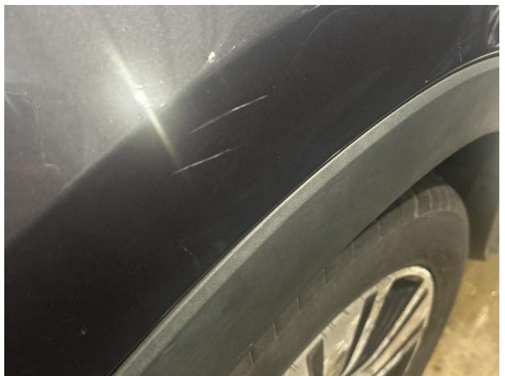
8: Qtr Panel osr Scratched Over 25mm Not Thru Paint