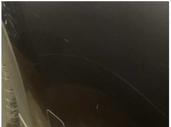
6: Door osr Scratched Over 25mm Not Thru Paint