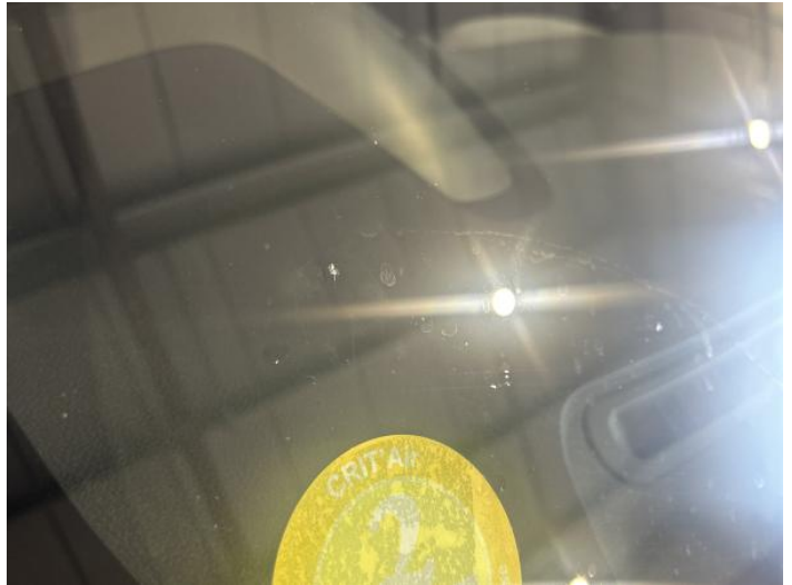
22: Screen Front Chipped UpTo 10mm