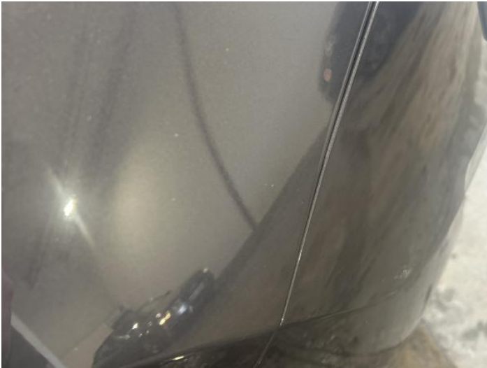
3: Wing osf Chipped 1 To 5