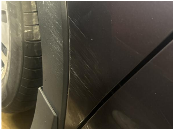
18: Wing nsf Scratched Over 25mm Thru Paint