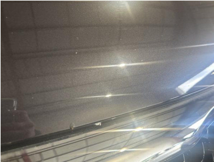
21: Bonnet Chipped 1 To 5