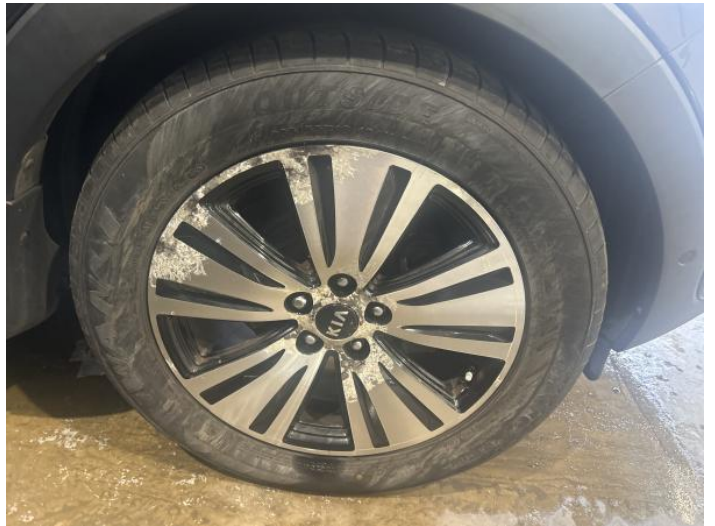
2: Wheel of Corroded Light