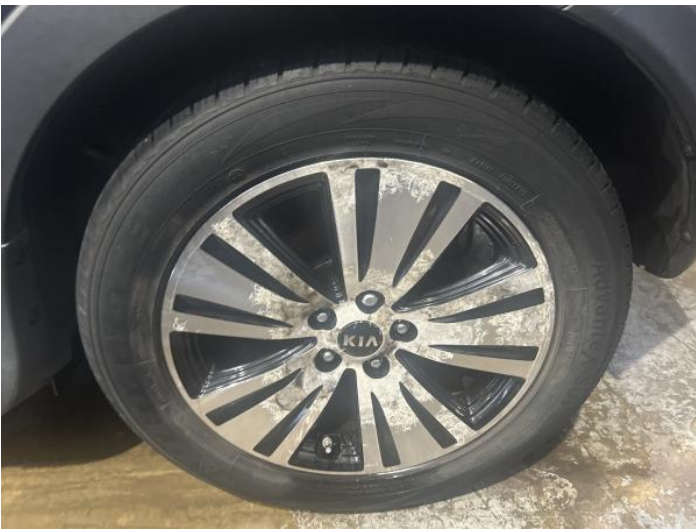
11: Wheel nsr Corroded Light