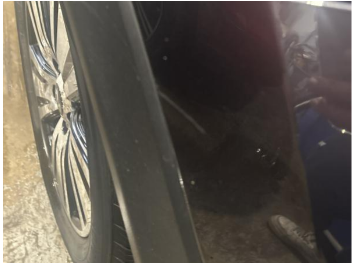
10: Bumper Rear Scratched Up To 25mm Thru Paint