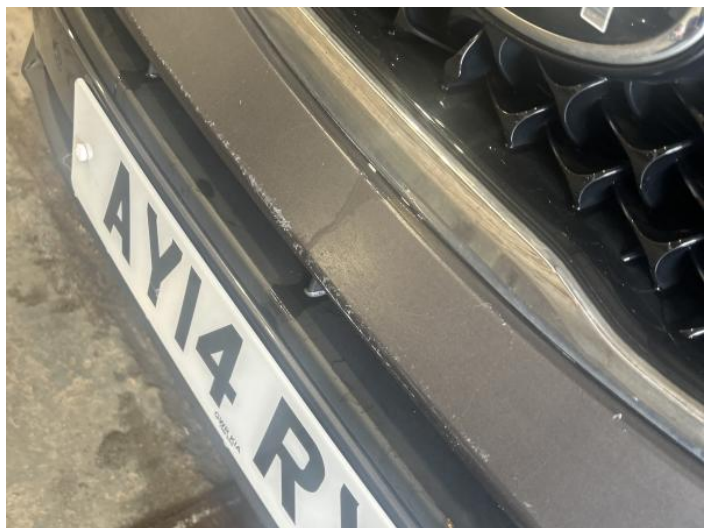
20: Bumper Front Scratched Over 100mm Thru Paint