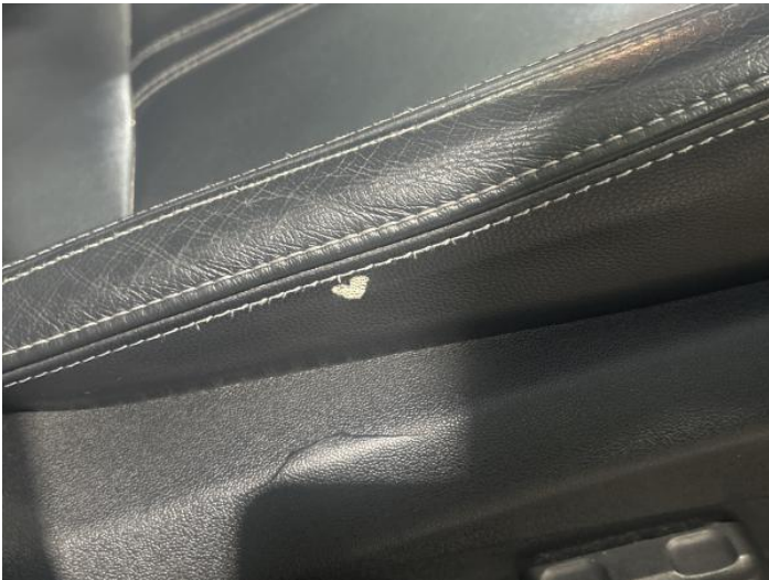
1: Seat Base Cover of Torn UpTo 3mm