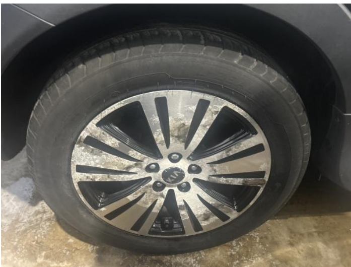
7: Wheel osr Corroded Light