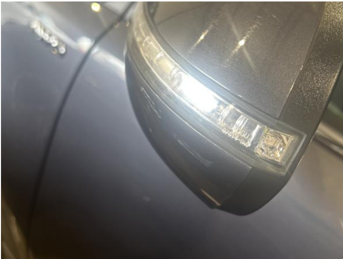
17: Door Mirror Assy nsf Scratched (Painted) Over 25mm Not Thru Paint