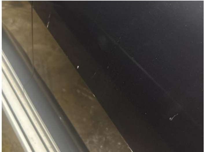
4: Door osf Scratched Over 25mm Thru Paint