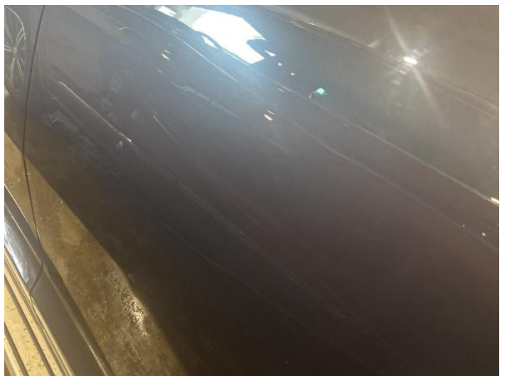
14: Door nsr Scratched Over 25mm Not Thru Paint