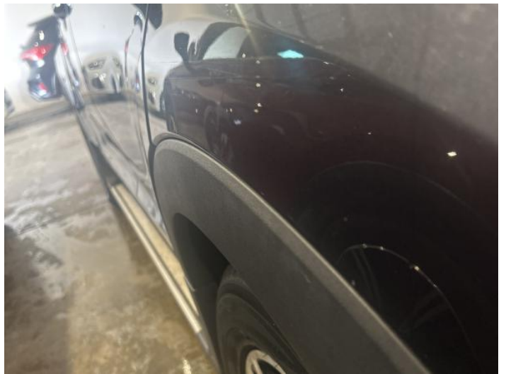
12: Qtr Panel nsr Dented 2 Or Less Up To 10mm