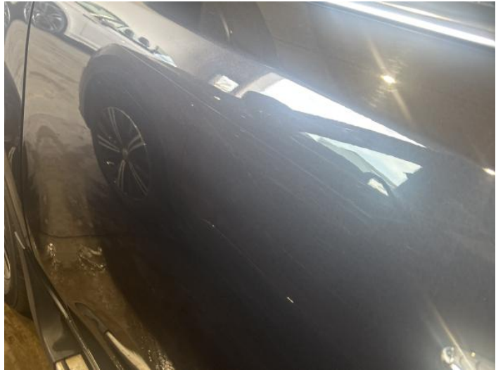
16: Door nsf Scratched Over 25mm Not Thru Paint