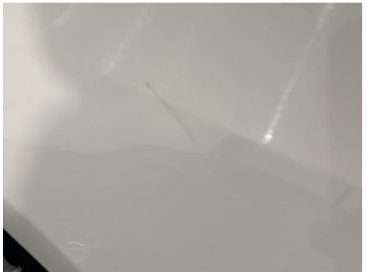
12: Wing nsf Scratched Over 25mm Thru Paint