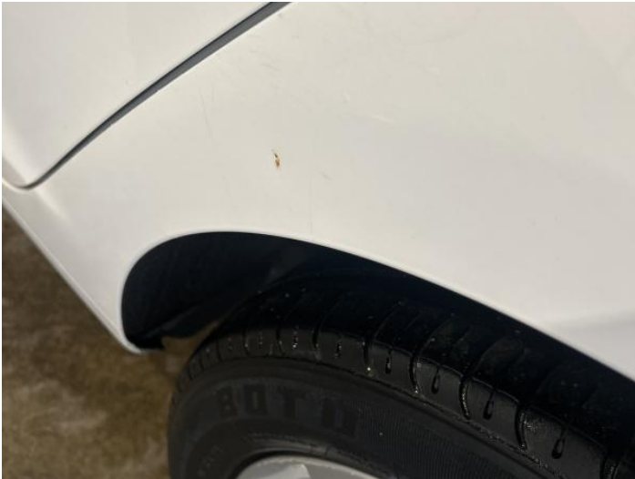
9: Qtr Panel nsf Chipped 1 To 5