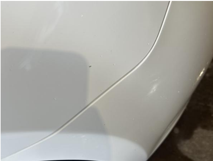
1: Wing osf Chipped 1 To 5