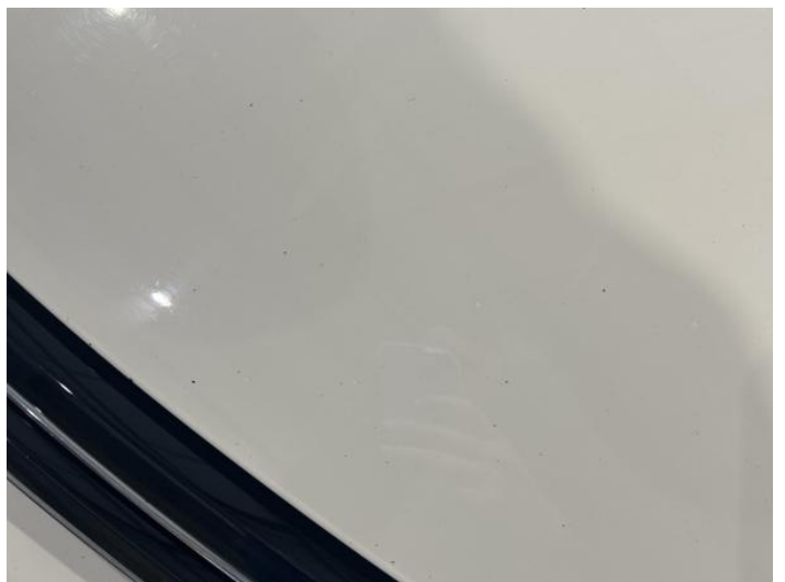
14: Bonnet Chipped Multiple Chips