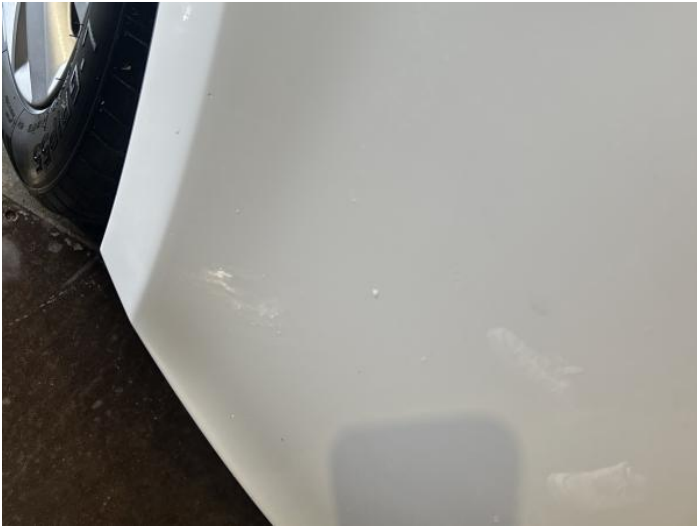
15: Bumper Front Chipped Multiple Chips