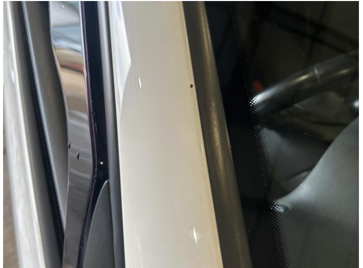
16: A Post os Chipped 1 To 5