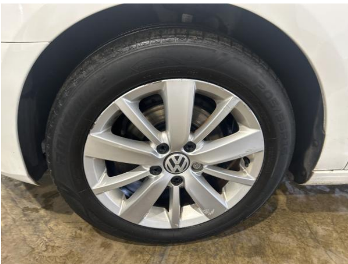
13: Wheel nsf Scratched Over 50mm