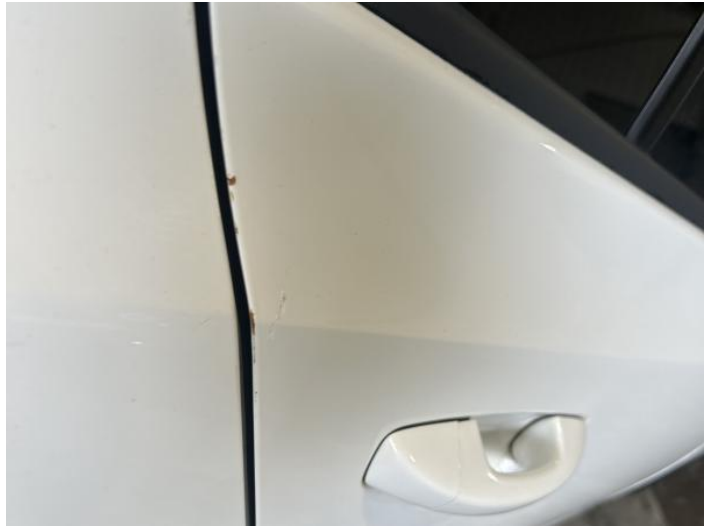
4: Door osr Chipped Edge Chip