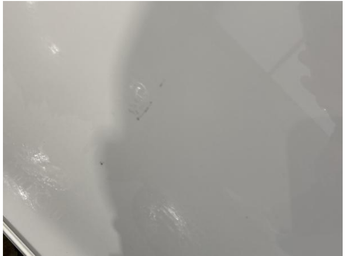
10: Door nsf Scratched UpTo 25mm Not Thru Paint