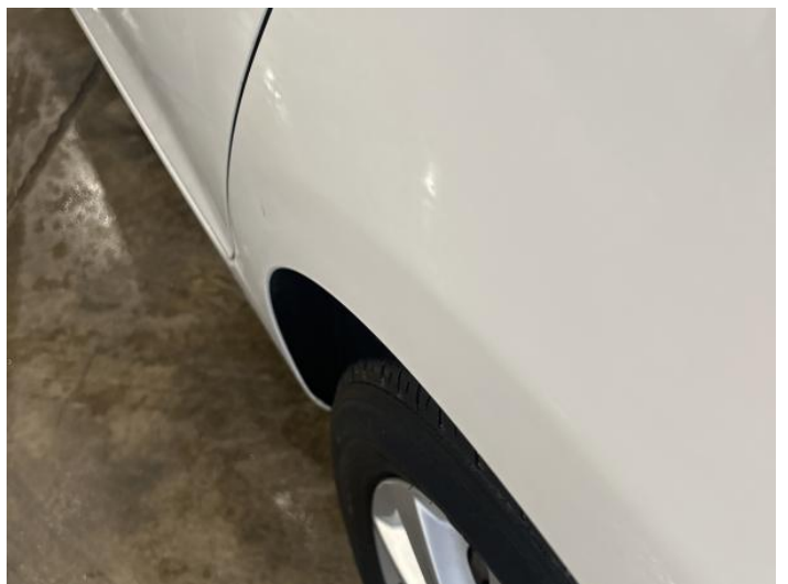
8: Qtr Panel nsr Dented 2 Or Less UpTo 10mm