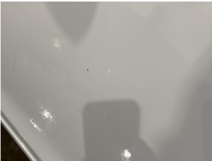
11: Door nsf Chipped 1 To 5