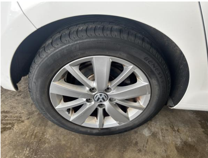
5: Wheel osr Scratched Over 50mm