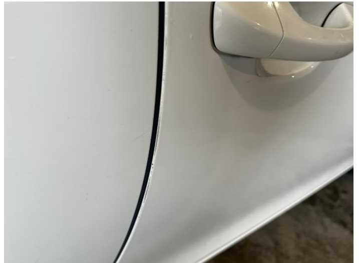
2: Door osf Chipped Edge Chip