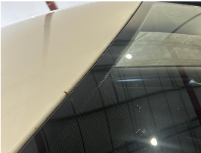
17: Roof Chipped Edge Chip