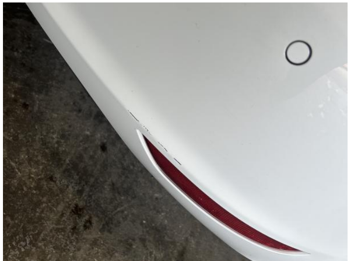
6: Bumper Rear Scratched 25 to 100mm Thru Paint