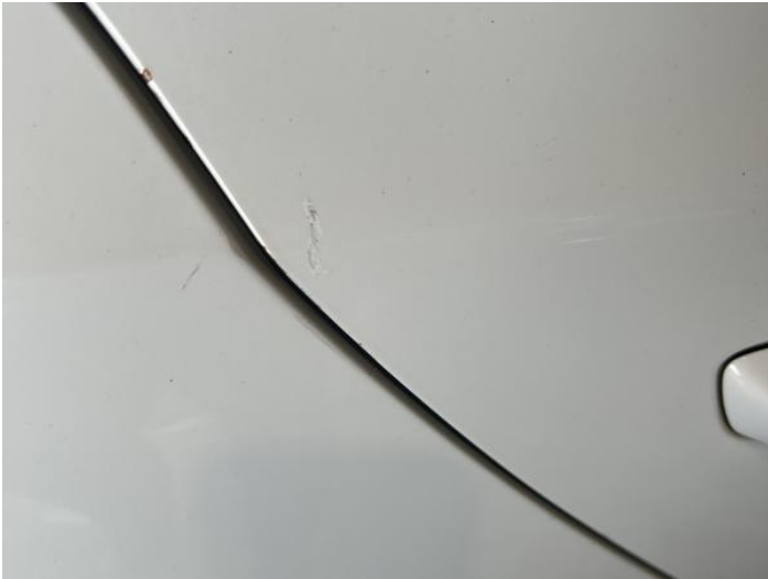
3: Door osr Scratched UpTo 25mm Thru Paint