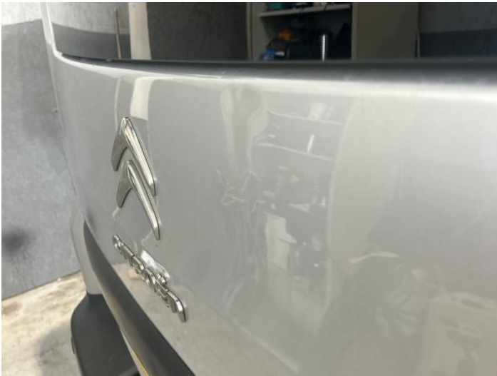
5: Tailgate Dented Over 30mm