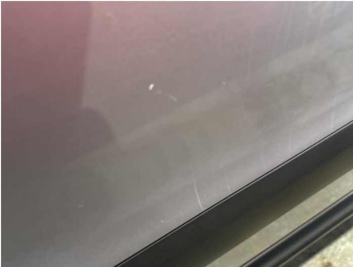
3: Door osr Chipped 1 To 5