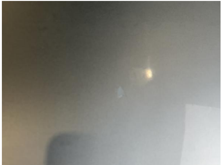
12: Bonnet Poor Previous Repair Paint Flake