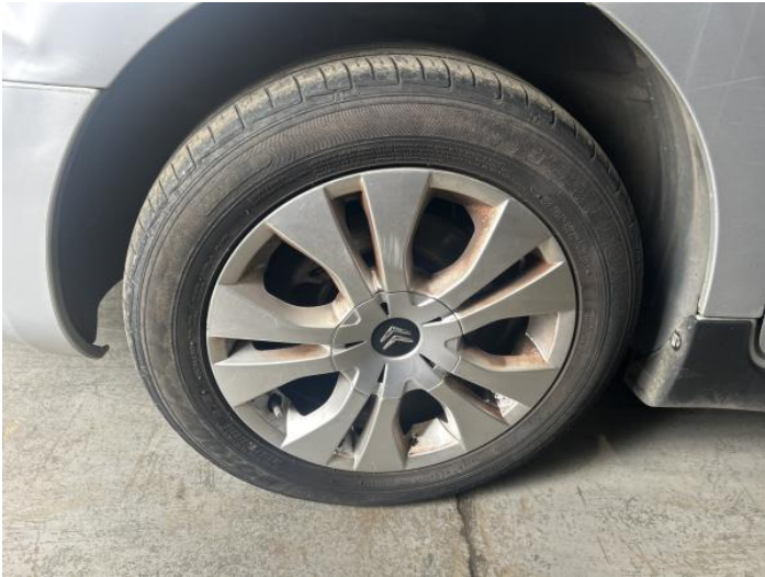
9: Wheel nsf Scratched Over 50mm