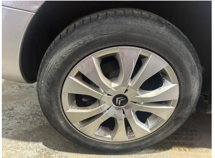
4: Wheel osr Scratched Over 50mm