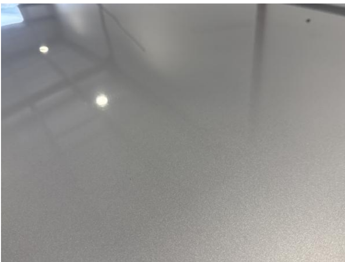
13: Roof Dented Over 30mm