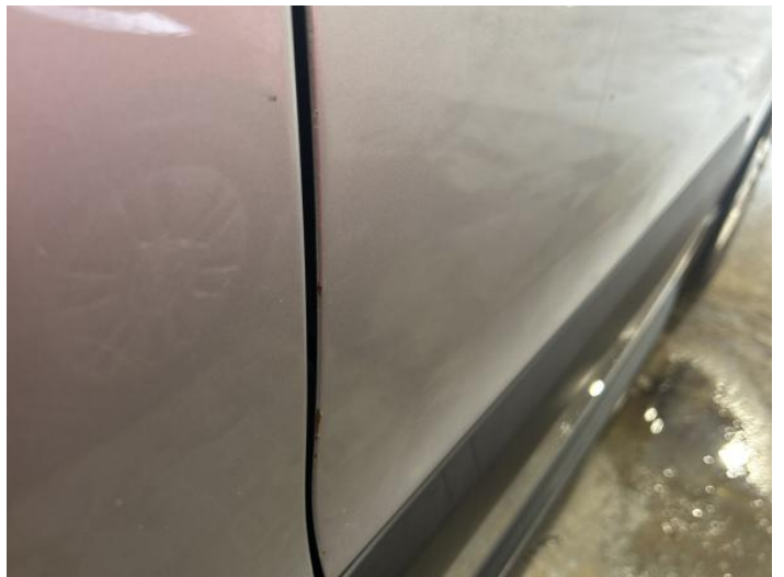
2: Door osf Chipped Edge Chip