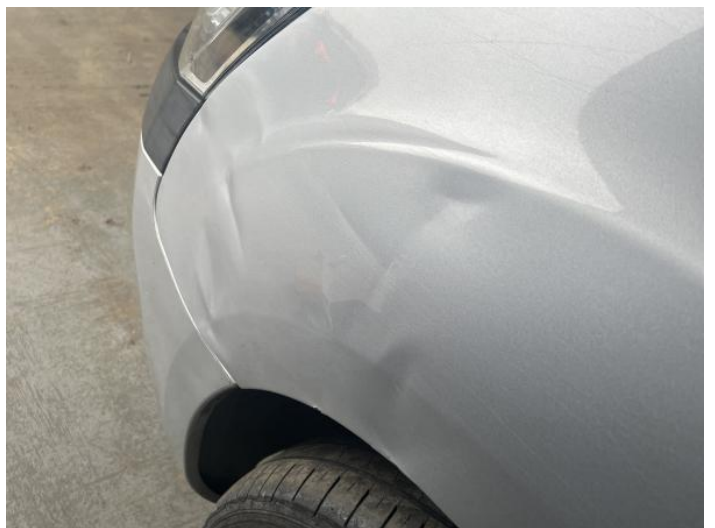
8: Wing nsf Dented Over 30mm