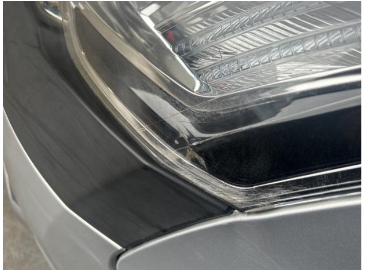
10: Headlamp ns Broken Replace