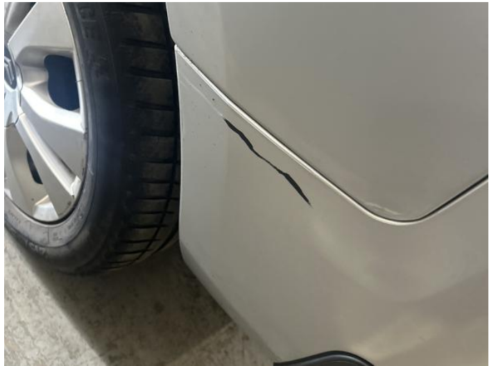
6: Bumper Rear Scratched 25 to 100mm Thru Paint