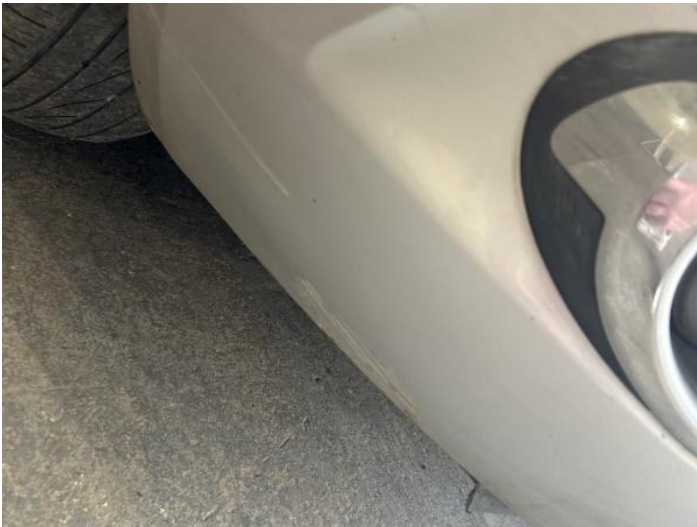
11: Bumper Front Scratched Over 100mm Thru Paint