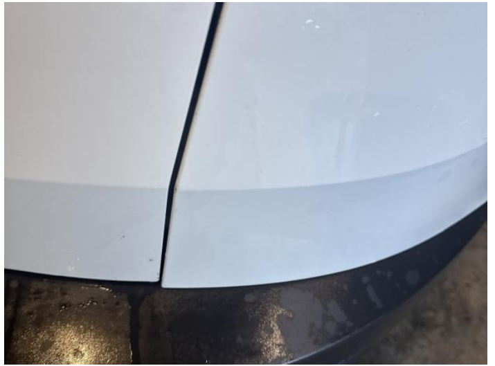
6: Bumper Rear Chipped 1 To 5