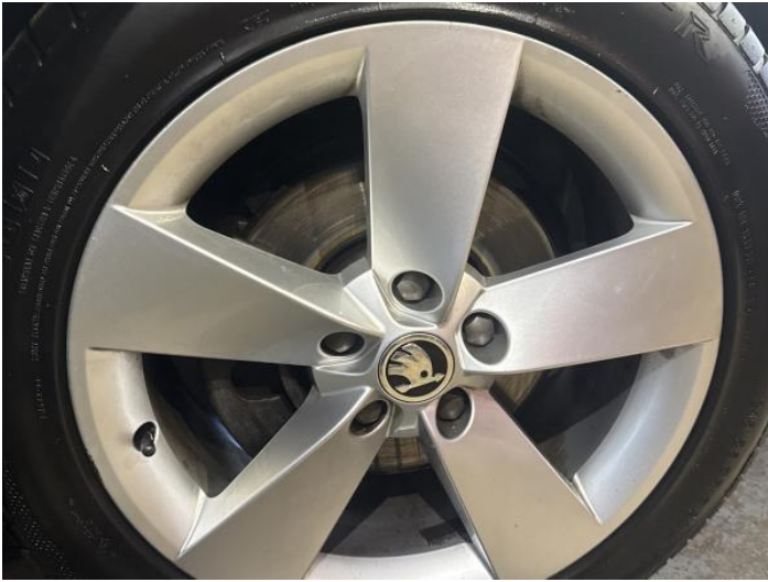
3: Wheel nsf Scratched Up To 50mm