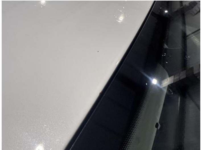
9: Wing osf Dented With Paint Damage