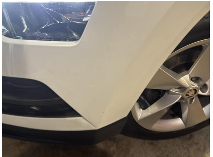
2: Bumper Front Chipped 1 To 5