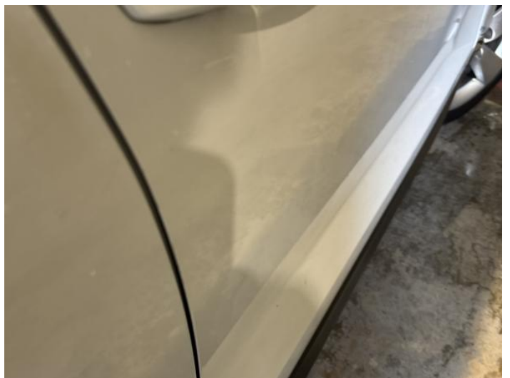
8: Door osf Chipped Edge Chip