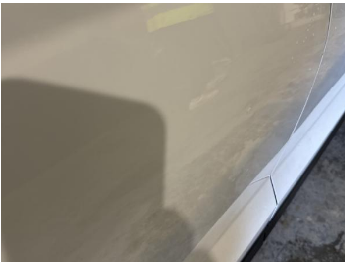
7: Door osr Dented Between 10mm + 30mm