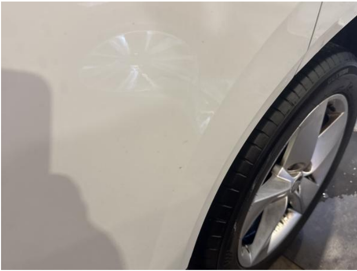
5: Door osr Chipped 1 To 5