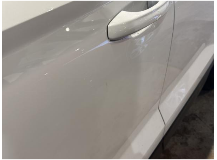
4: Door nsf Dented Over 30mm